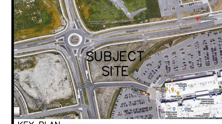
KEY PLAN NTS

PLAN OF SURVEY PART 1 - PLAN OF SURVEY OF PART OF BLOCK 6 PLAN 4M-1566 AND PART OF LOT 3 CONCESSION 1 GEOGRAPHIC TOWNSHIP OF HUNTLEY CITY OF OTTAWA