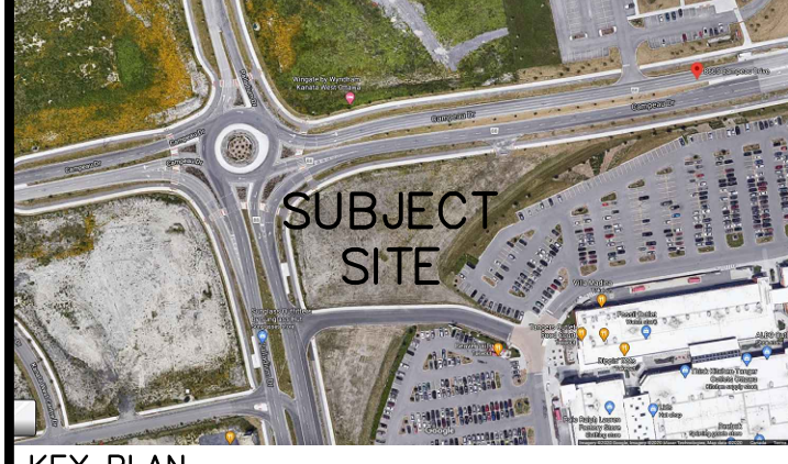
KEY PLAN NTS

PLAN OF SURVEY PART 1 - PLAN OF SURVEY OF PART OF BLOCK 6 PLAN 4M-1566 AND PART OF LOT 3 CONCESSION 1 GEOGRAPHIC TOWNSHIP OF HUNTLEY CITY OF OTTAWA