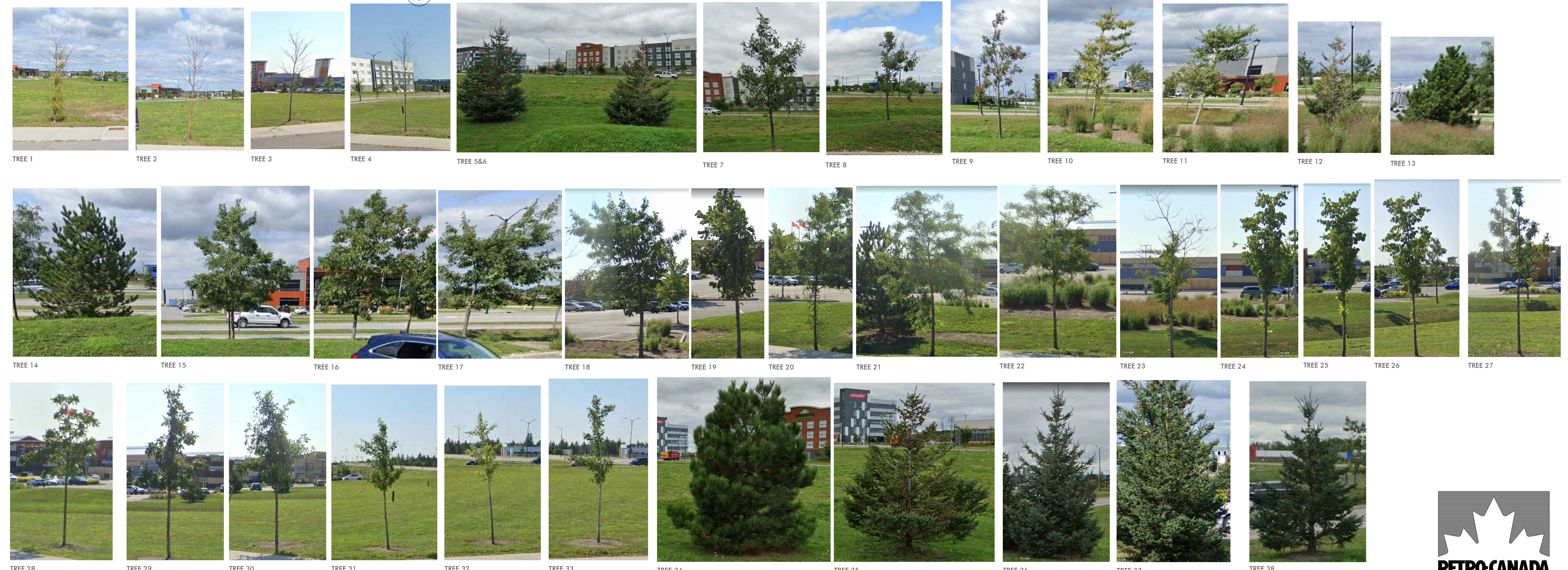
2 EXISTING TREE IMAGES TC1