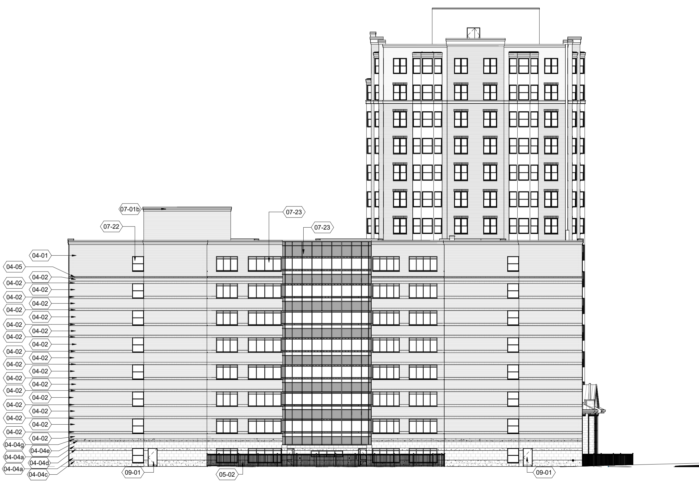
SOUTH ELEVATION 1:275 WHEN PLOTTED ON A1 SIZED SHEET