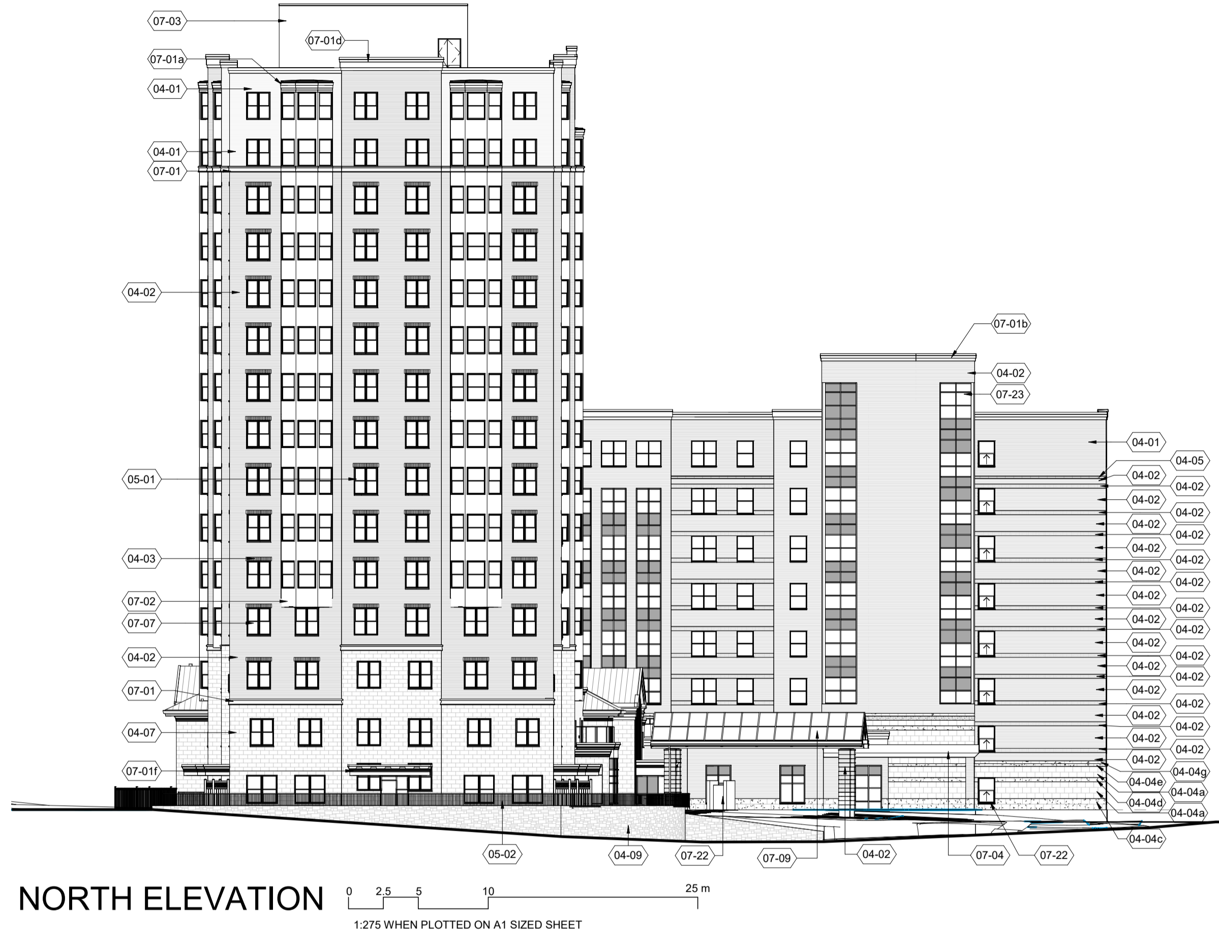
NORTH ELEVATION 1:275 WHEN PLOTTED ON A1 SIZED SHEET