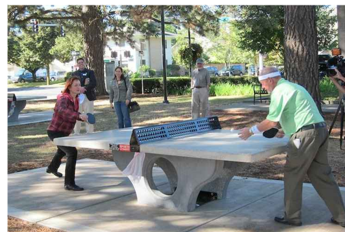
CONCRETE PING PONG TABLE