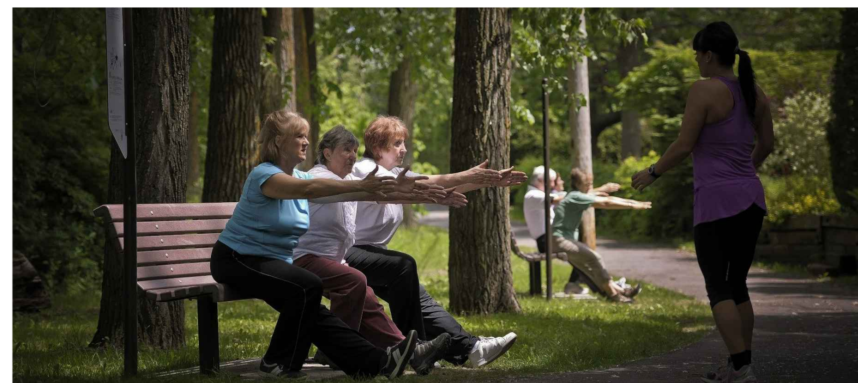
ACCESSIBLE BENCH WITH BENCH FIT