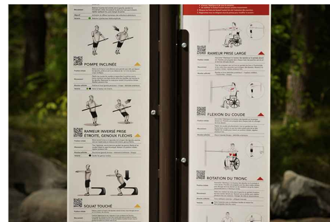
BENCH FIT SIGN