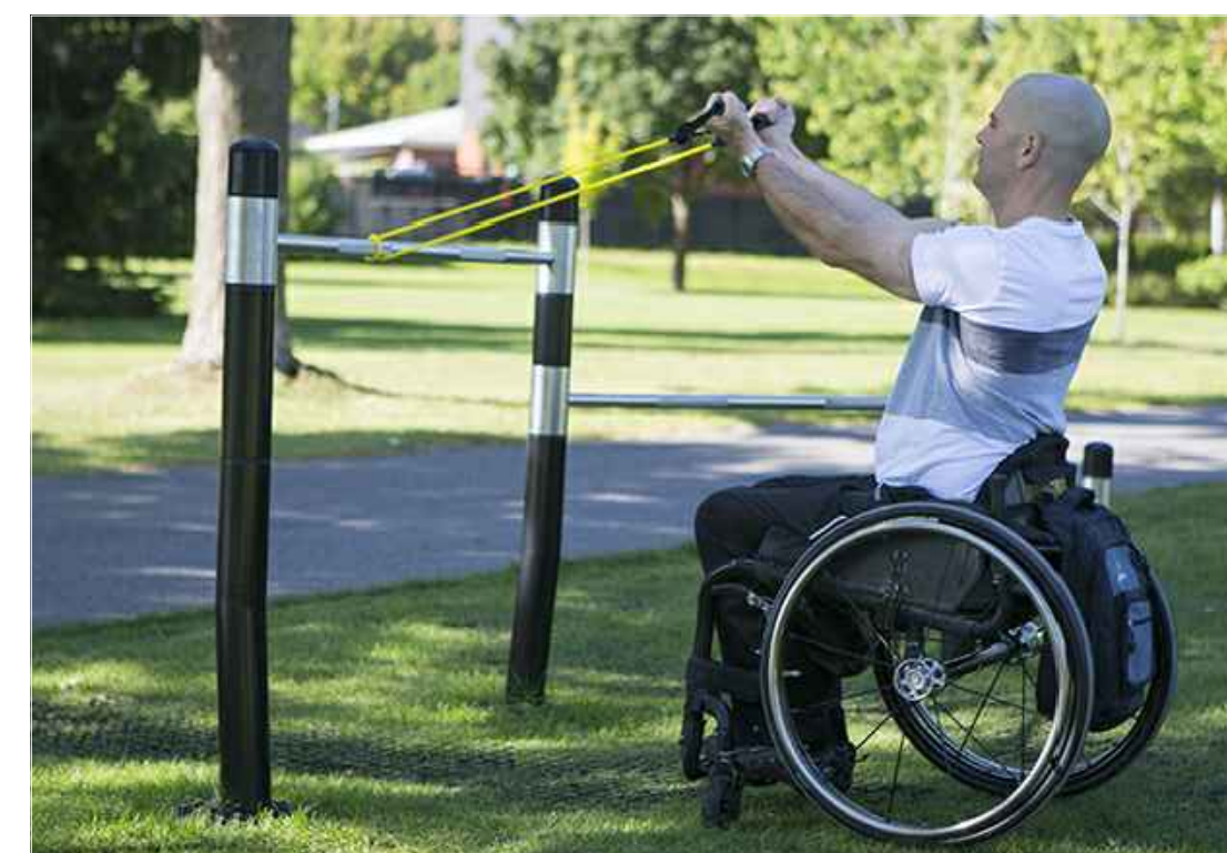
FITNESS STATION WITH ACCESSIBLE EQUIPMENT