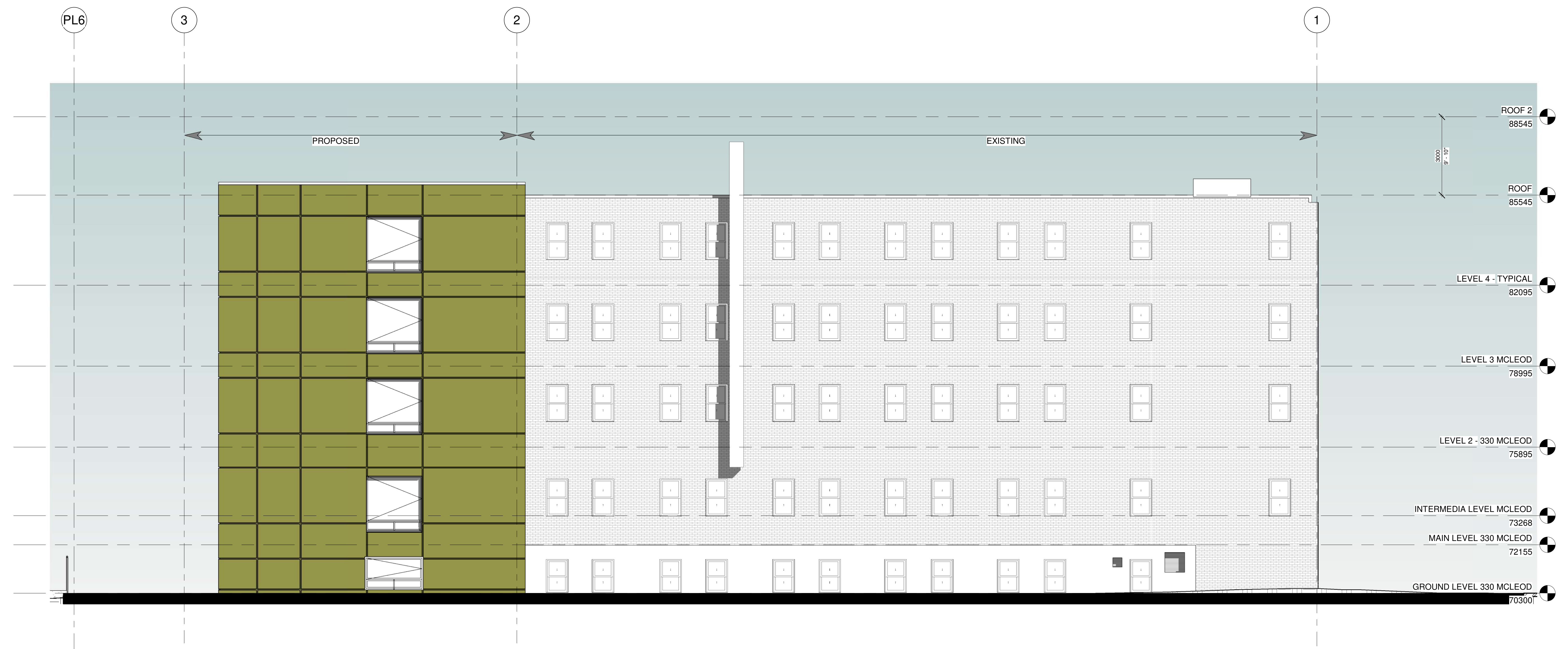
2 EAST ELEVATION 330 MCLEOD A103 1:75

PLANNER: FOTENN CLIENT: SMART LIVING PROPERTIES 226 ARGYLE AVENUE - OTTAWA - ARCHITECT: WOODMAN ARCHITECT ASSOCIATES LTD. 4 BEECHWOOD, SUITE 201 OTTAWA, ONTARIO, CANADA K1L 8L9 TEL: 613 228 9850 • FAX: 613 228 9848 • mail@woodmanarchitect.com