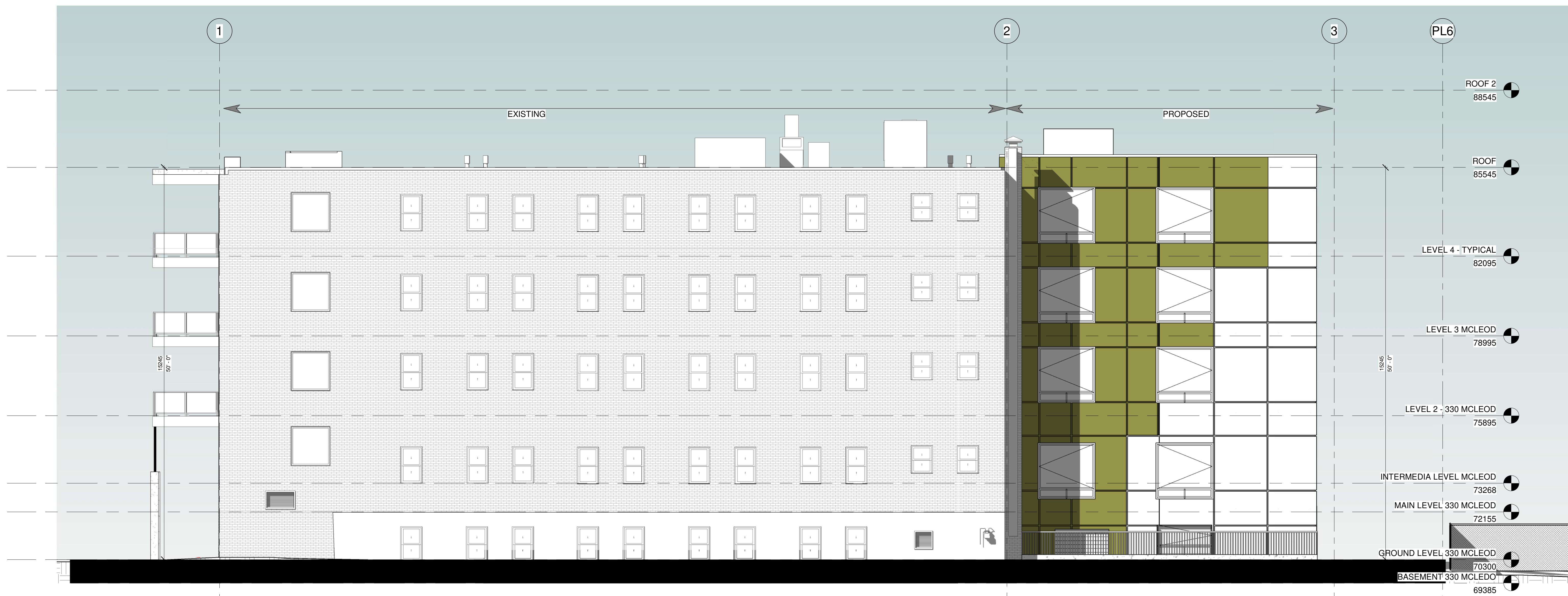
2 WEST - ELEVATION A104 1:75