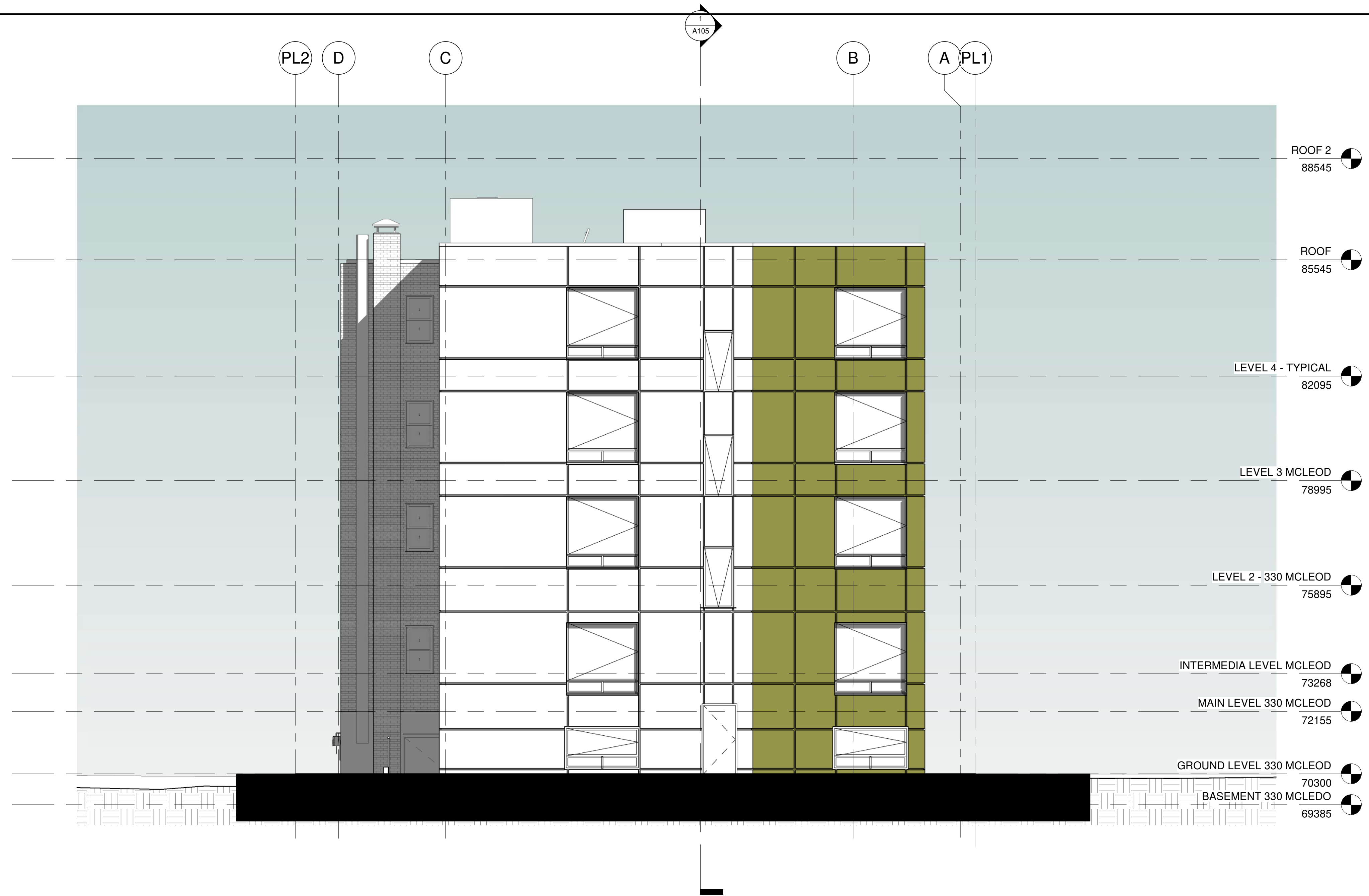
1 SOUTH ELEVATION A104 1:75