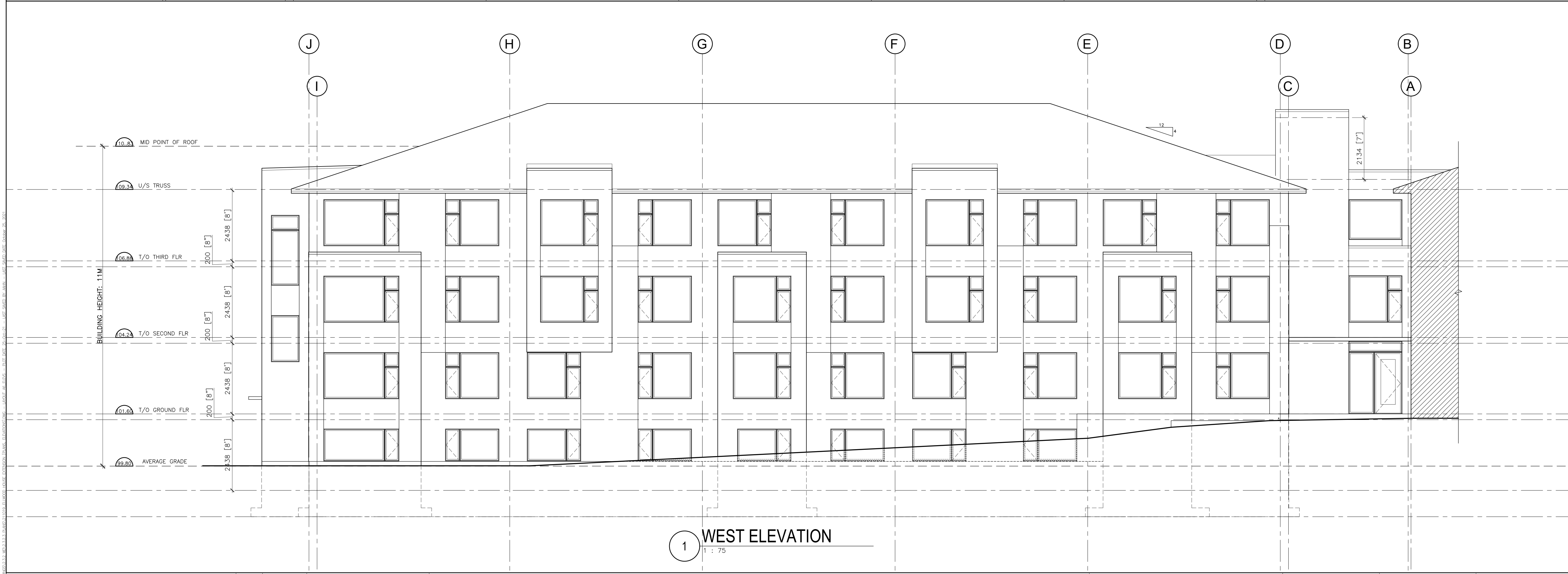
1 WEST ELEVATION 1 : 75

GENERAL NOTES IT IS THE RESPONSIBILITY OF THE CONTRACTOR TO VERIFY ALL DIMENSIONS ON SITE AND REPORT ANY ERRORS AND OMISSIONS TO THE ARCHITECT. ALL CONTRACTORS MUST COMPLY WITH ALL PERTINENT CODES AND BY-LAWS. DO NOT SCALE DRAWINGS. THESE DRAWINGS MAY NOT BE USED FOR CONSTRUCTION UNTIL SIGNED. THIS DRAWING IS THE EXCLUSIVE PROPERTY OF COLIZZA BRUNI ARCHITECTURE INCORPORATED. COPYRIGHT RESERVED.