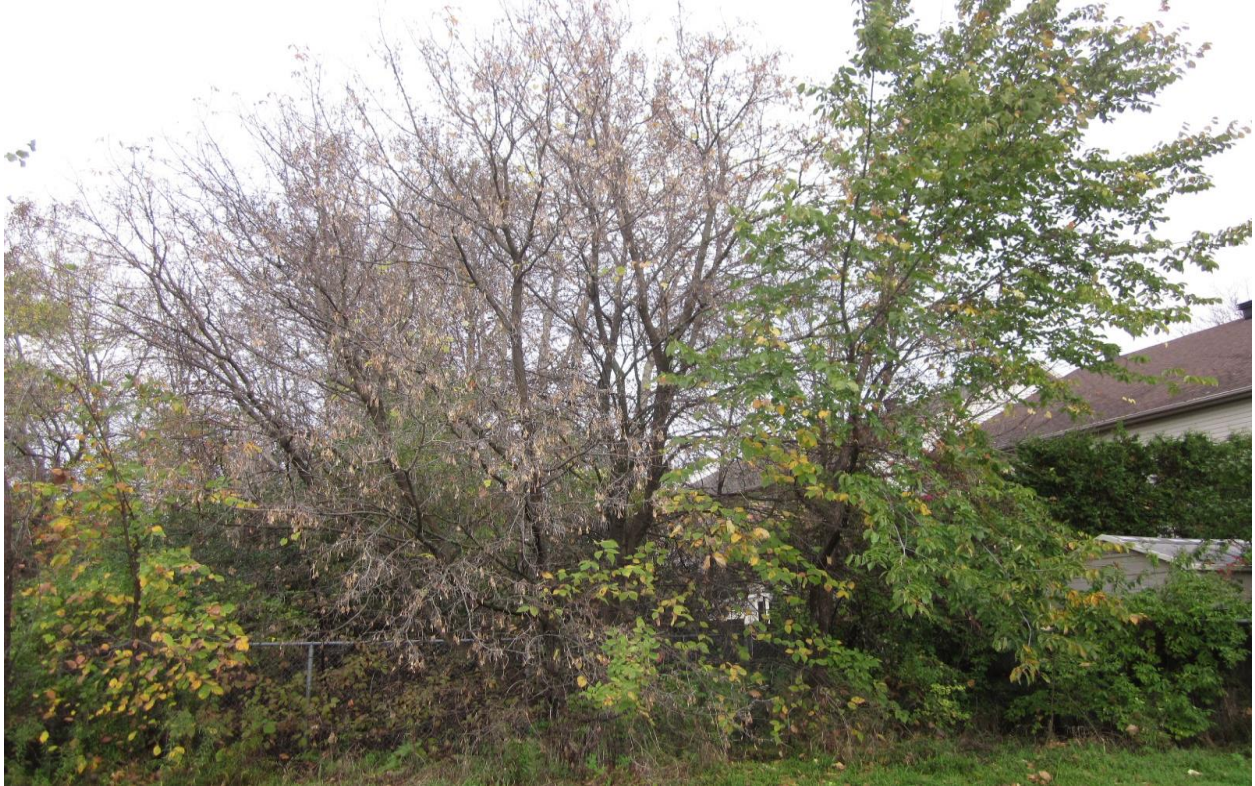
Picture 2. Trees #5 and 6, white elm and Manitoba maple (right to left) at 16 Edgewater Street