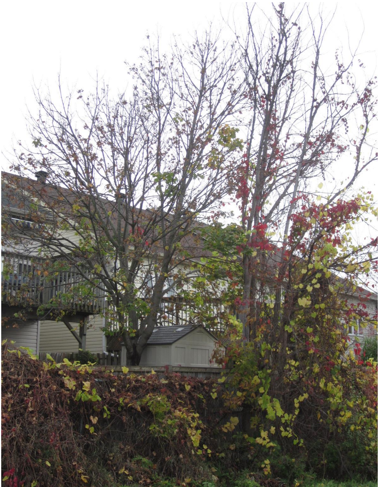
Picture 1. Trees #2 and 3, Norway maple and dead elm (left to right) at 16 Edgewater Street