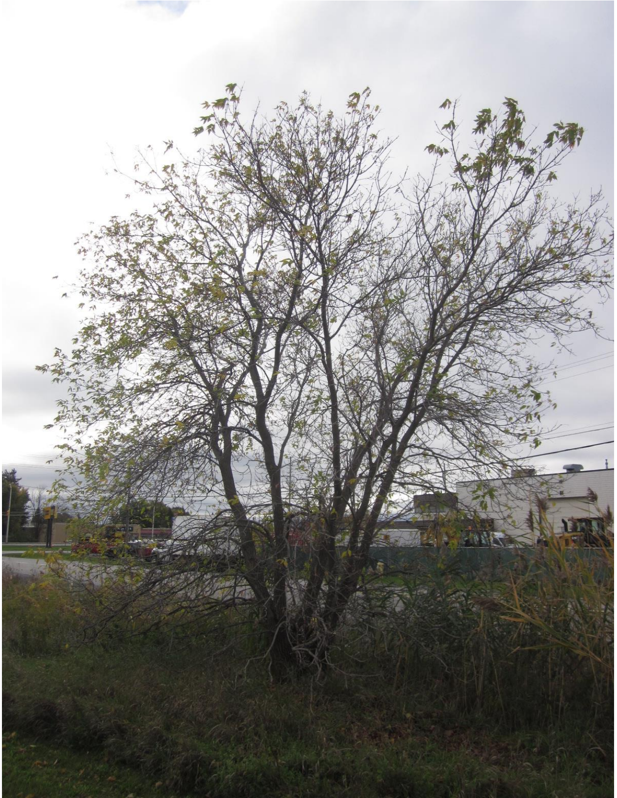
Picture 4. Tree #8, Manitoba maple on city property adjacent to 16 Edgewater Street