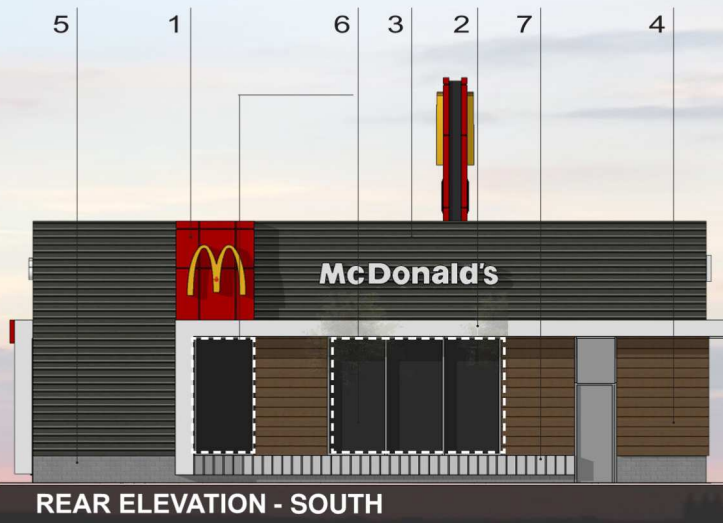
REAR ELEVATION - SOUTH