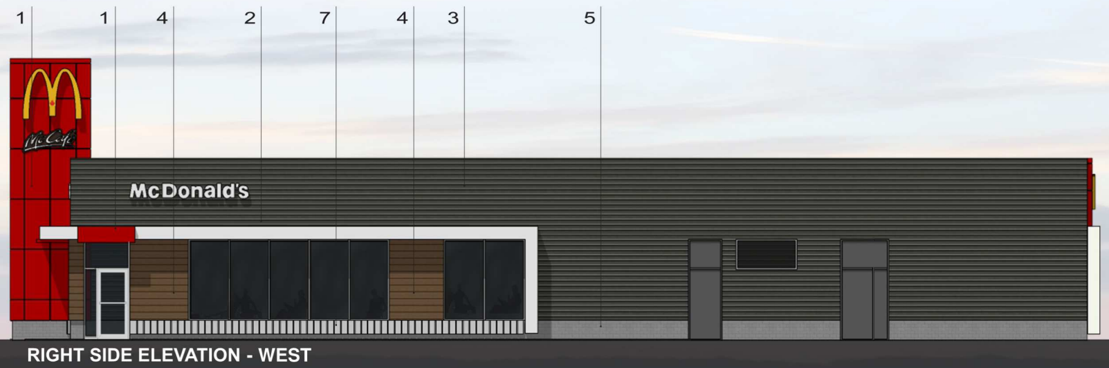
RIGHT SIDE ELEVATION - WEST