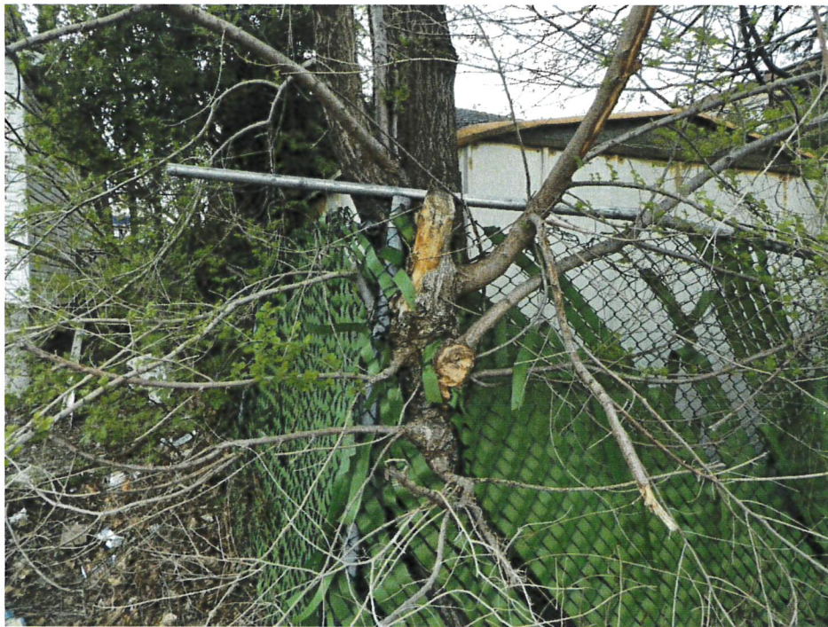
Photo 4: View of the Siberian Elm proposed for removal. May 7, 2021.