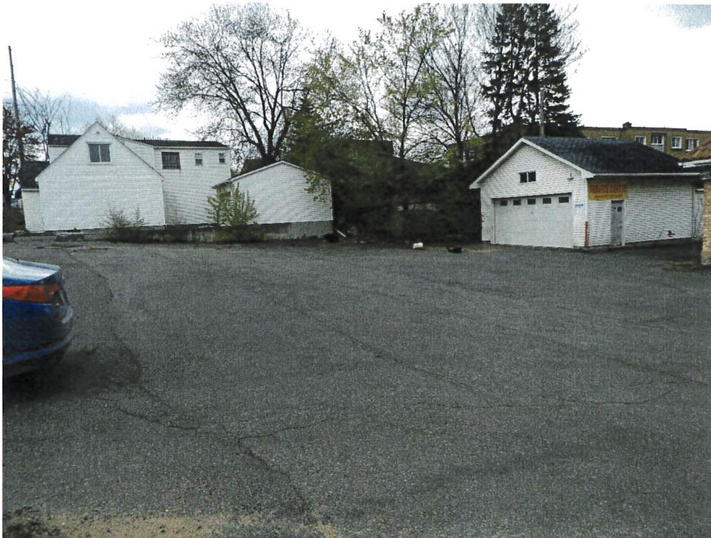
Photo 2: View of the subject property from the northwest corner facing southeast. May 7, 2021.