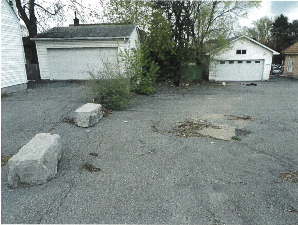
Photo 3: View of the subject property from the northeast corner facing south. May 7, 2021.