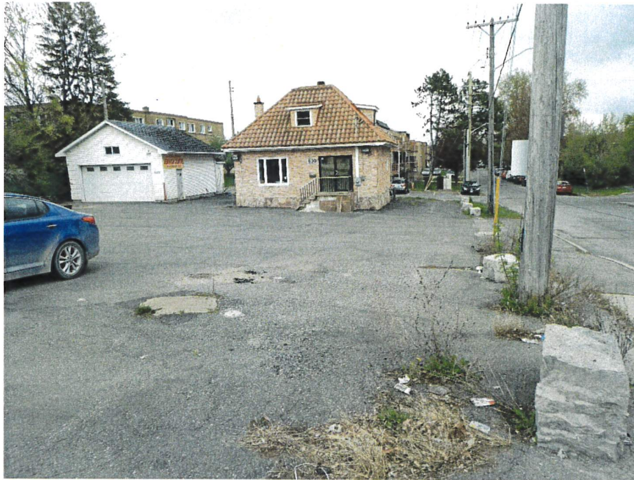
Photo 1: View of the subject property from the northwest corner facing south. May 7, 2021.