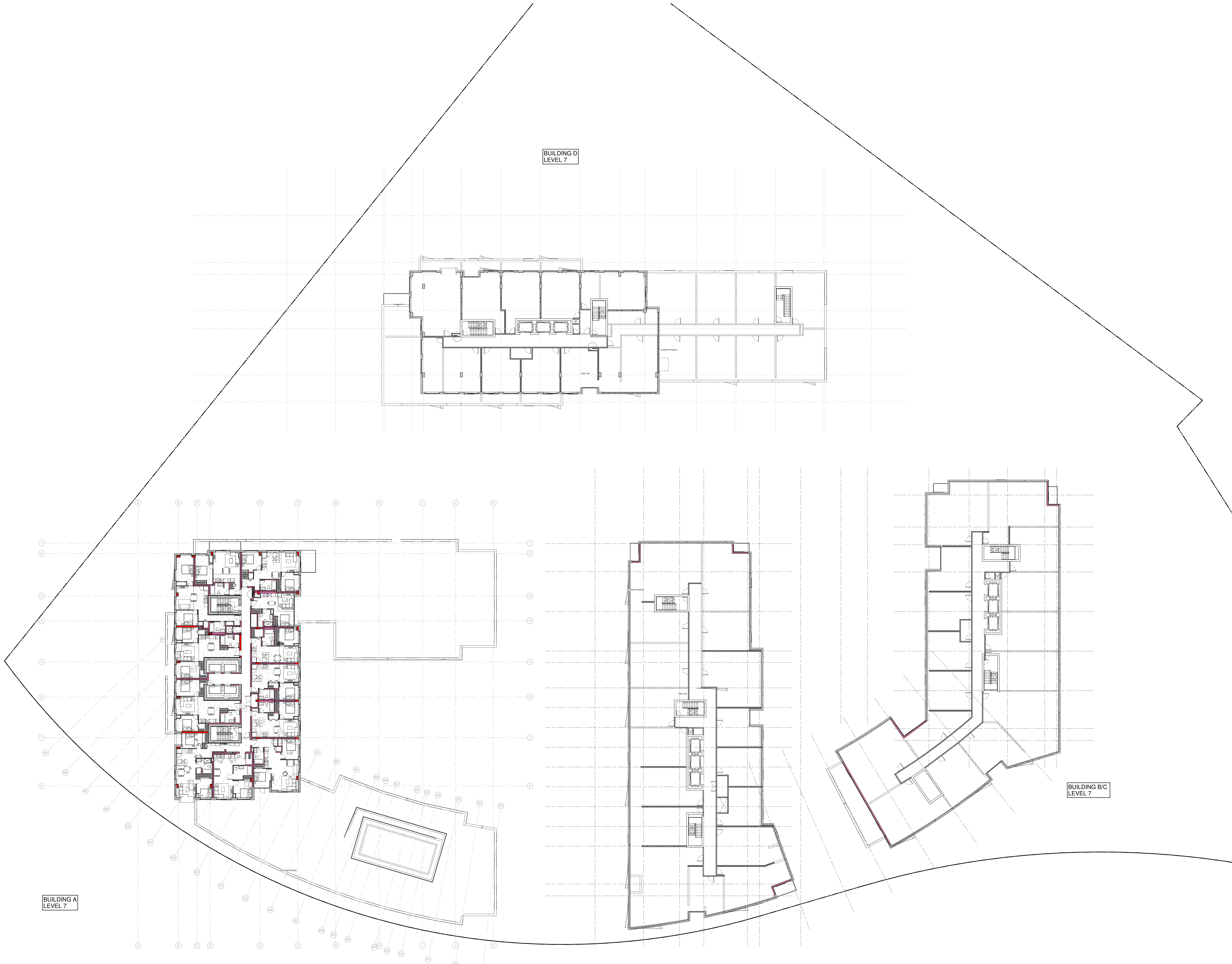
BUILDING D LEVEL 7