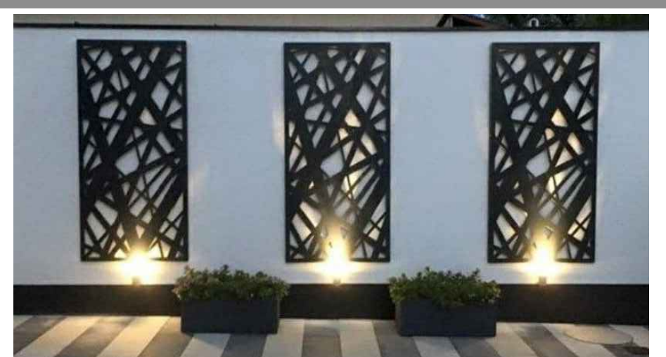
LASER CUT PANELS ALONG THE PARKING RAMP