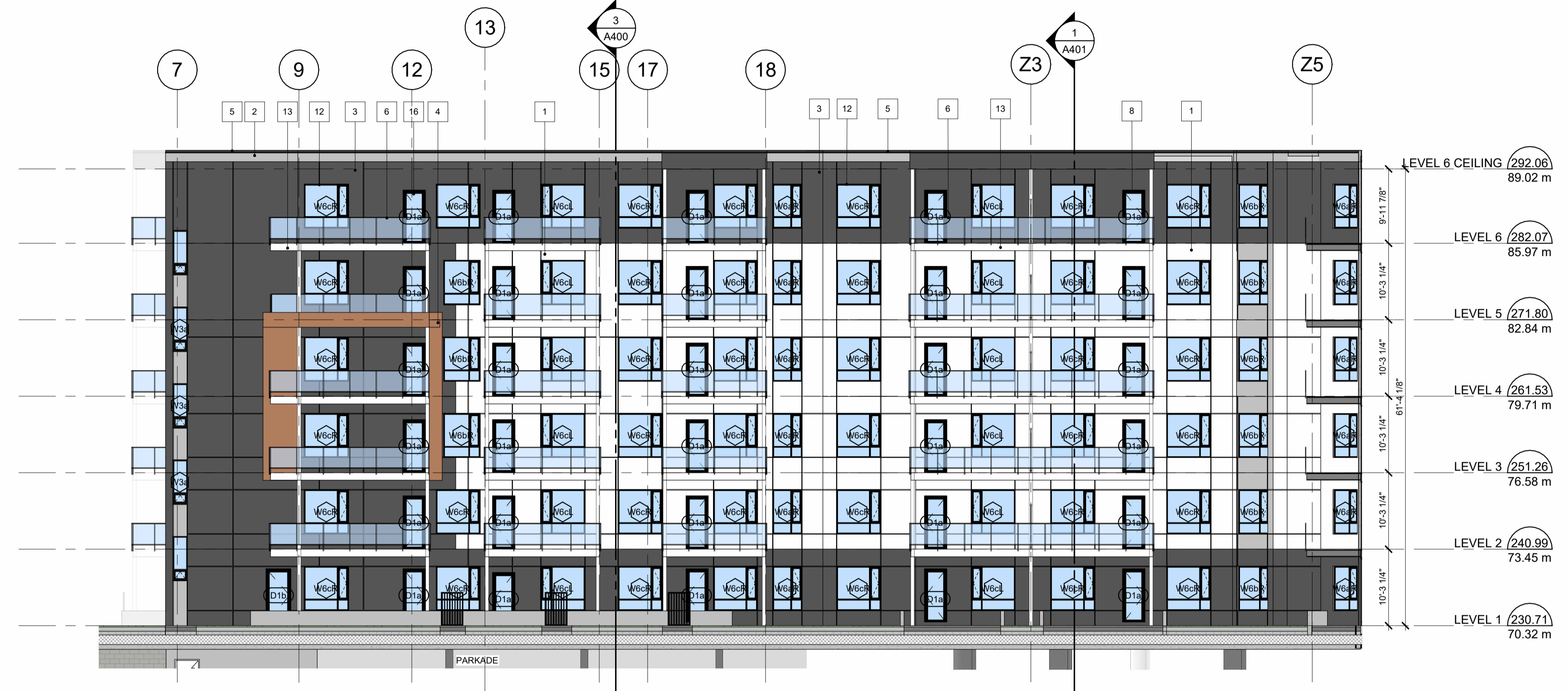
2 COURTYARD - NORTH ELEVATION 3/32" = 1'-0"