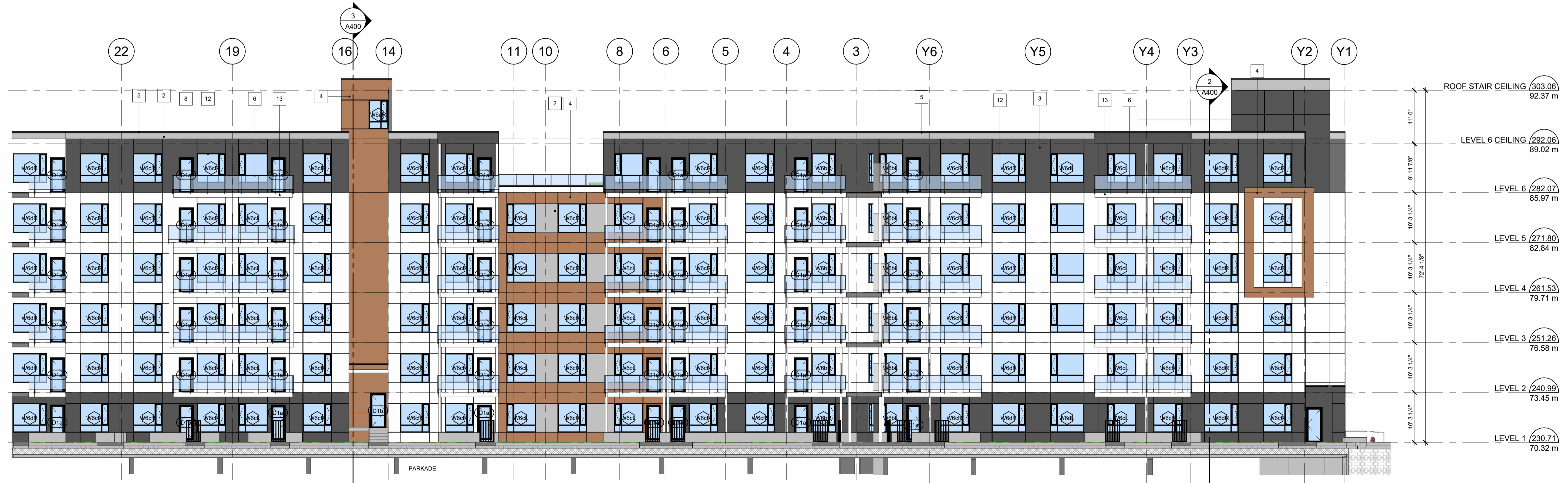
4 COURTYARD - SOUTH ELEVATION 3/32" = 1'-0"