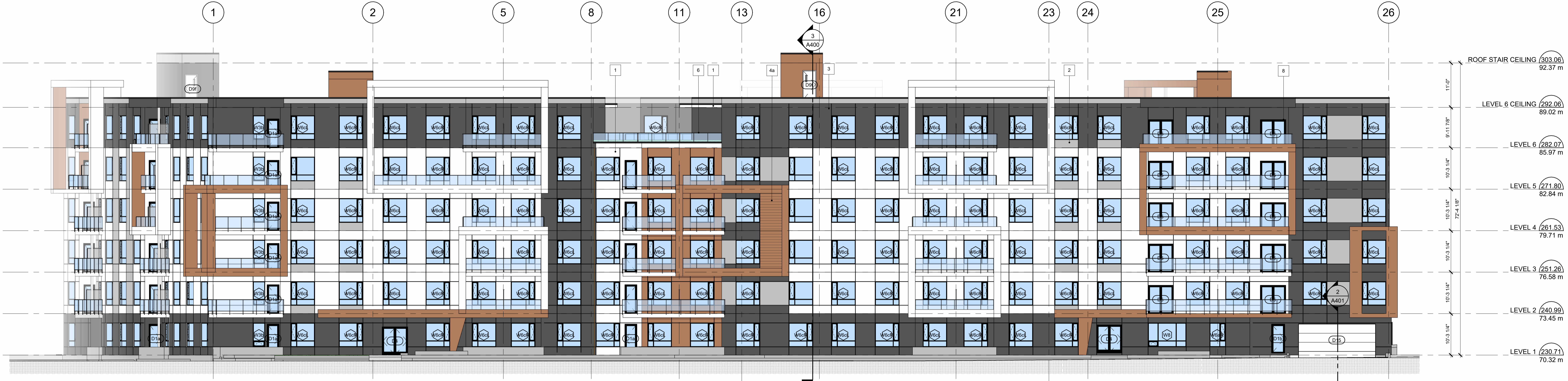
1 SOUTH ELEVATION 3/32" = 1'-0"

APPROVED By Allison Hamlin at 4:31 pm, Jul 17, 2024