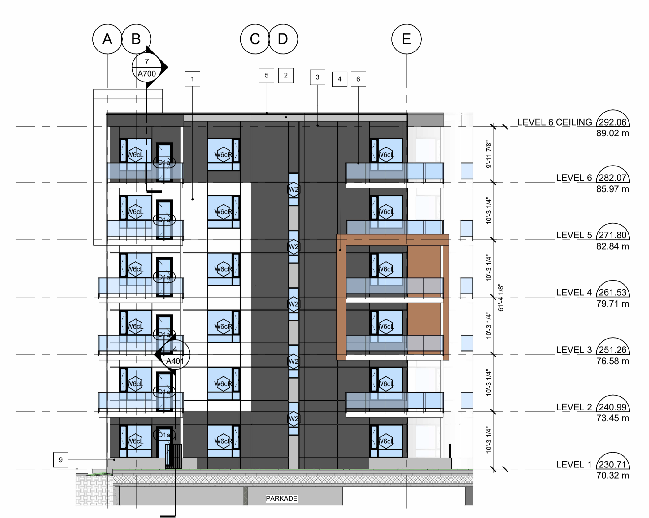
1 COURTYARD - EAST ELEVATION 3/32" = 1'-0"

APPROVED By Allison Hamlin at 4:31 pm, Jul 17, 2024