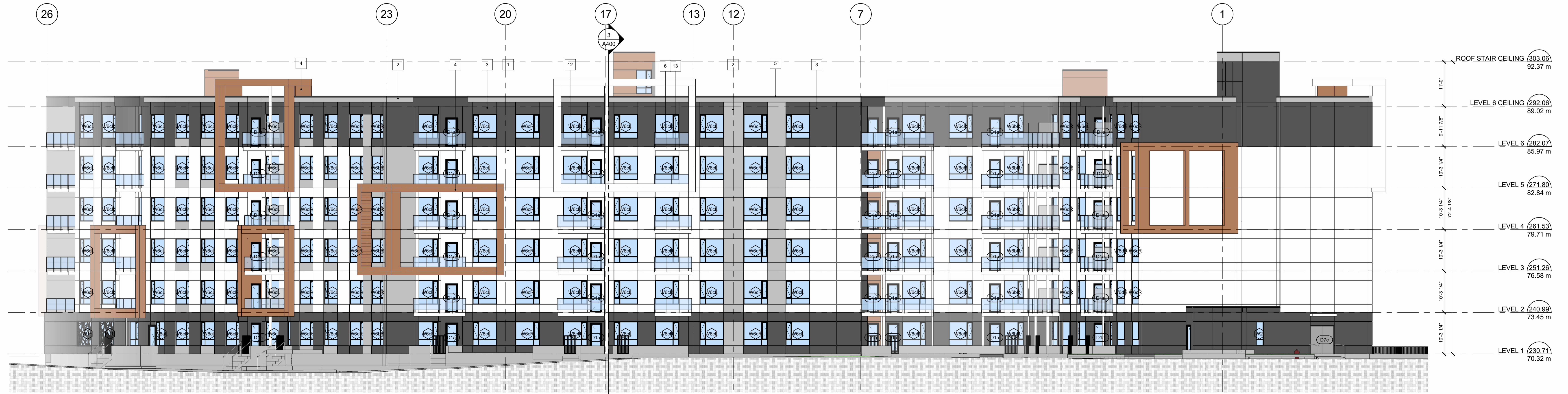
2 NORTH ELEVATION 3/32" = 1'-0"

BUILDER'S RESPONSIBILITY TO LAYOUT WORK It is the Builder's responsibility to lay out and carry out the work as detailed in the contract documents. It is therefore necessary for the builder to pay very close attention to actual site dimensions, geometries and conditions which may vary from those assumed on the drawings. Any discrepancies which the Builder discovers within the contract documents themselves or between the contract documents & site conditions, are to be discussed with the Architect immediately before proceeding with any work. Written dimensions shall have precedence over scaled dimensions. Copyright Reserved. This plan and design are, and at all times remain, the exclusive property of J+S Architect and may not be used or reproduced without written consent.