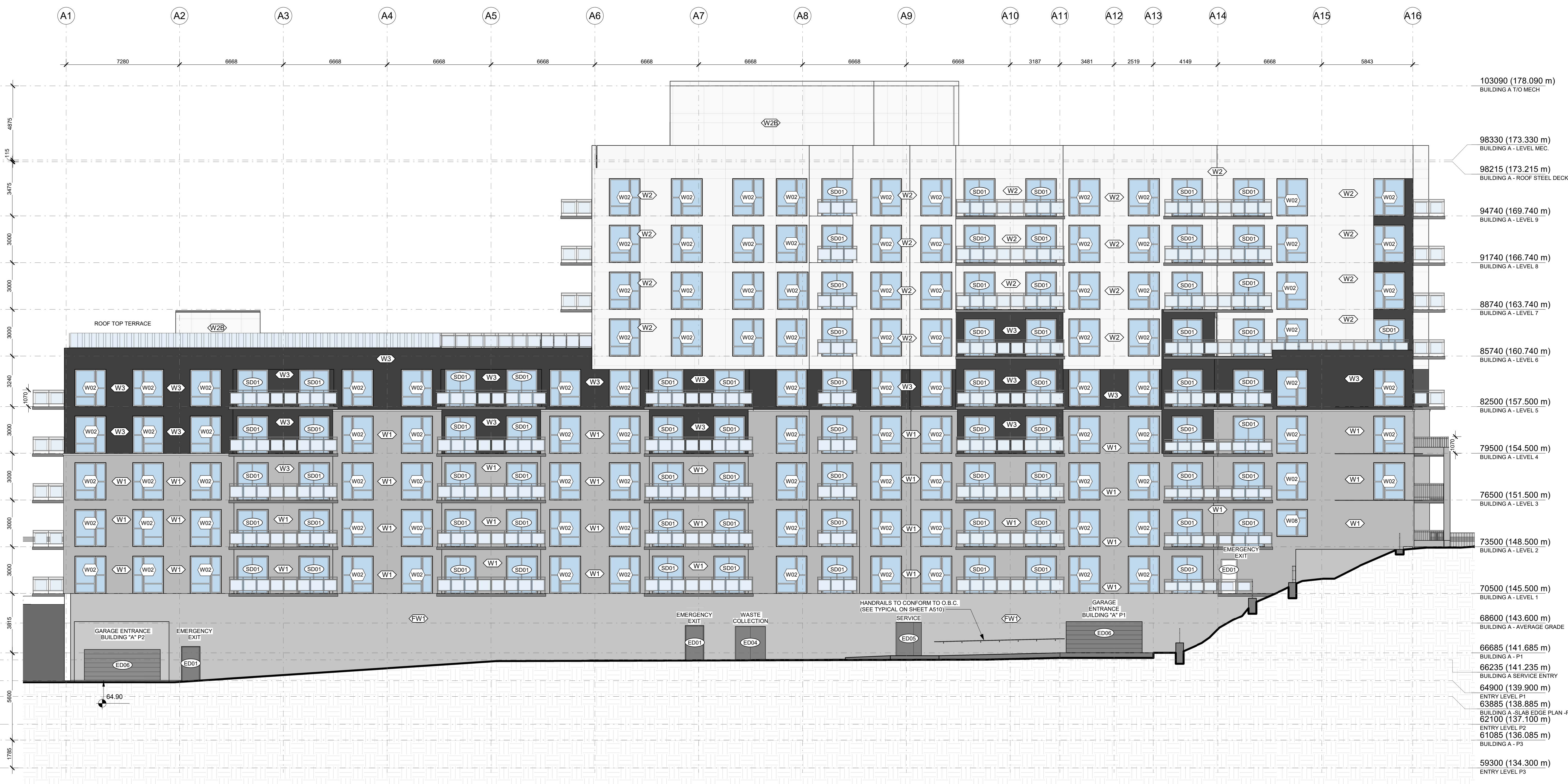
1 BUILDING A - WEST ELEVATION A300 1 : 125

APPROVED By Adam Brown at 2:09 pm, Dec 05, 2023