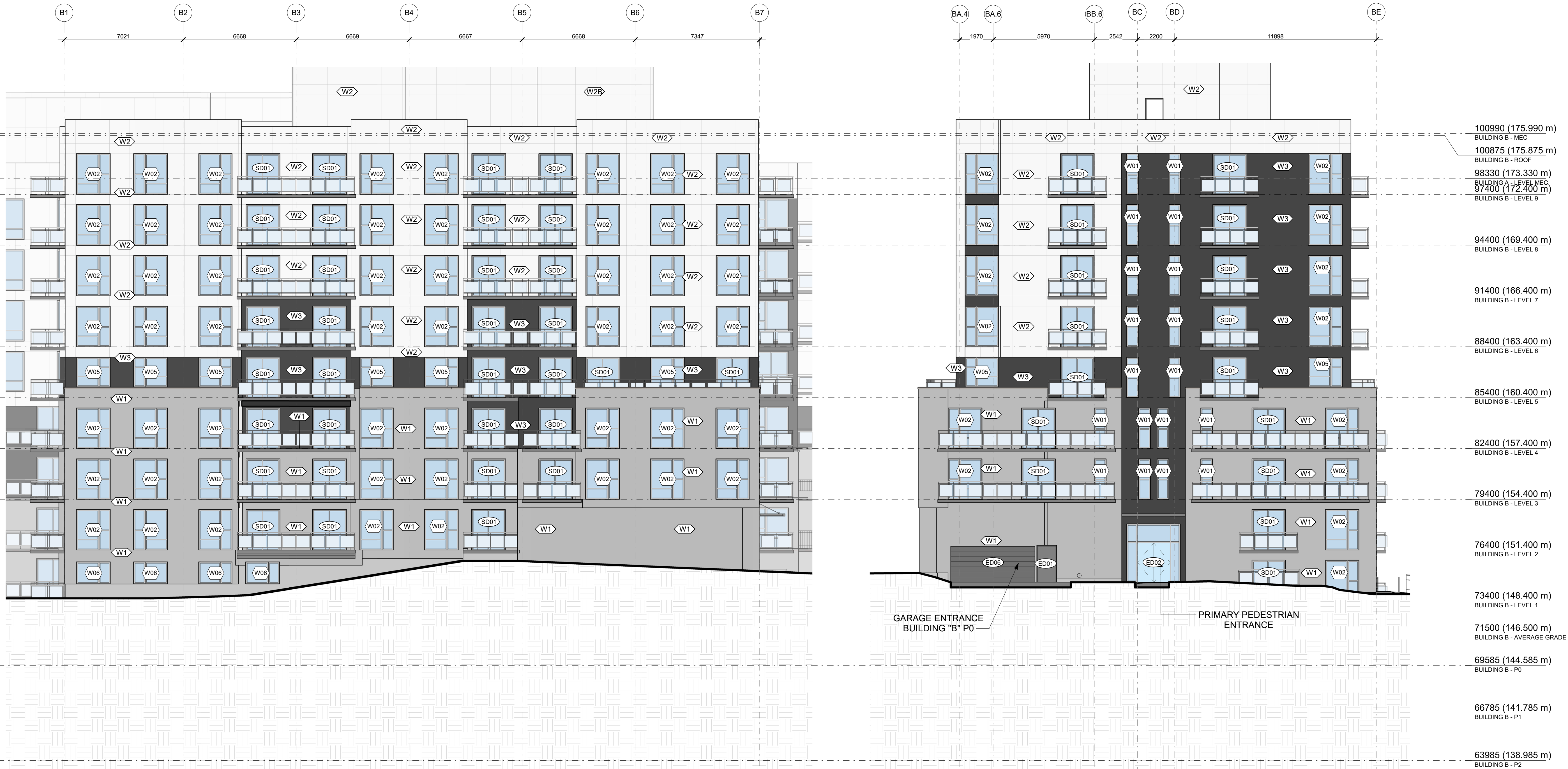
1 BUILDING B - WEST ELEVATION A304 1 : 125