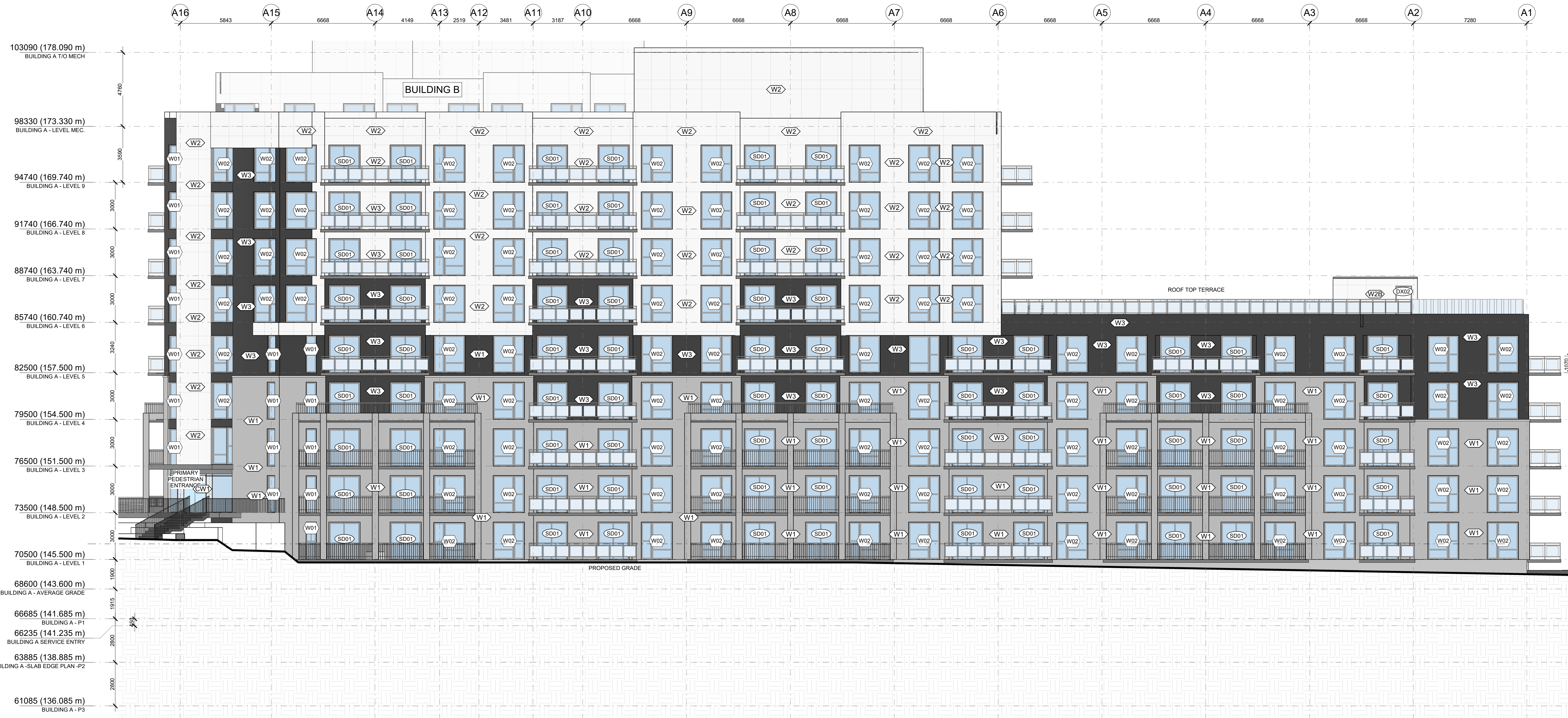
1 BUILDING A - EAST ELEVATION A302 1:125

APPROVED By Adam Brown at 2:10 pm, Dec 05, 2023