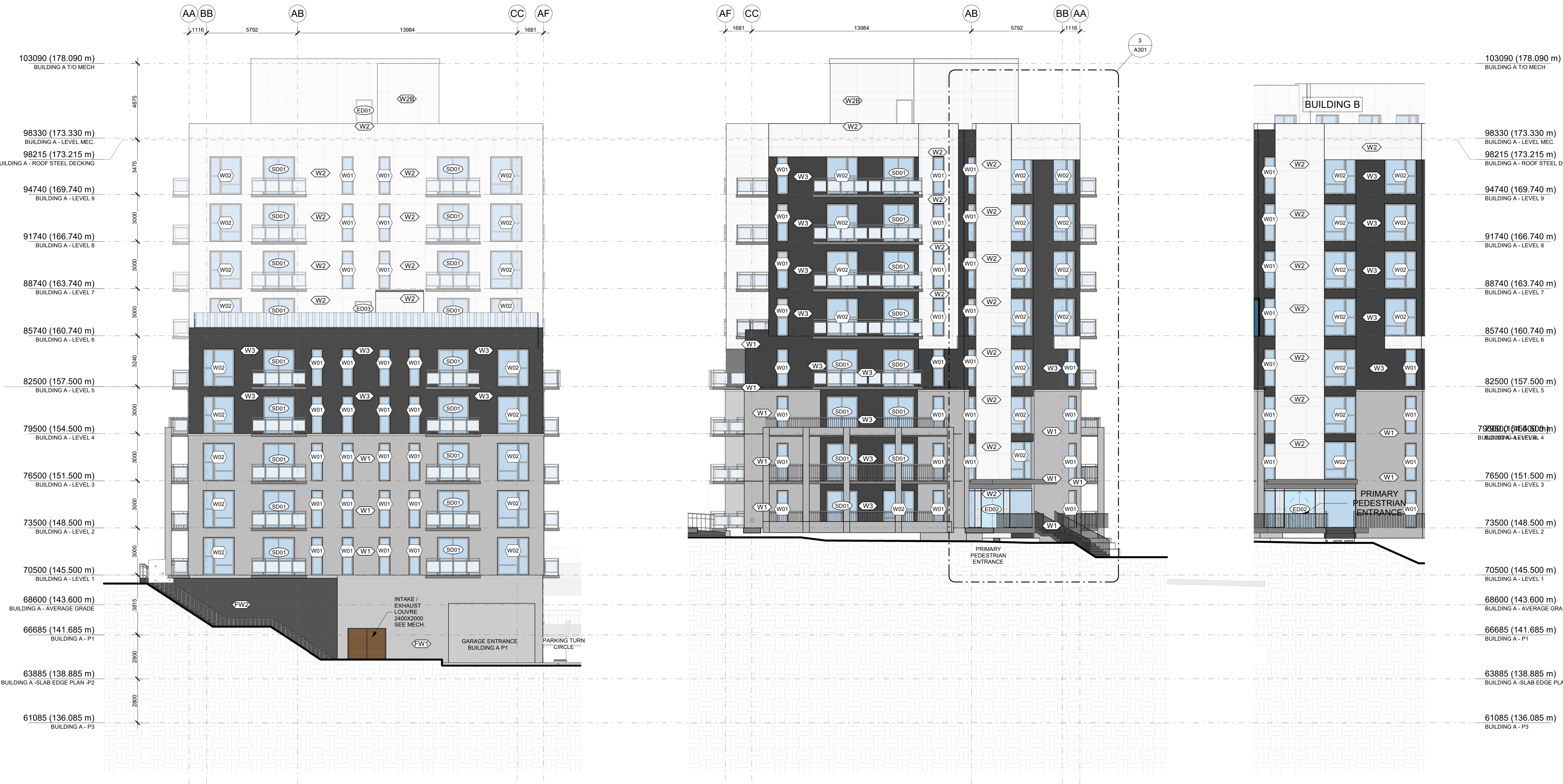
2 BUILDING A - NORTH ELEVATION A301 1:125