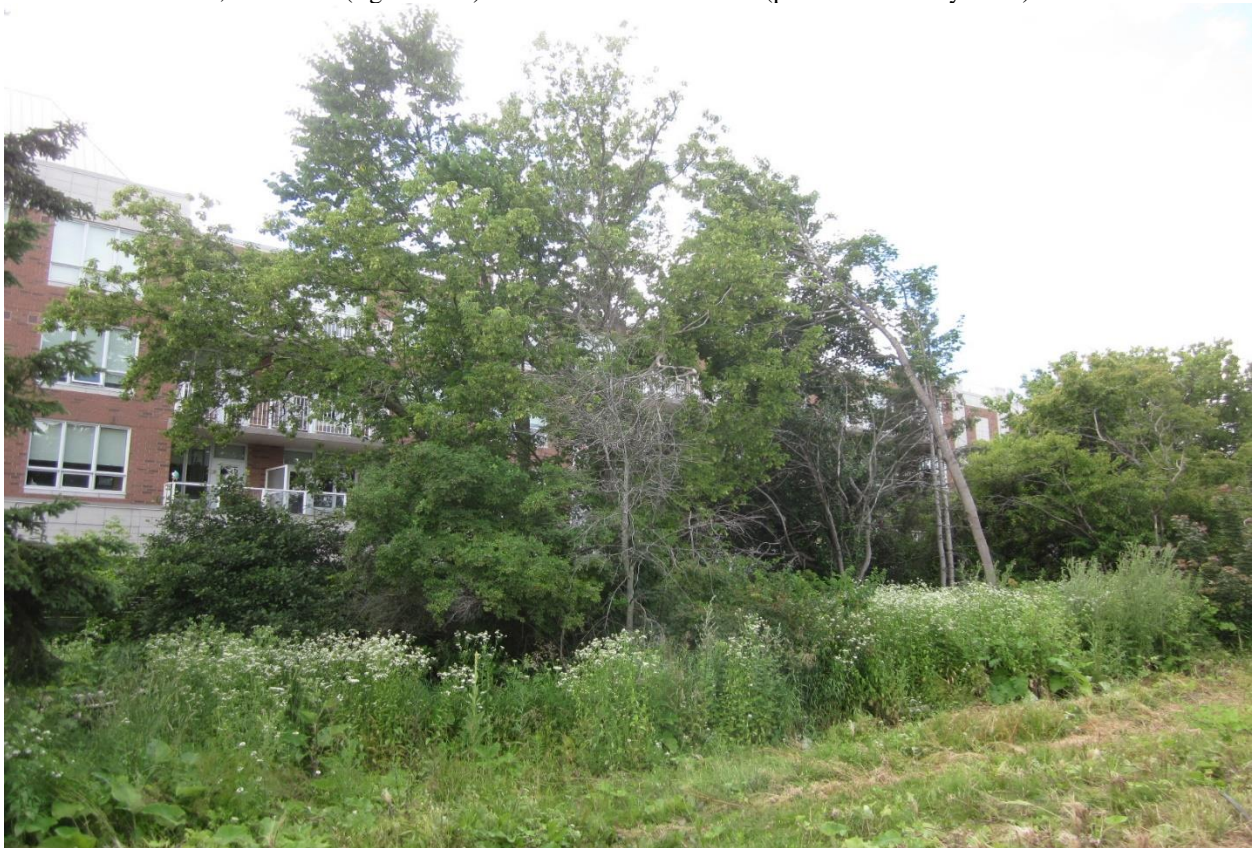
Picture 2. Trees #23-27 (right to left) at 3484 Innes Road (picture taken July 2022)