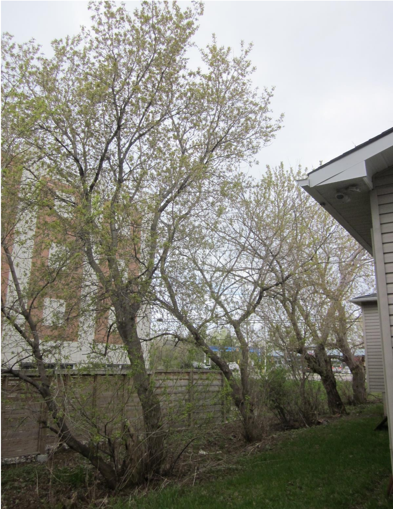
Picture 3. Trees #18-21 (from right) at 3484 Innes Road (picture taken May 2019)