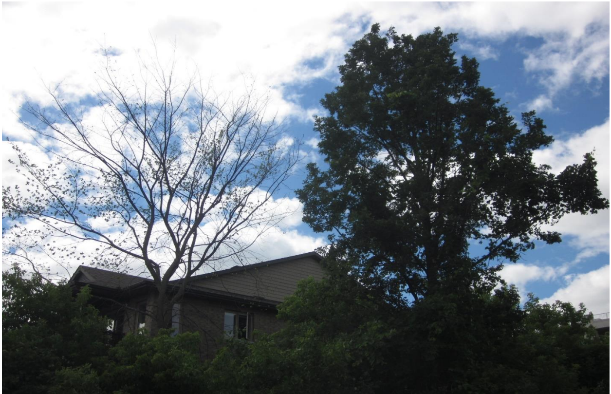
Picture 4. Trees #33 and 34 (right to left) at 240 Lamarche Avenue (picture taken July 2022)