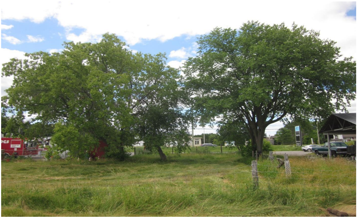
Picture 1. Trees #12, 13 and 14 (right to left) at 240 Lamarche Avenue (picture taken July 2022)