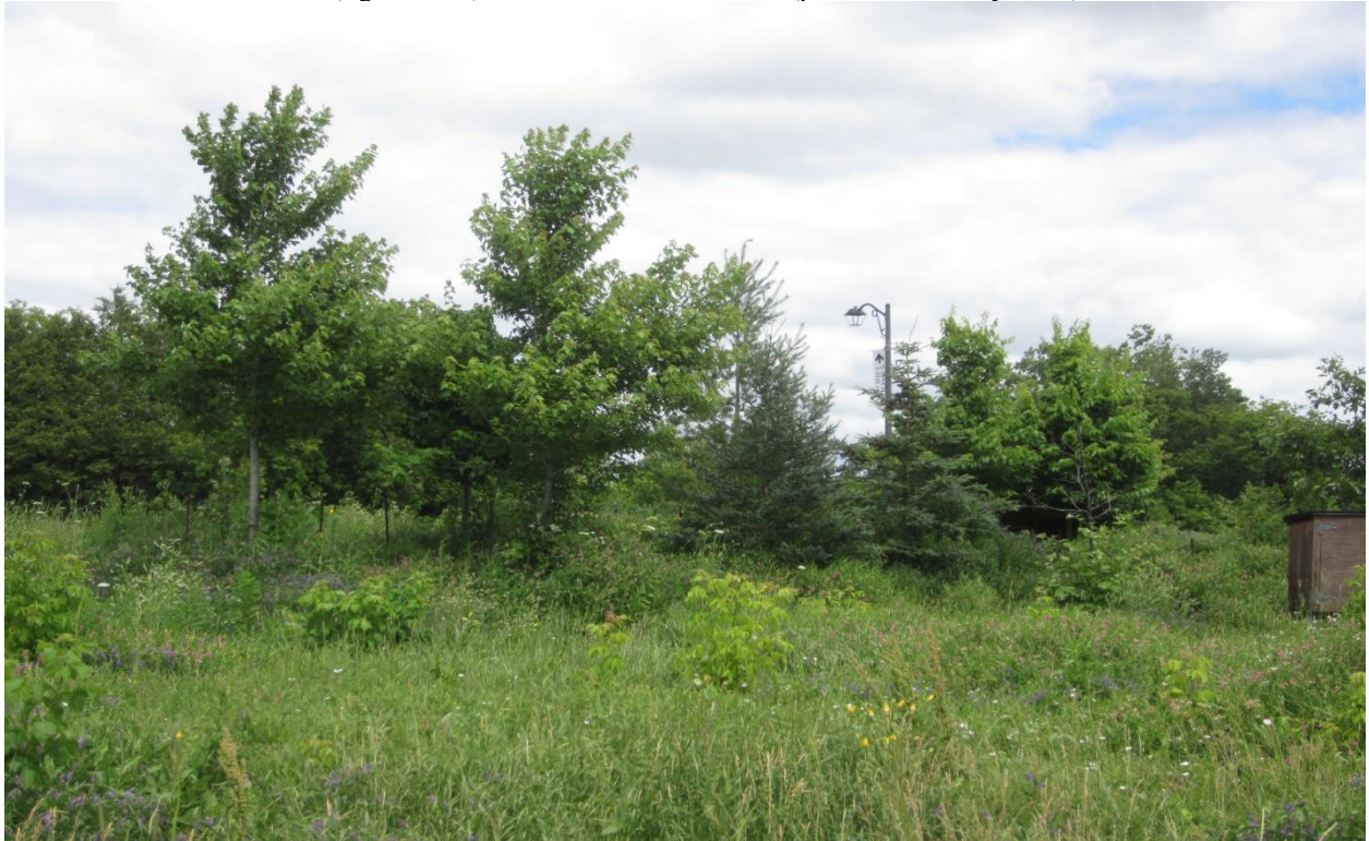
Picture 5. Tree grouping #11 at 240 Lamarche Avenue (picture taken July 2022)