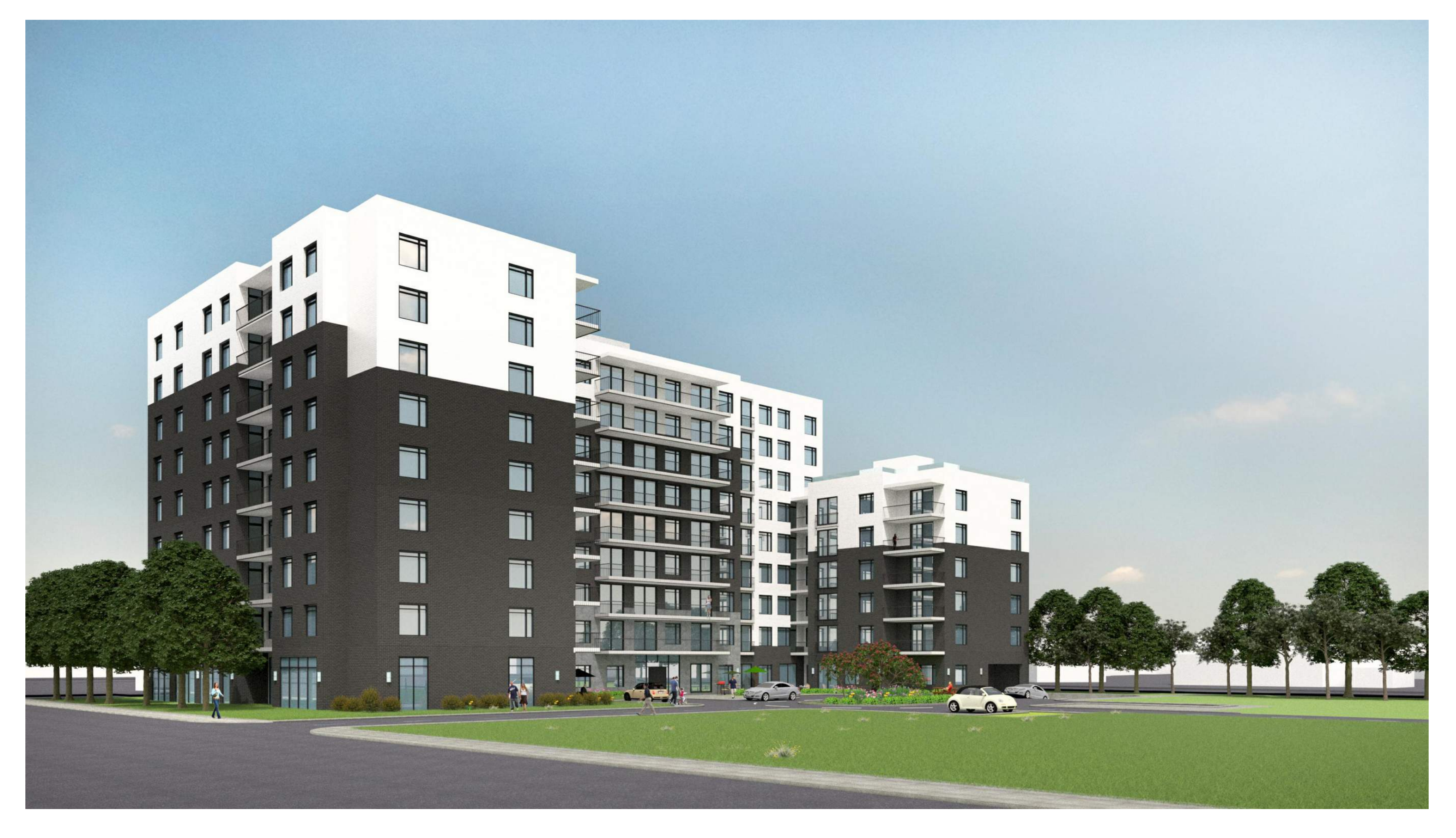
1509 MERIVALE ROAD