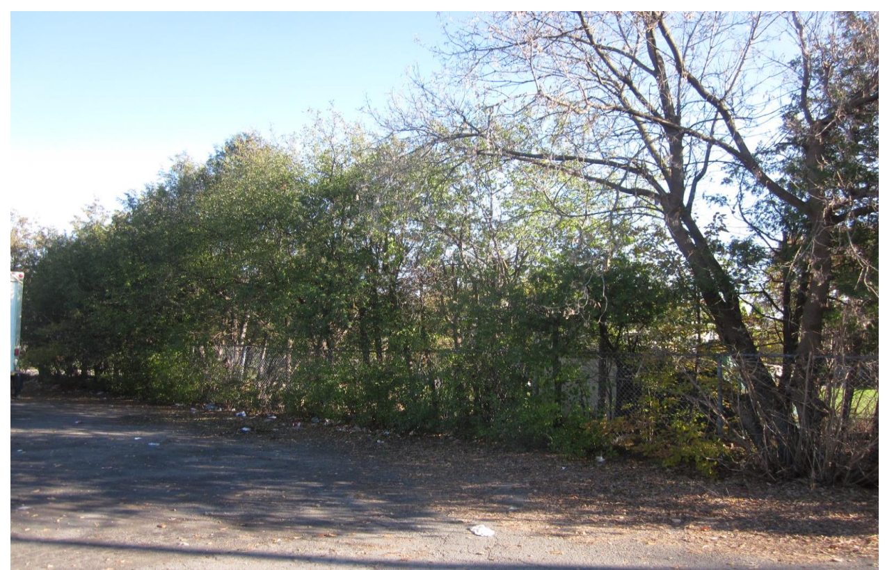
Picture 2. Cedar hedge #3, located on adjacent property at 42 Kerry Crescent (note impact Manitoba maple on right is having on growth of nearby cedars)