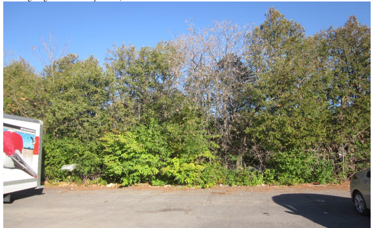
Picture 3. Cedar hedge #4, located on adjacent City of Ottawa property (note invasive growth between and below cedars)