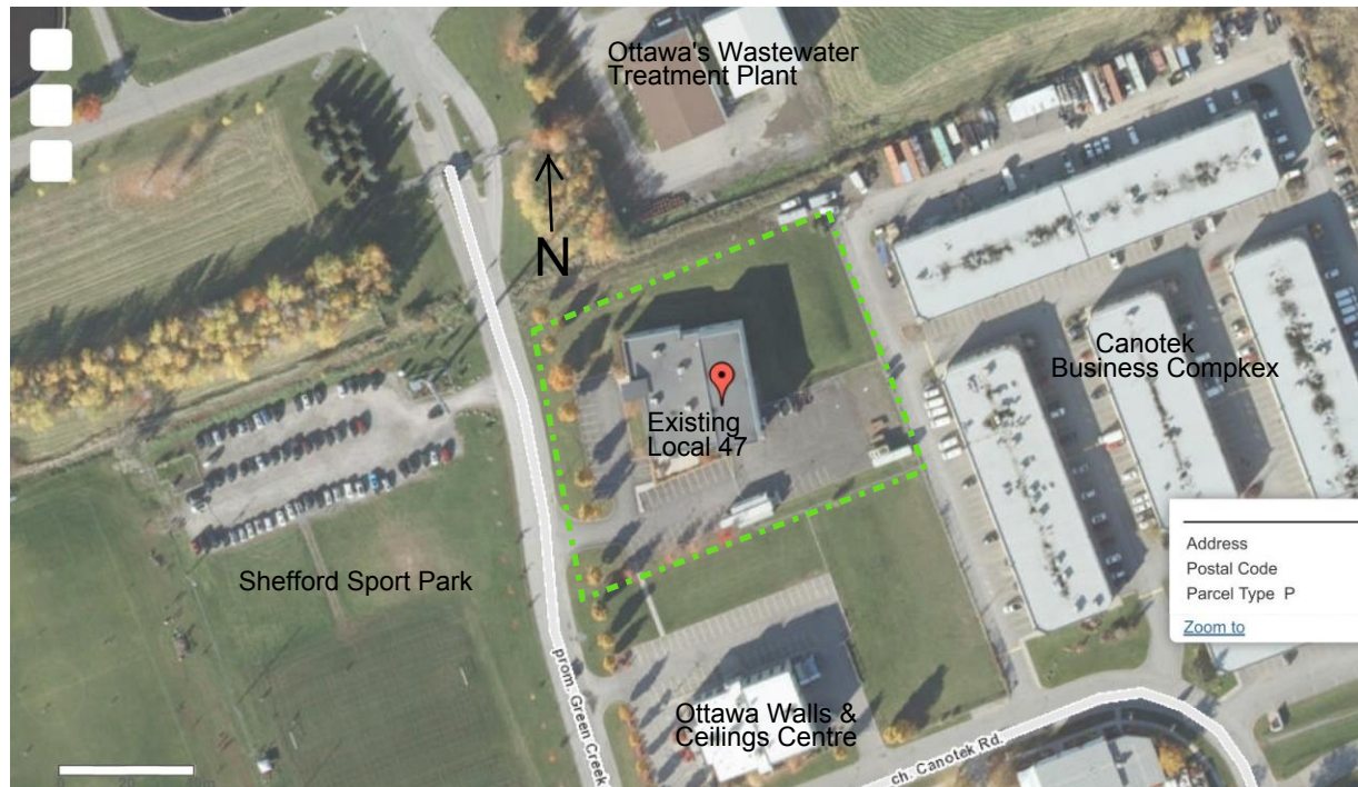
Figure 1 Aerial view identifying the existing building and site with a red marker, and showing the current surrounding land uses and buildings.

The 2 acre site fronts on Green Creek Drive and is located in a light industrial use area. The municipal address is 765 Green Creek Drive, Ottawa.