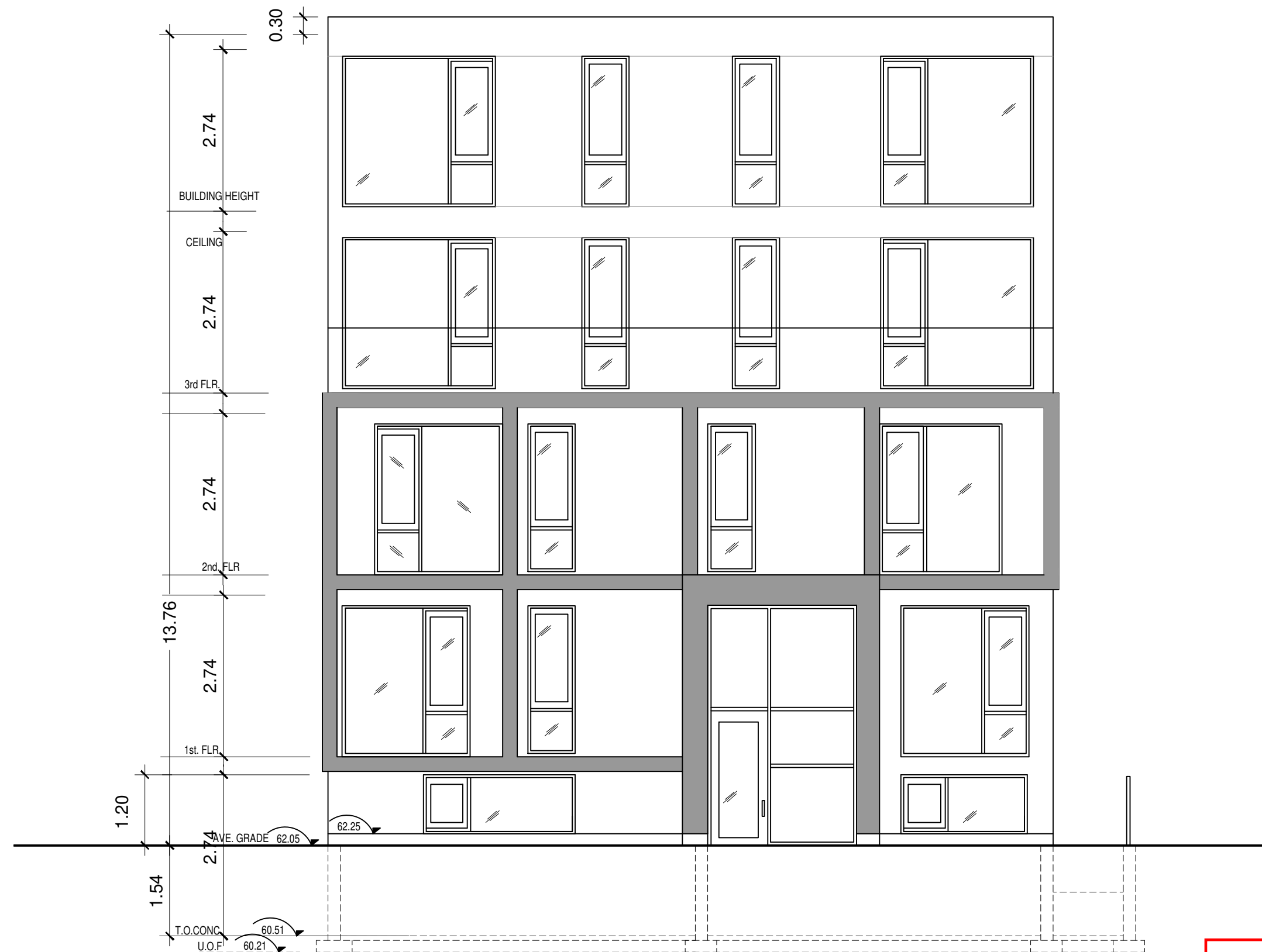
1 EAST ELEVATION SCALE: 1/150