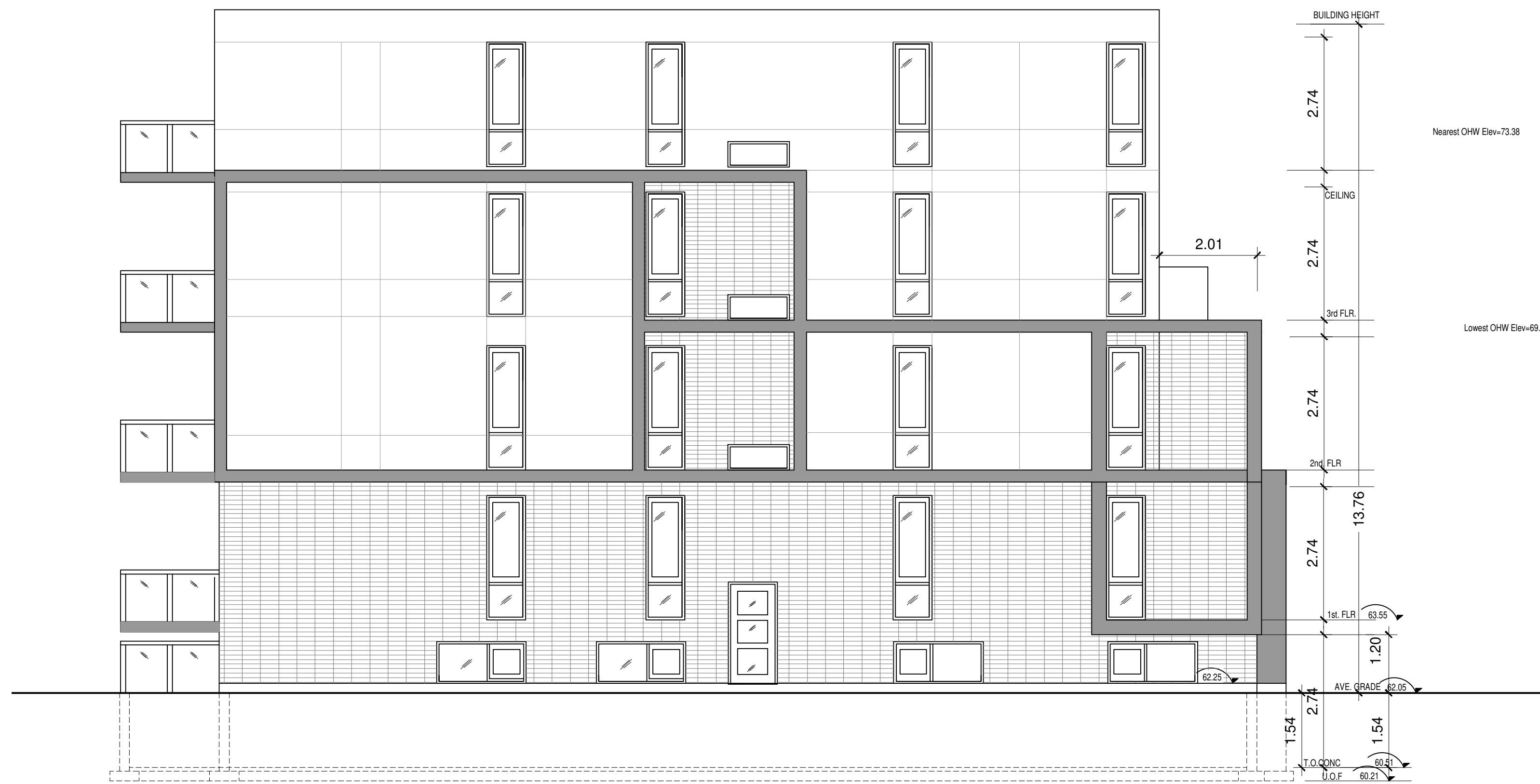
4 SOUTH ELEVATION SCALE: 1/150

CLIENT: VIKA LAND DEVELOPMENT GROUP INC.