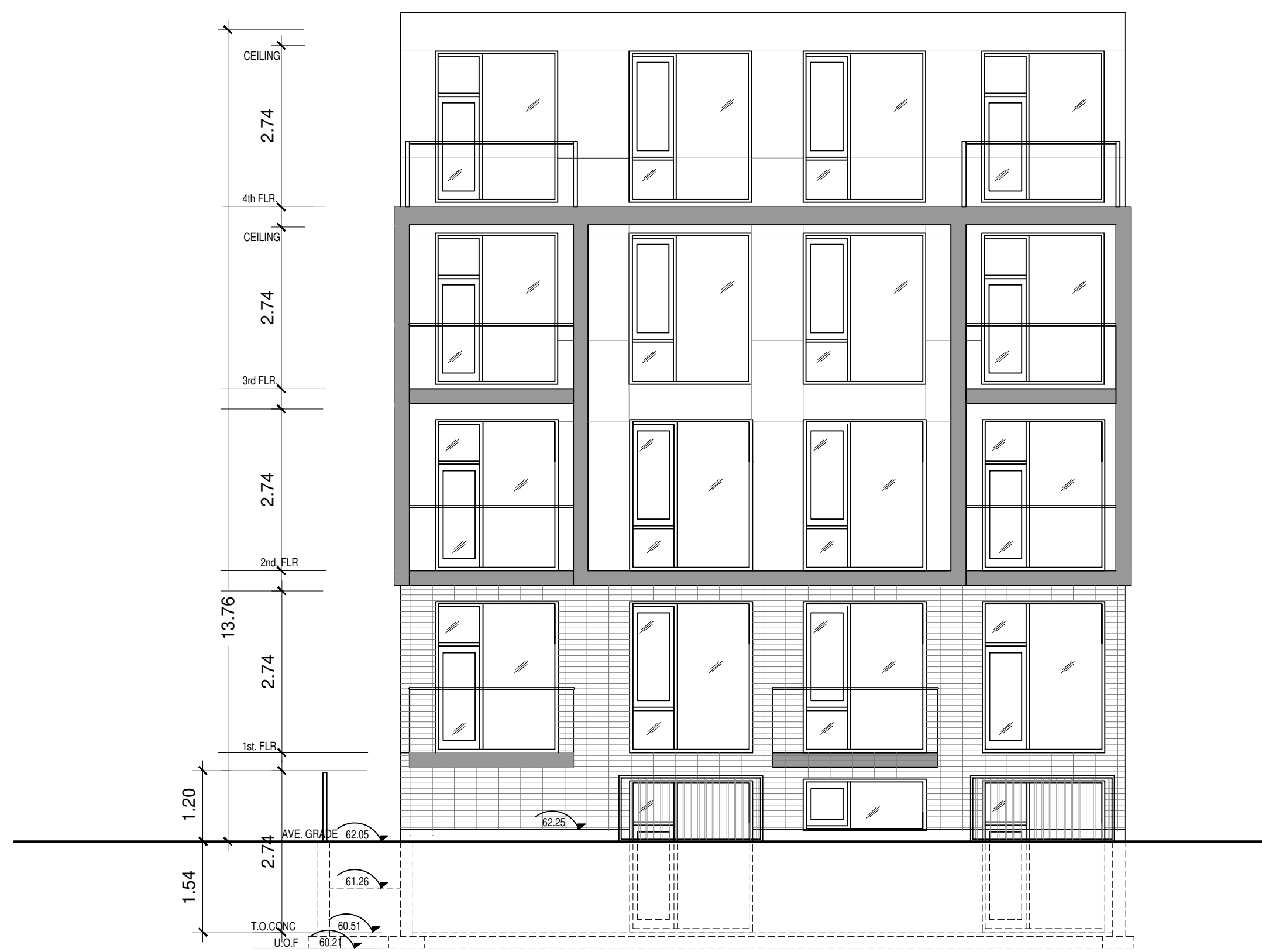
3 WEST ELEVATION SCALE: 1/150

APPROVED By Andrew McCreight at 12:49 pm, Aug 09, 2022