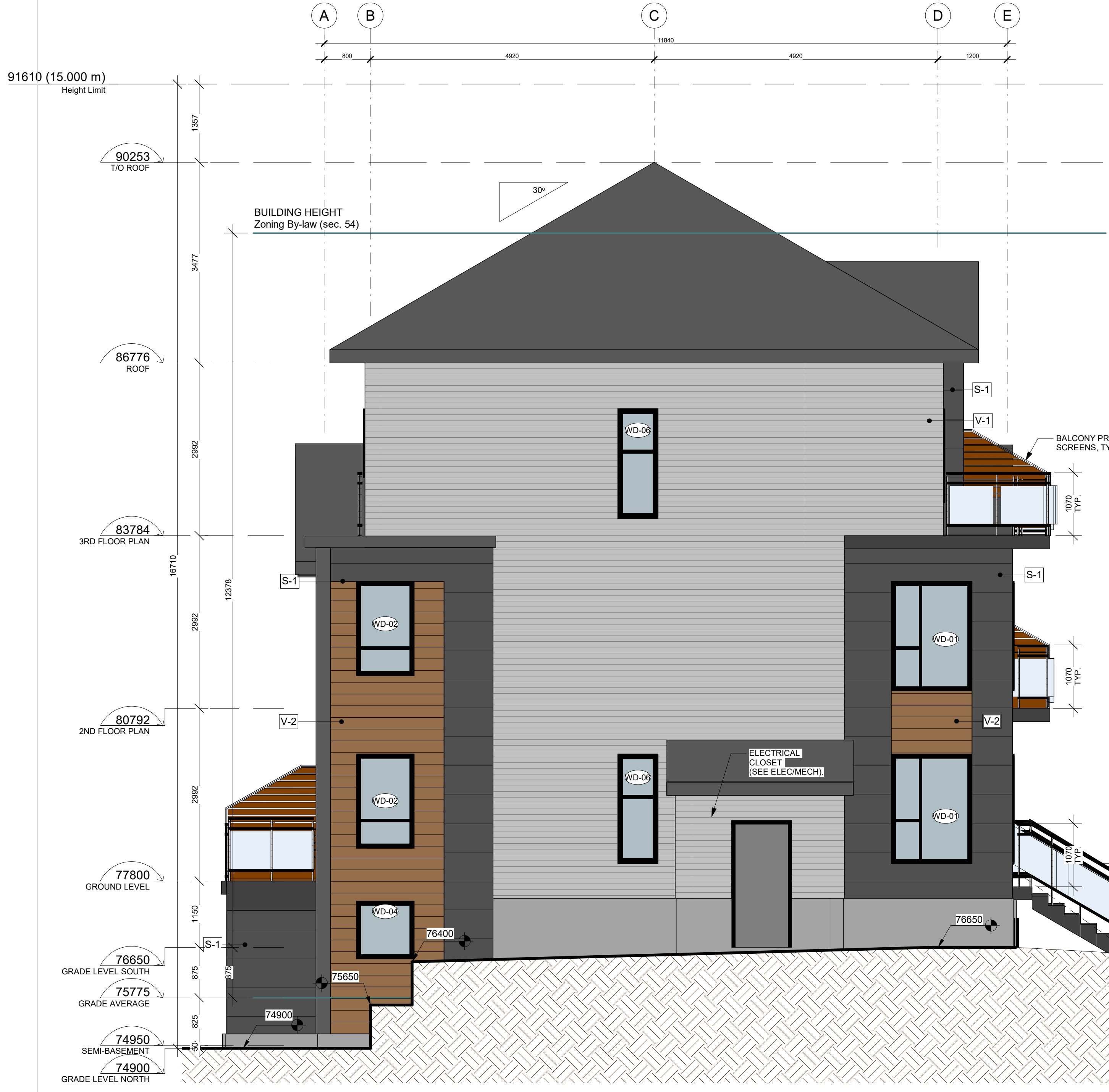
1 BLOCK-A- PROPOSED WEST ELEVATION A200 1: 50