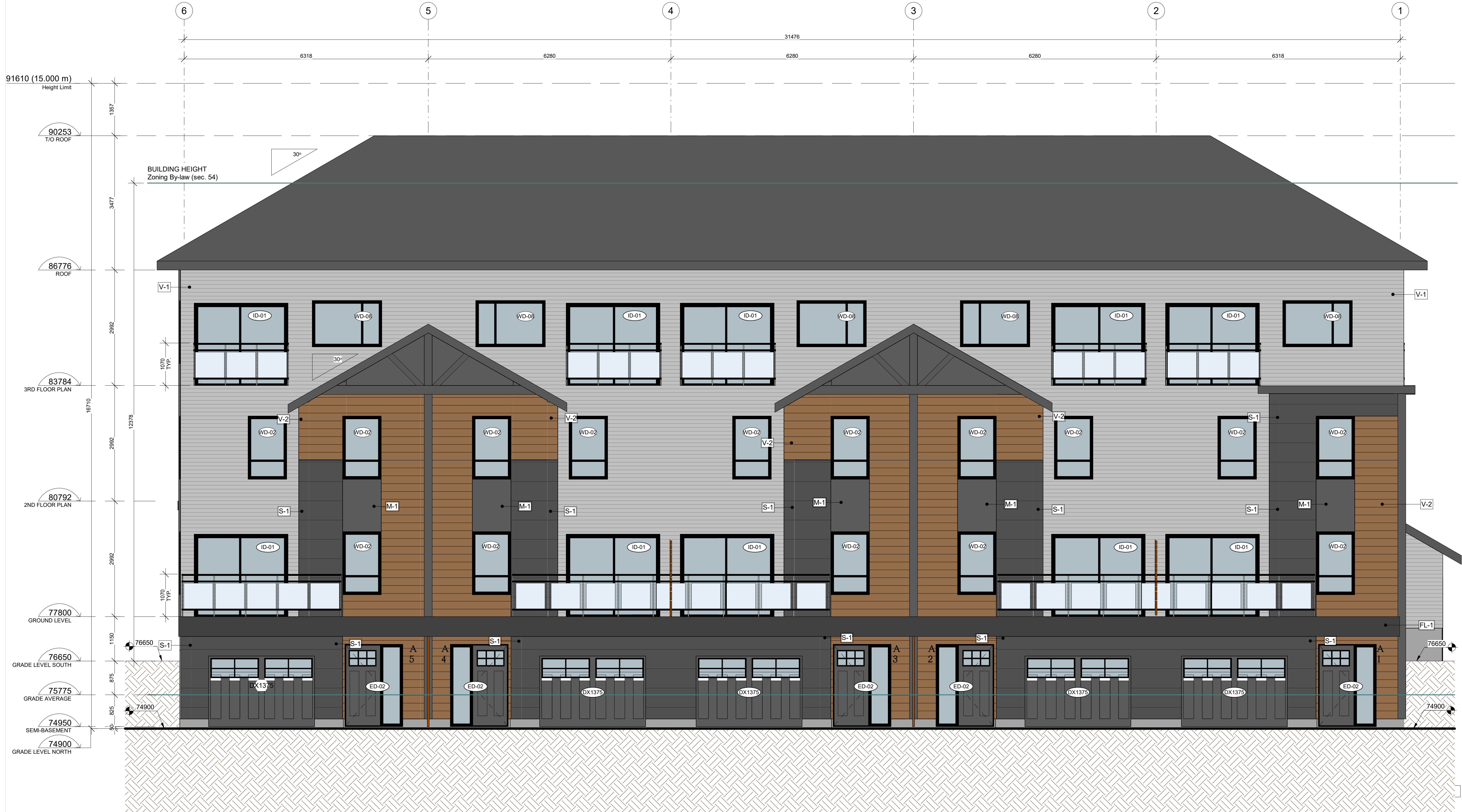
1 BLOCK-A- PROPOSED NORTH ELEVATION A201 1 : 50