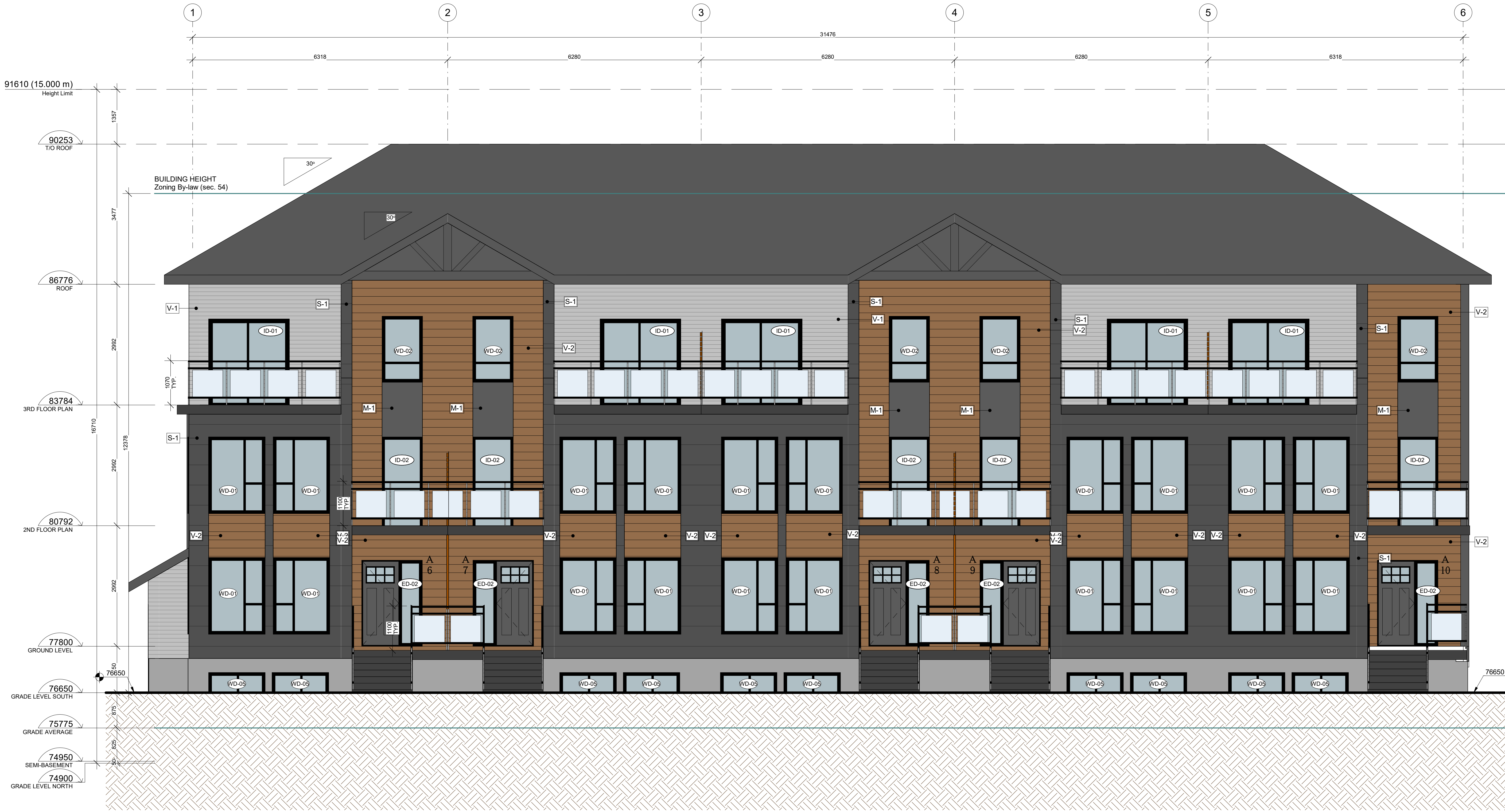
1 BLOCK-A- PROPOSED SOUTH ELEVATION A202 1 : 50