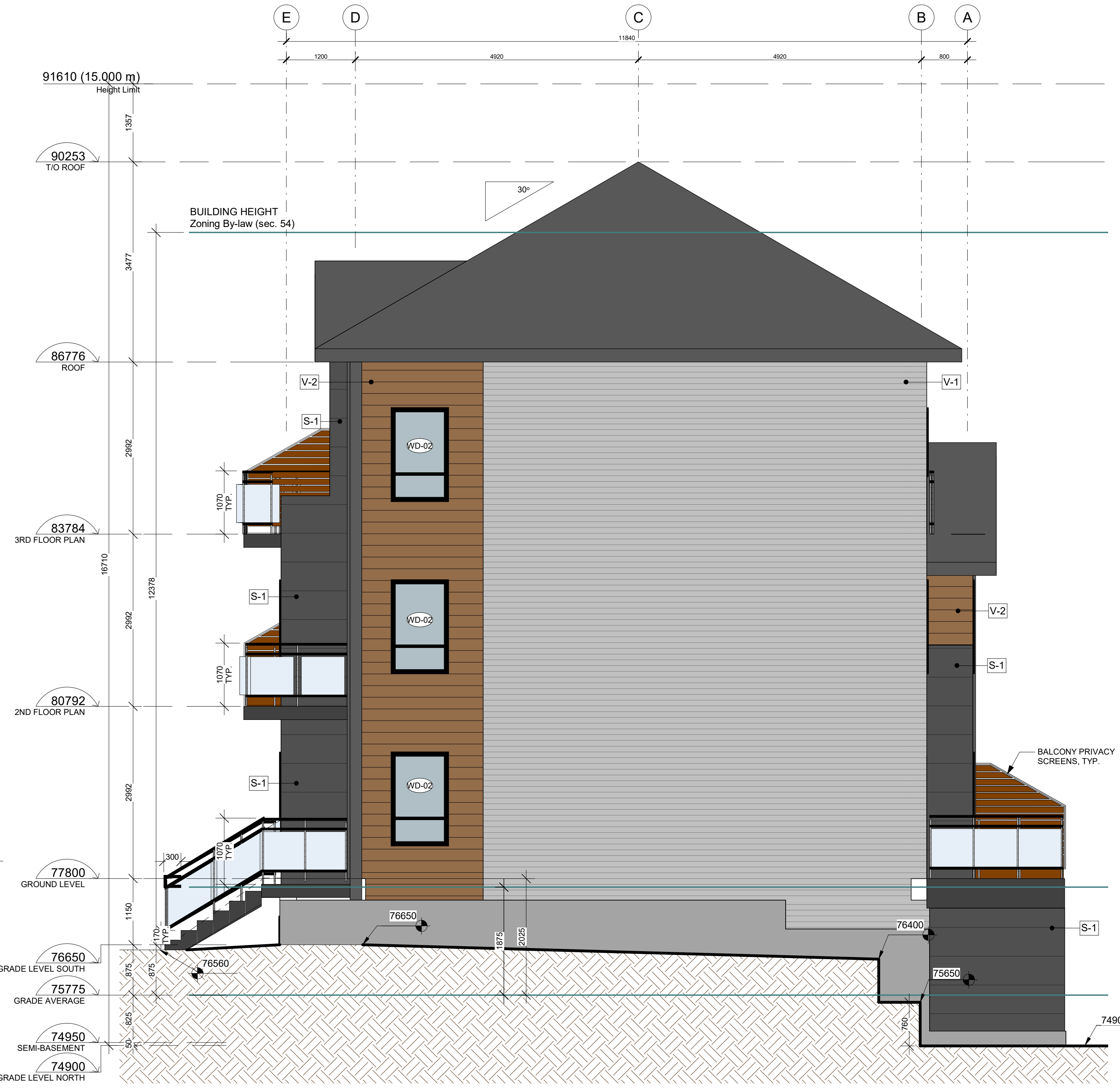
2 BLOCK-A- PROPOSED EAST ELEVATION A200 1: 50