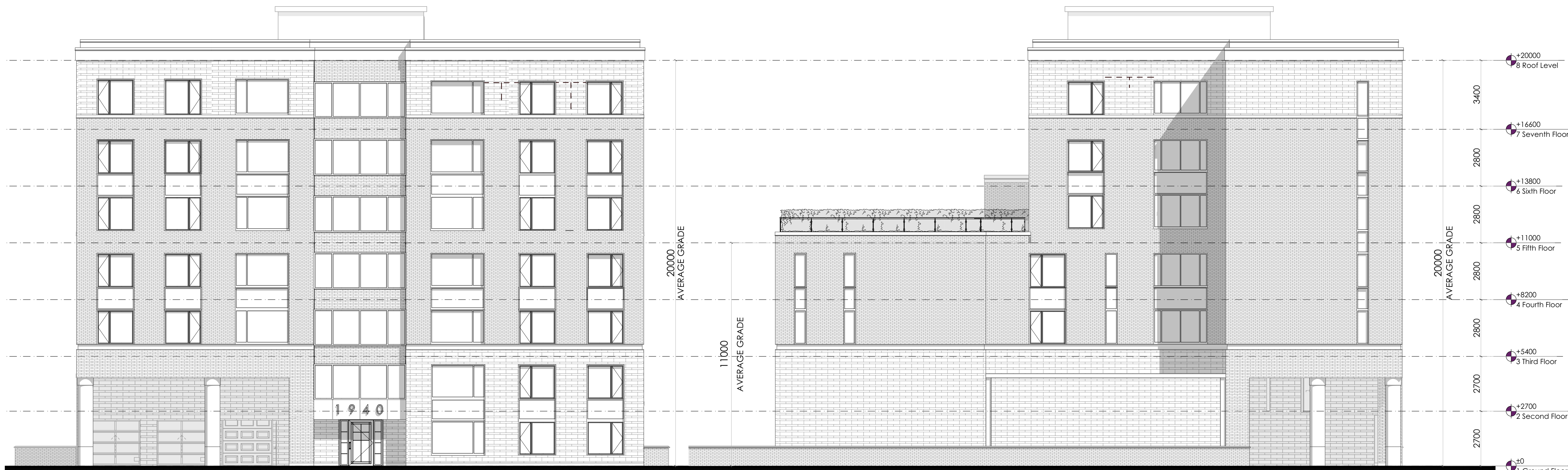
1 NORTH ELEVATION A-200 SCALE: 1:100

NOTES: ALL CONTRACTORS TO VERIFY ALL DIMENSIONS ON SITE AND TO REPORT ALL ERRORS AND/OR OMISSIONS TO THE ARCHITECT. ALL CONTRACTORS MUST COMPLY WITH ALL CODES AND BYLAWS AND OTHER AUTHORITIES HAVING JURISDICTION OVER THE WORK. DO NOT SCALE DRAWINGS. THIS DRAWING MAY NOT BE USED FOR CONSTRUCTION UNTIL SIGNED BY THE ARCHITECT. COPYRIGHT RESERVED.