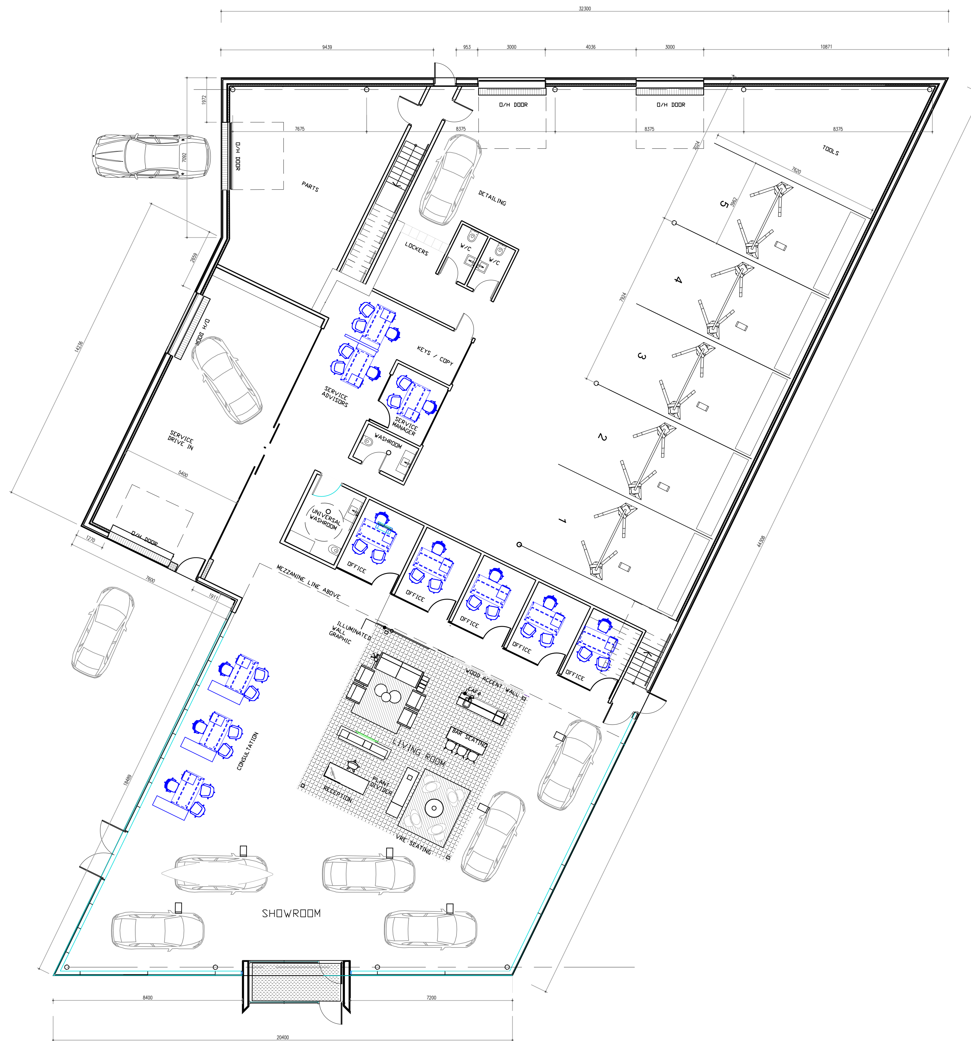
1 GROUND FLOOR PLAN A003 SCALE: 1:100