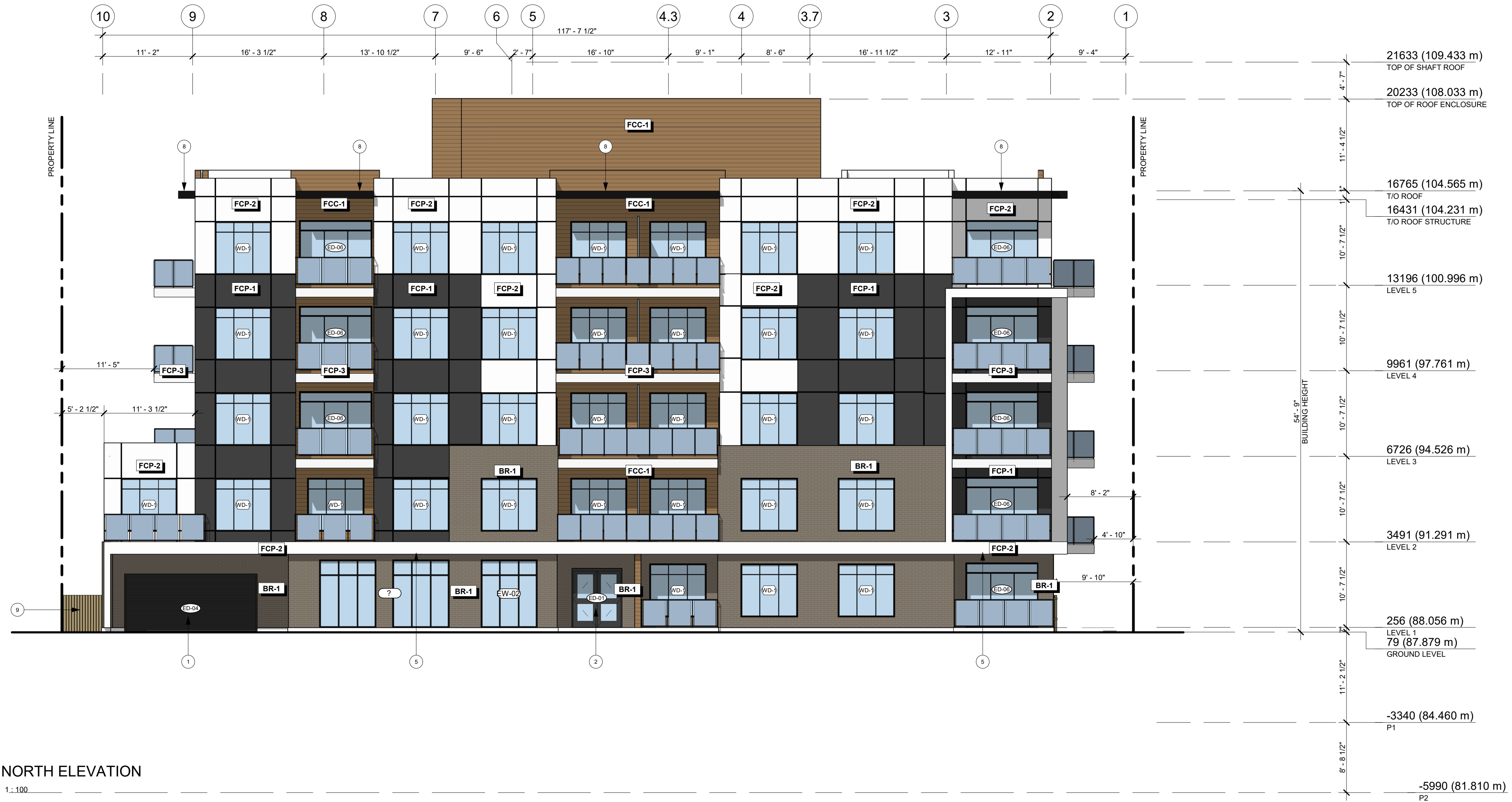
1 NORTH ELEVATION 1:100