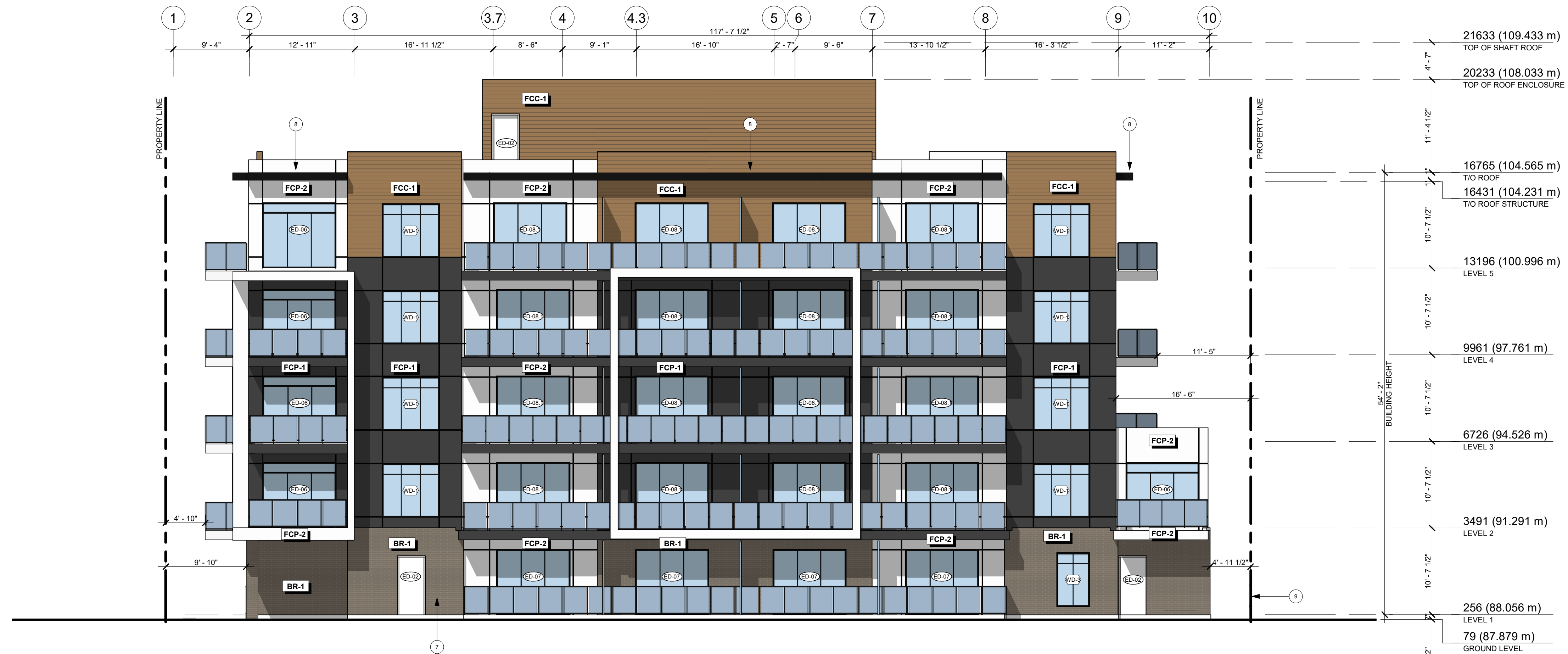
1 SOUTH ELEVATION 1:100