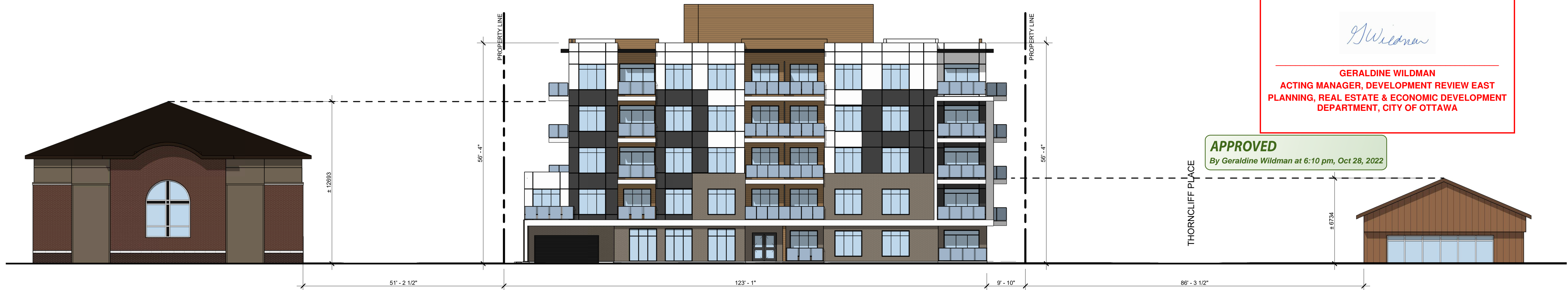
3 NORTH ELEVATION WITH CONTEXT 1:160