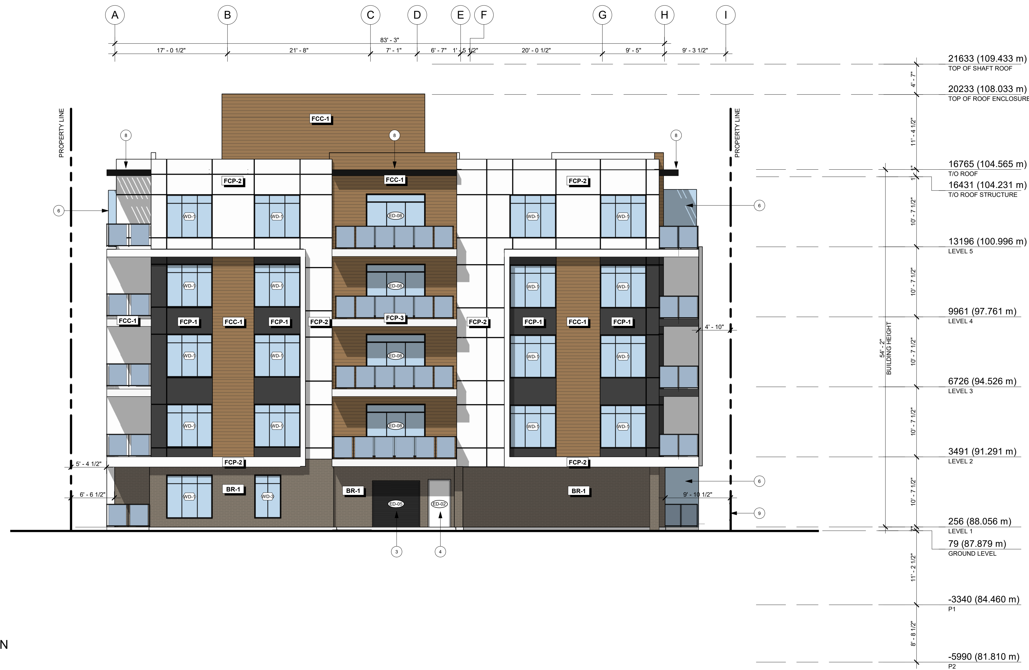
1 WEST ELEVATION 1 : 100