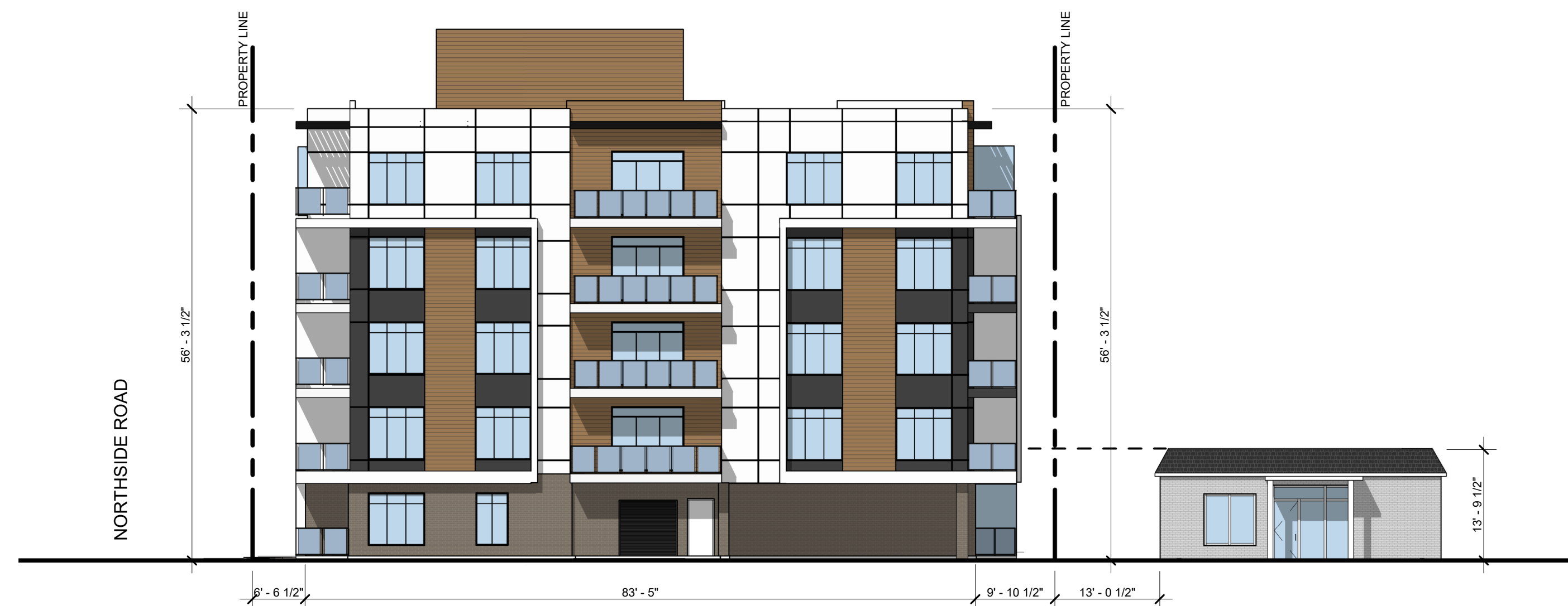
2 WEST ELEVATION WITH CONTEXT 1 : 160

G. Wildman GERALDINE WILDMAN ACTING MANAGER, DEVELOPMENT REVIEW EAST PLANNING, REAL ESTATE & ECONOMIC DEVELOPMENT DEPARTMENT, CITY OF OTTAWA