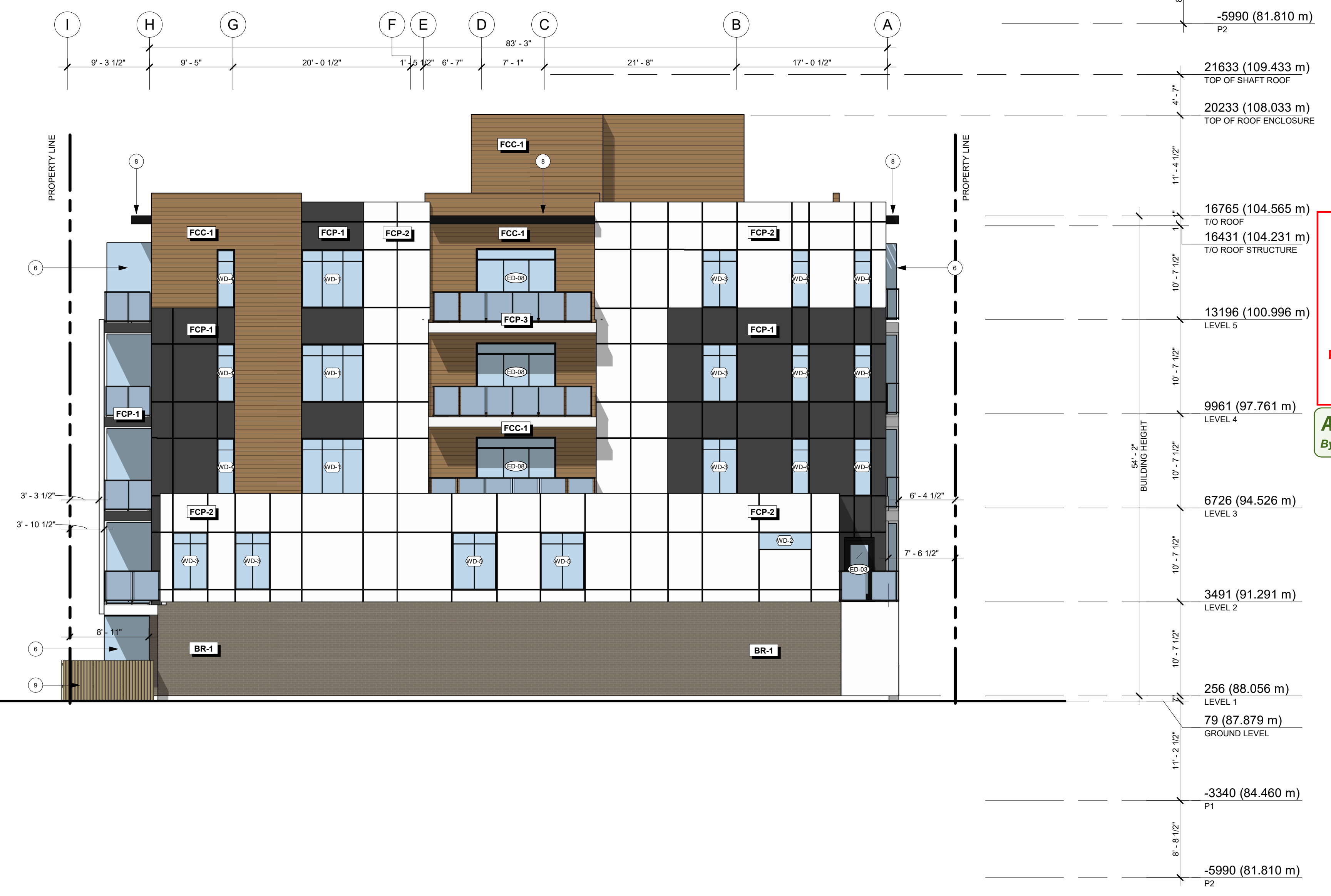
2 EAST ELEVATION 1:100

GENERAL NOTES NOTE-A: ALL DRAWINGS ARE TO BE READ IN CONJUNCTION WITH ALL OTHER DRAWINGS AND SPECIFICATIONS, INCLUDING OTHER CONSULTANTS DRAWINGS AND SPECIFICATIONS. ANY DISCREPANCIES BETWEEN DRAWINGS WILL BE REPORTED TO THE PROJECT LEAD IMMEDIATELY FOR CLARIFICATION PRIOR TO COMMENCING ANY CONSTRUCTION. NOTE-B: ALL GENERAL SITE INFORMATION AND CONDITIONS HAVE BEEN COMPILED FROM EXISTING PLANS AND SURVEYS. NOTE-C: CONTRACTOR IS RESPONSIBLE TO CHECK AND VERIFY ALL DIMENSIONS ON SITE AND REPORT ALL ERRORS AND / OR OMISSIONS TO THE ARCHITECT. NOTE-D: REFER TO LANDSCAPE PLAN FOR ALL EXTERIOR LANDSCAPING. NOTE-E: DO NOT SCALE DRAWINGS. NOTE-F: ALL CONTRACTORS MUST COMPLY WITH ALL APPLICABLE CODES AND REGULATIONS.