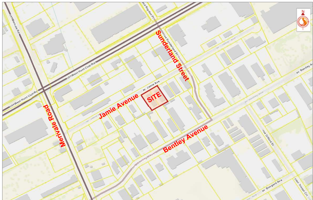
Figure 1 : Key Plan

The subject property is approximately 0.38ha in area containing two existing buildings, site access and 20 surface parking spaces. The architect (Brian K. Clark) has prepared a proposed site plan to support the site plan control application (see Appendix B ). The site plan shows 20 surface parking areas and the amalgamation of the two existing buildings on Lot 9 & Lot 10 into one new building. The new building will continue to be serviced by the existing municipal water and wastewater infrastructure on Jamie Avenue.