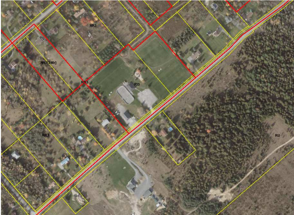
Figure 1: Aerial view of surrounding properties with zoning designations and property lines