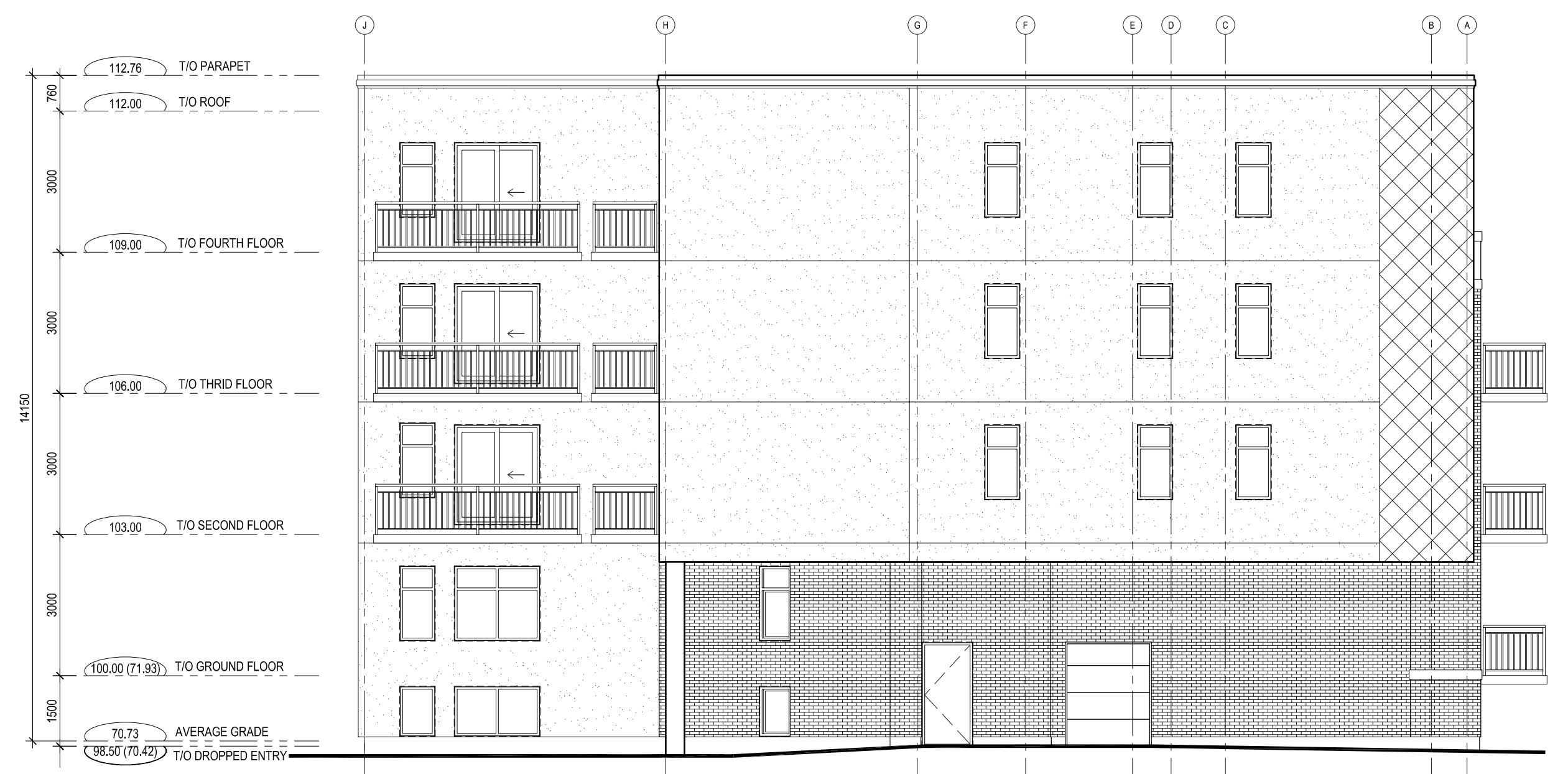
4 LEFT (EAST) ELEVATION SCALE: 1:100