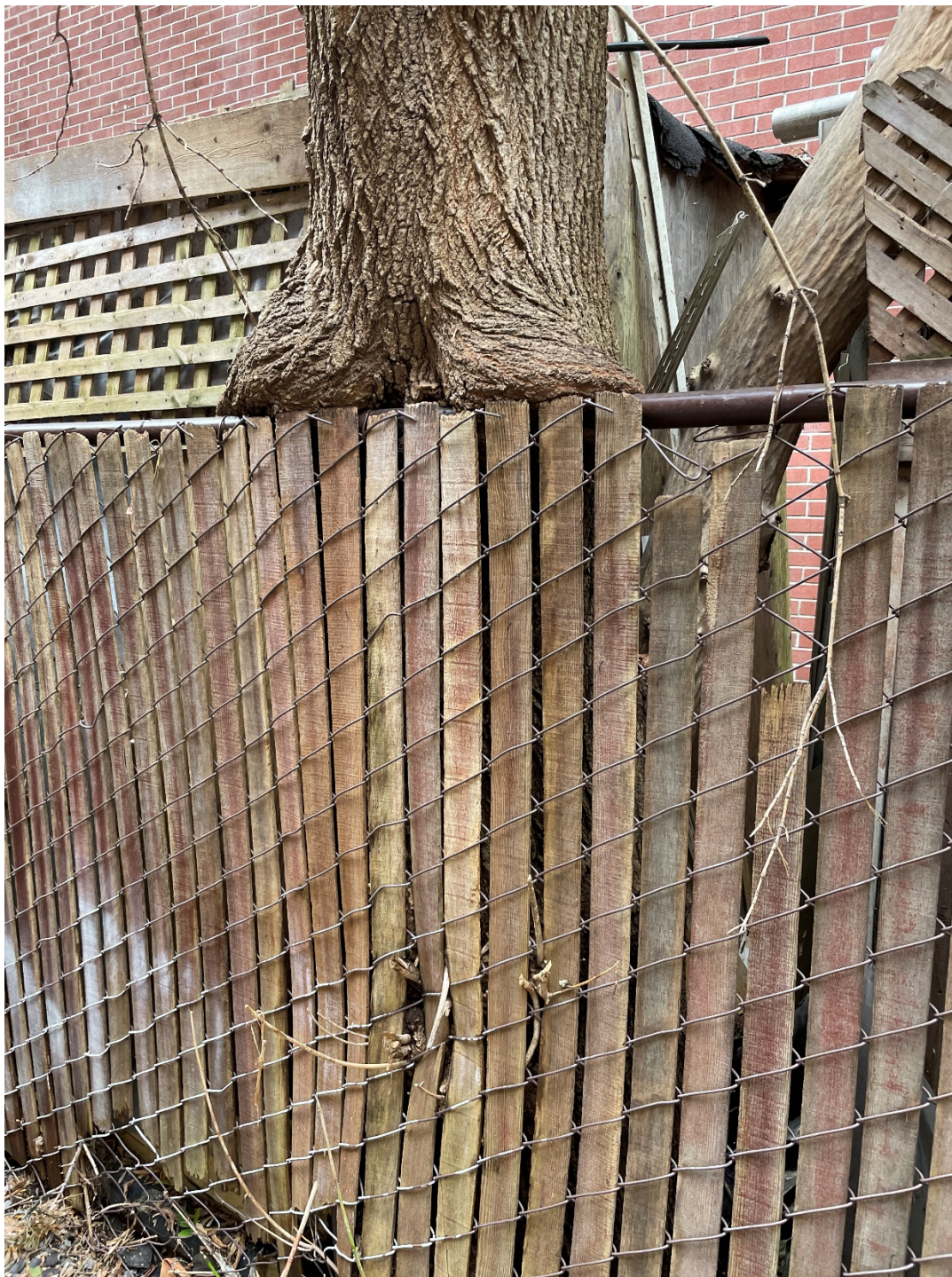
Figure 3: Tree 2, close-up of trunk growing into metal fence