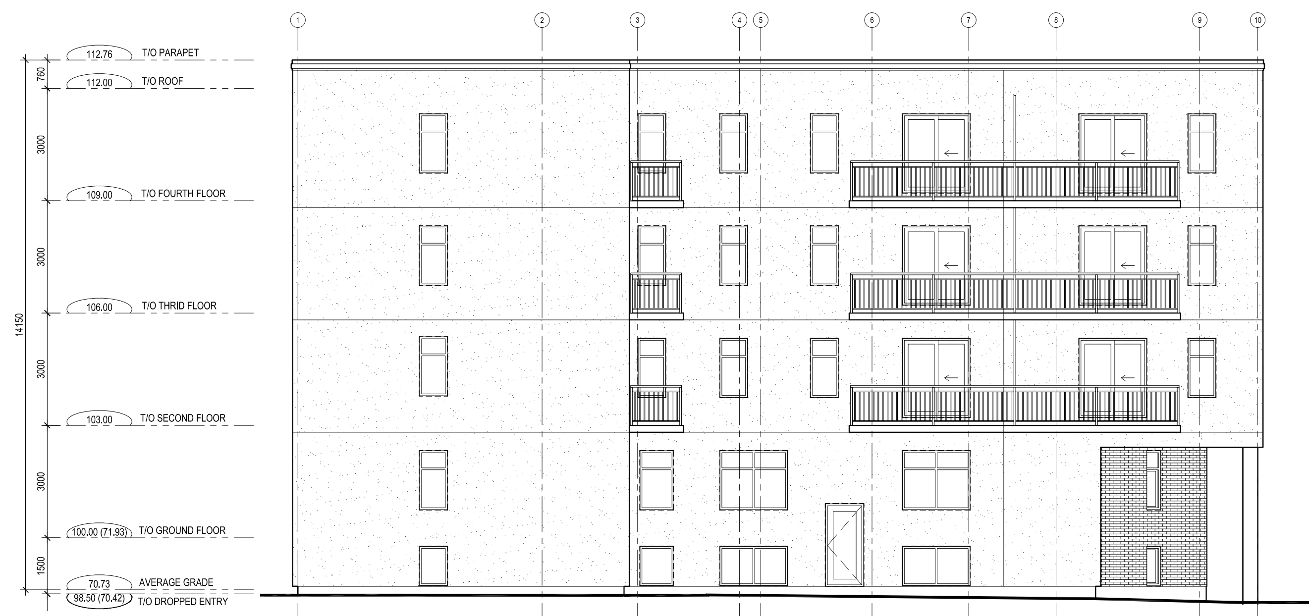
3 A-201 REAR (SOUTH) ELEVATION SCALE: 1:100