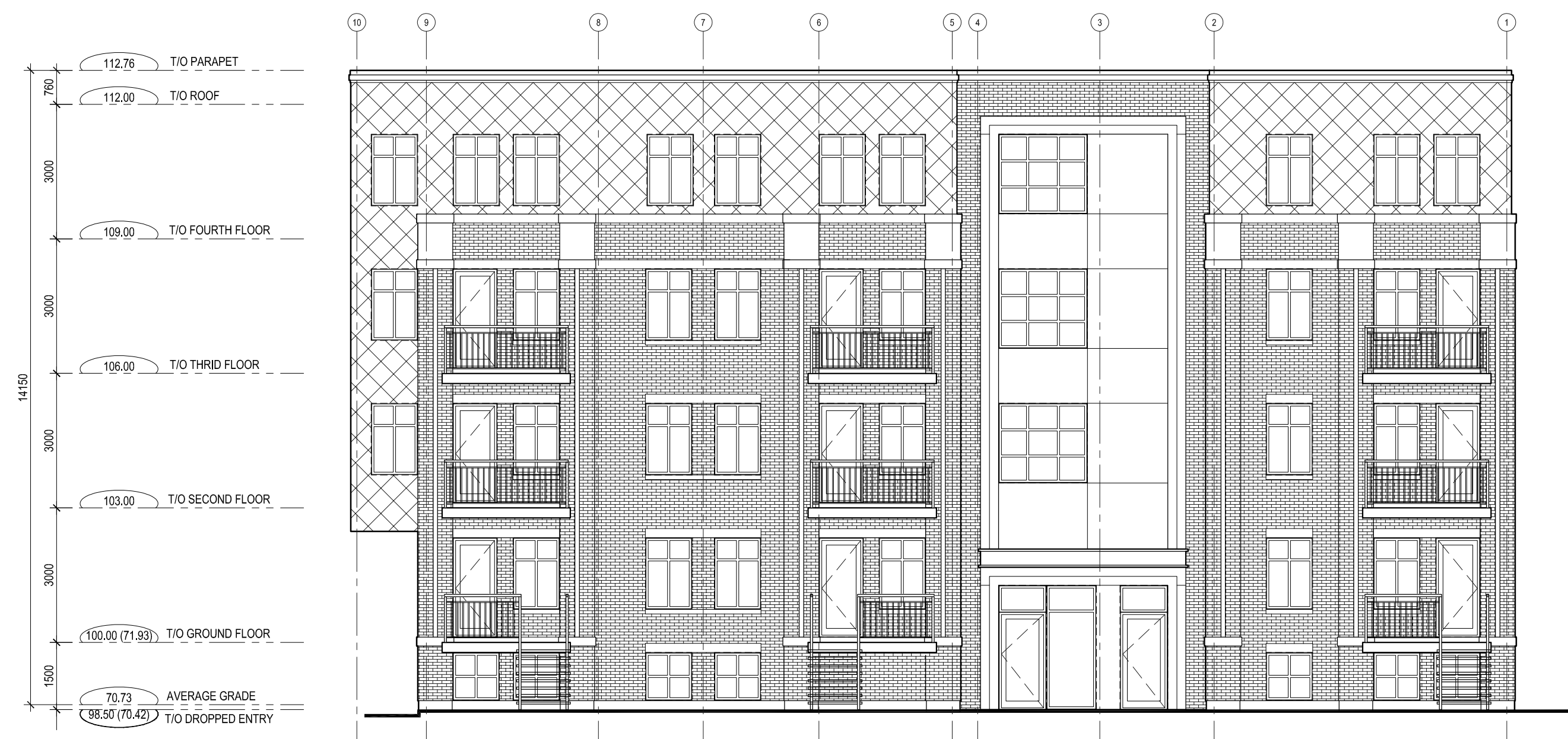
1 A-201 FRONT (NORTH) ELEVATION SCALE: 1:100