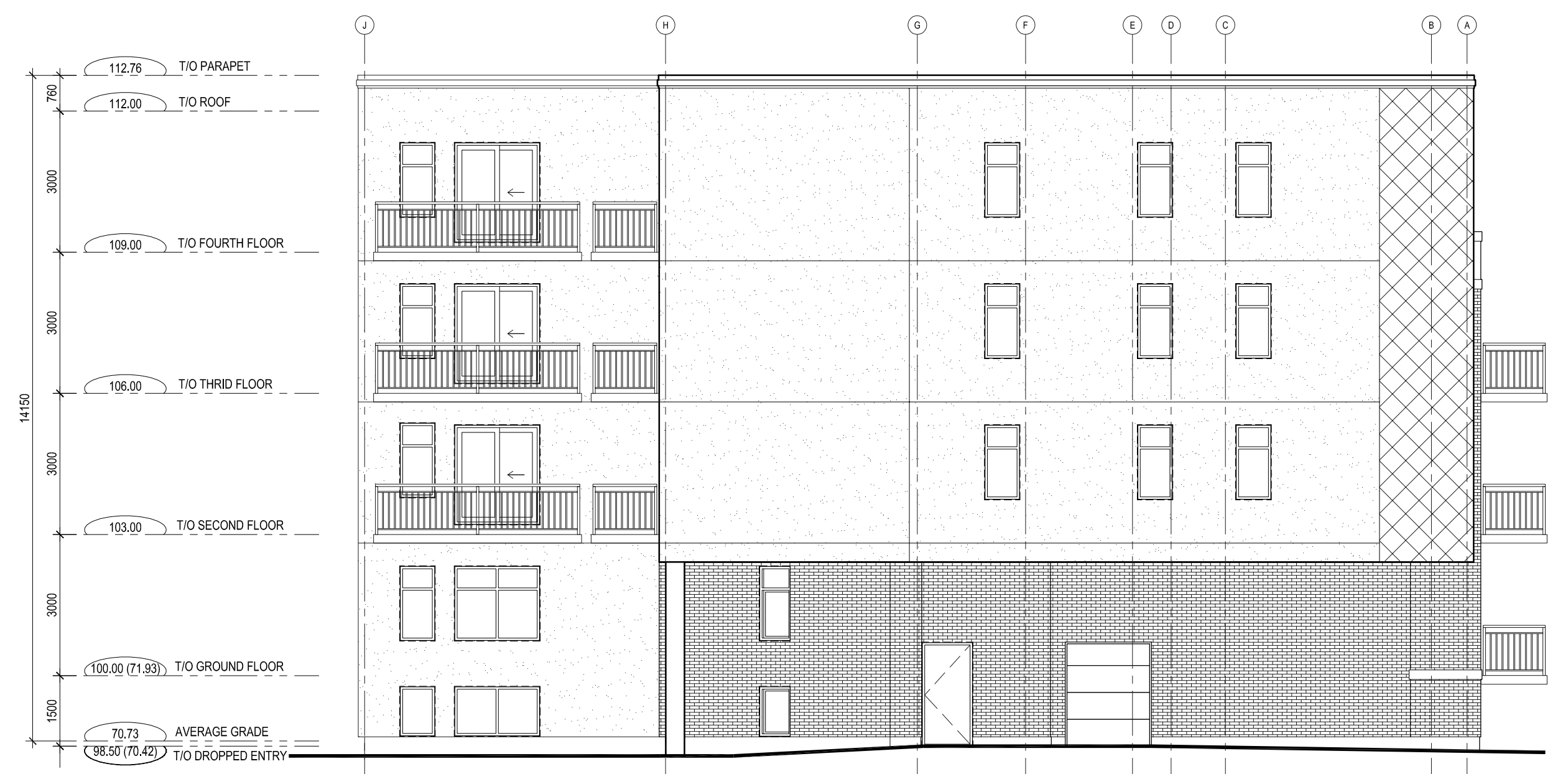
4 A-201 LEFT (EAST) ELEVATION SCALE: 1:100

It is the responsibility of the appropriate contractor to check & verify all dimensions on site and report all errors &/or omissions to the architect. All contractors must comply with all pertinent codes & by-laws, & use proprietary products as directed by the manufacturer. Do not scale drawings. Copyright reserved.