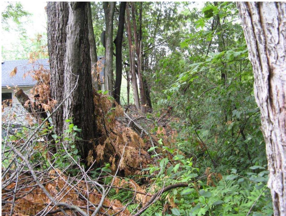
Photo 6 - Maples and cedars along the south portion of the east fenceline of 3044 Innes Road. In forefront is mature sugar maple east of site with critical root zone extending onto the site. View looking north