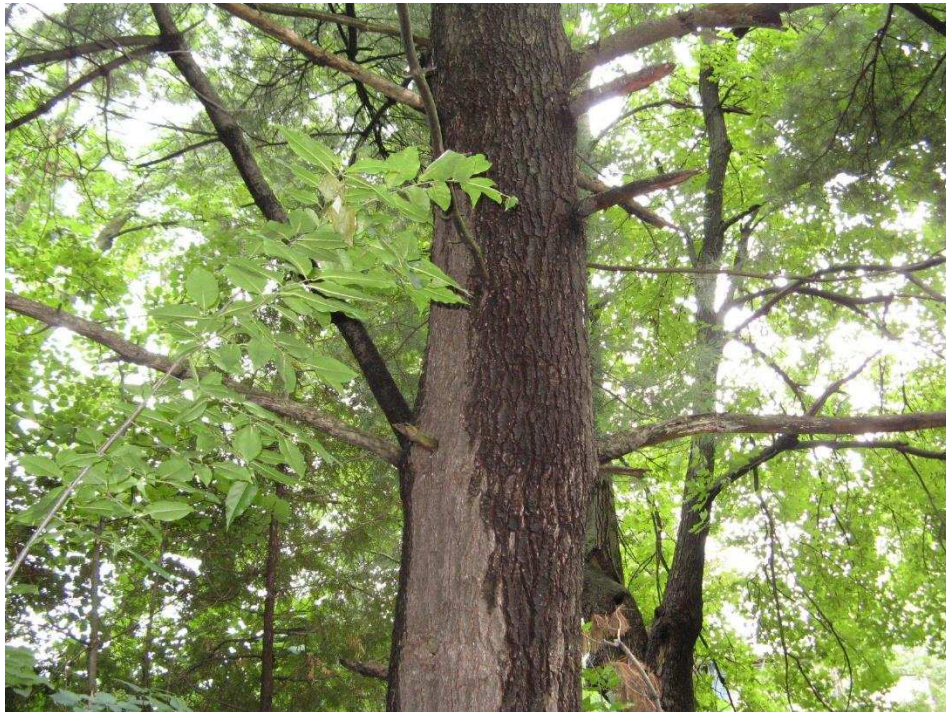
Photo 4 – Mature white pine in the southwest portion of 3044 Innes Road. View looking west