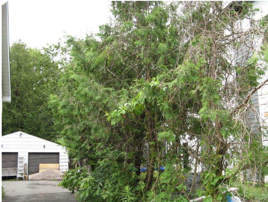
Photo 8 – White cedars between 3040 and 3044 Innes Road. View looking south