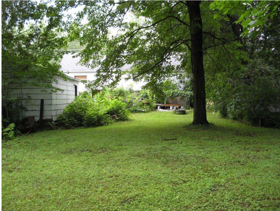
Photo 7 – Manicured lawn and one of the mature red maples in the south half of 3040 Innes Road. View looking north