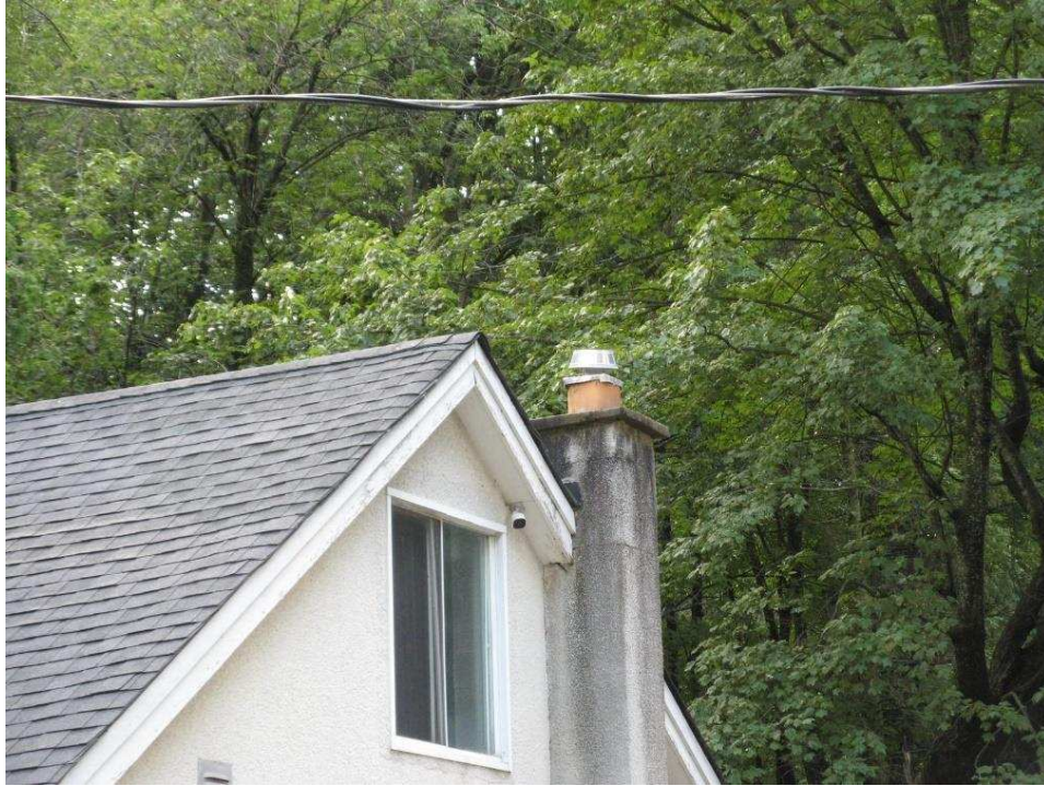
Photo 1 – Chimneys on the residences (this example is 3044 Innes Road) are vented, preventing potential chimney swift access. View looking southeast