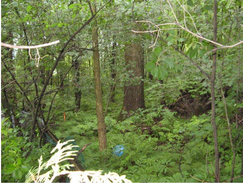
Photo 9 - Mature eastern cottonwood to the south of the southeast corner of the site (note stake). View looking east