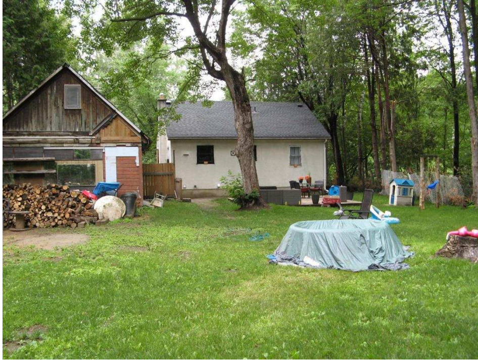
Photo 3 – Rear yard of 3044 Innes Road. View looking north to red maple in apparently poor condition.