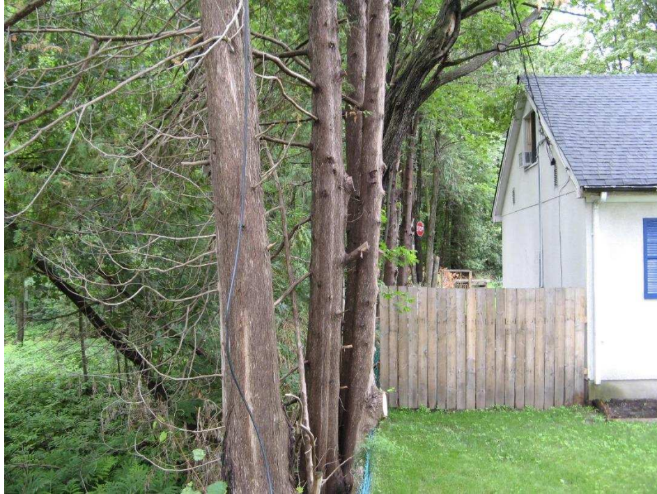
Photo 5 – White cedars along the east fenceline of 3044 Innes Road, south of Innes Road. Front cedars are on City property but will be retained. View looking south.