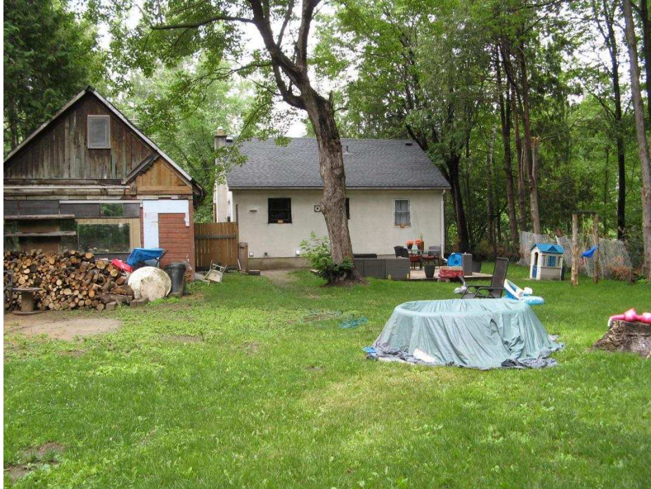
Photo 3 – Rear yard of 3044 Innes Road. View looking north to red maple in apparently poor condition.