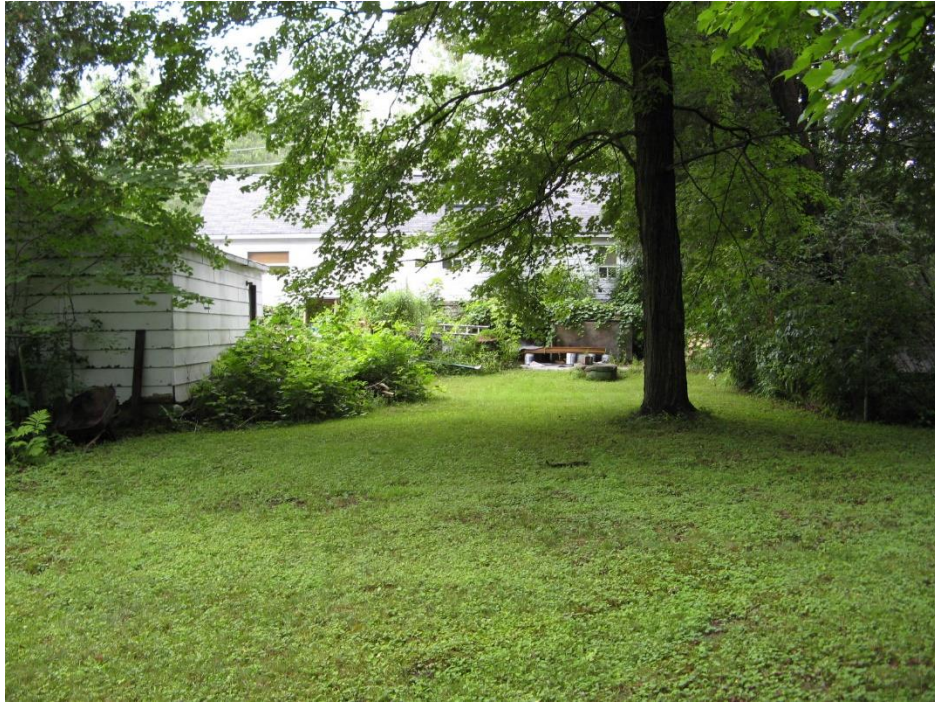
Photo 7 – Manicured lawn and one of the mature red maples in the south half of 3040 Innes Road. View looking north