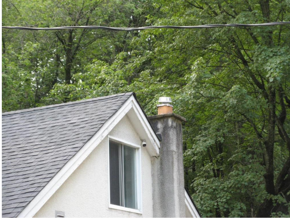
Photo 1 – Chimneys on the residences (this example is 3044 Innes Road) are vented, preventing potential chimney swift access. View looking southeast