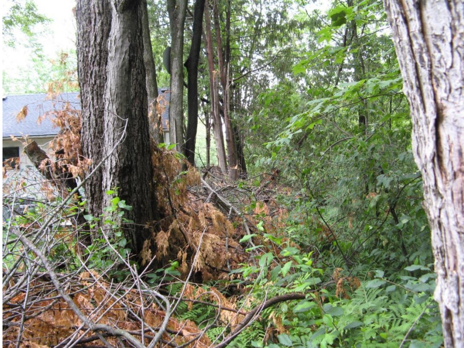
Photo 6 - Maples and cedars along the south portion of the east fenceline of 3044 Innes Road. In forefront is mature sugar maple east of site with critical root zone extending onto the site. View looking north