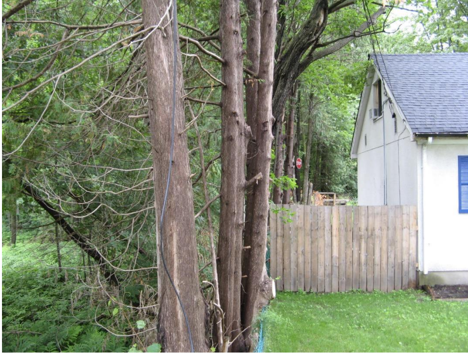
Photo 5 – White cedars along the east fenceline of 3044 Innes Road, south of Innes Road. Front cedars are on City property but will be retained. View looking south.