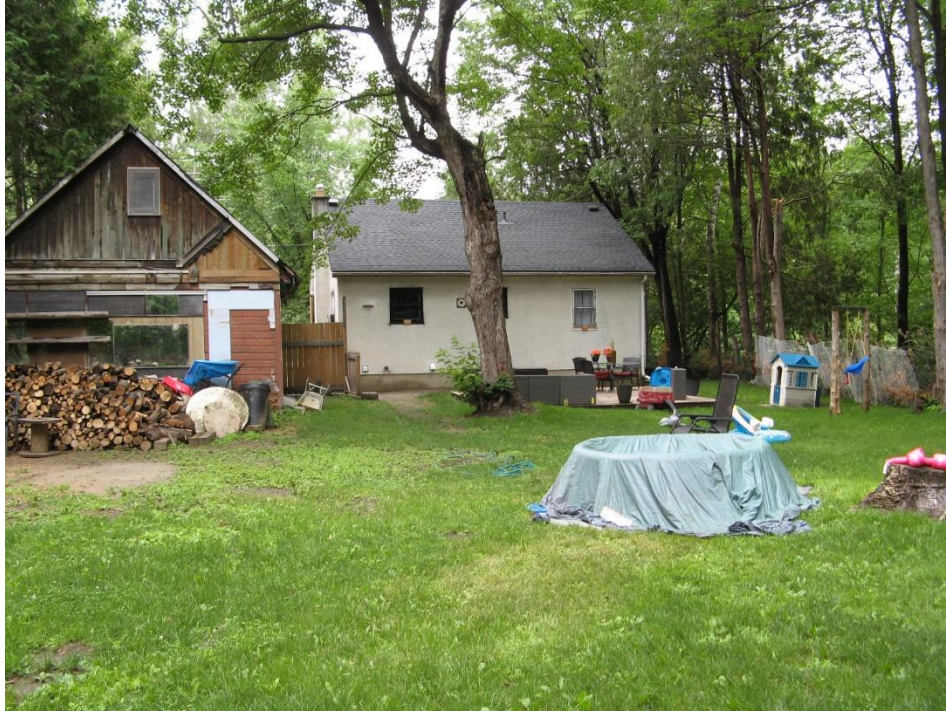
Photo 3 – Rear yard of 3044 Innes Road. View looking north to red maple in apparently poor condition.