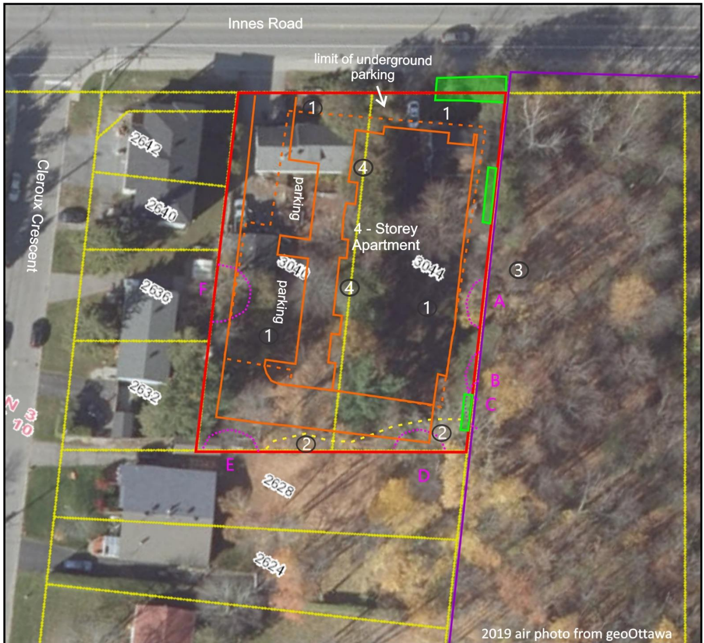
2019 air photo