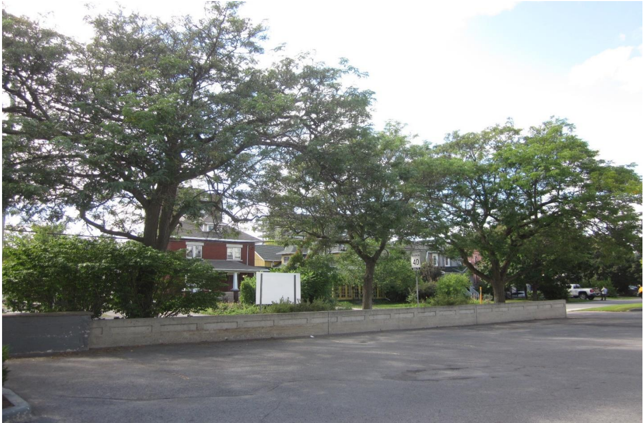
Picture 2. Trees #2, 3 and 4, honey-locusts on city lands adjacent to 403 Richmond Road