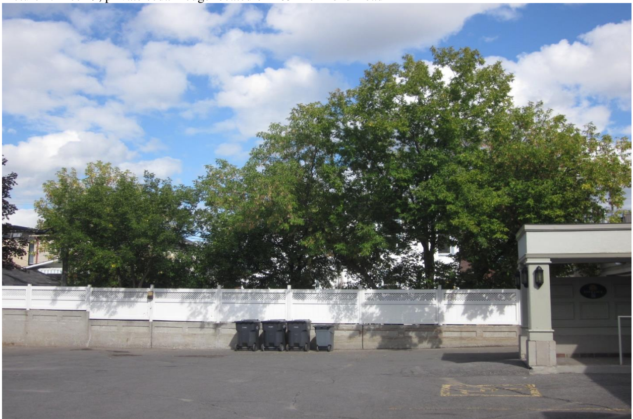
Picture 5. Trees #10, 11 and 12, neighbouring Manitoba maples located adjacent to 403 Richmond Road