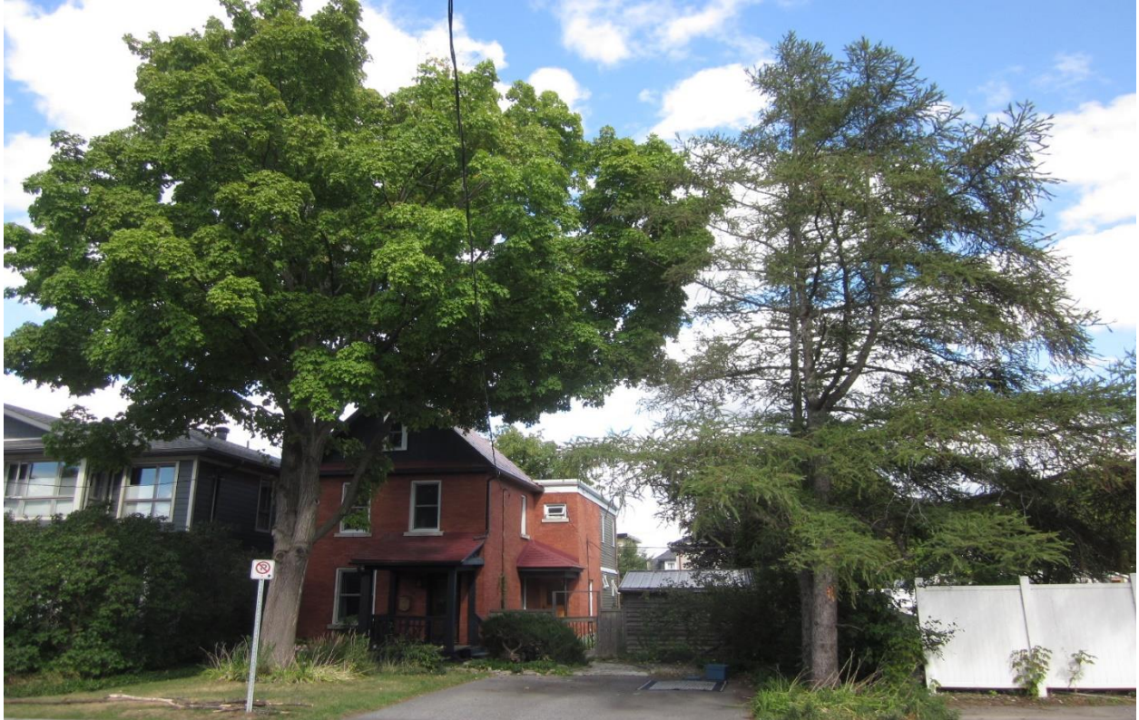
Picture 3. Trees #6, 7 and 8 (right to left), private larch and maple trees located on 403 Richmond Road