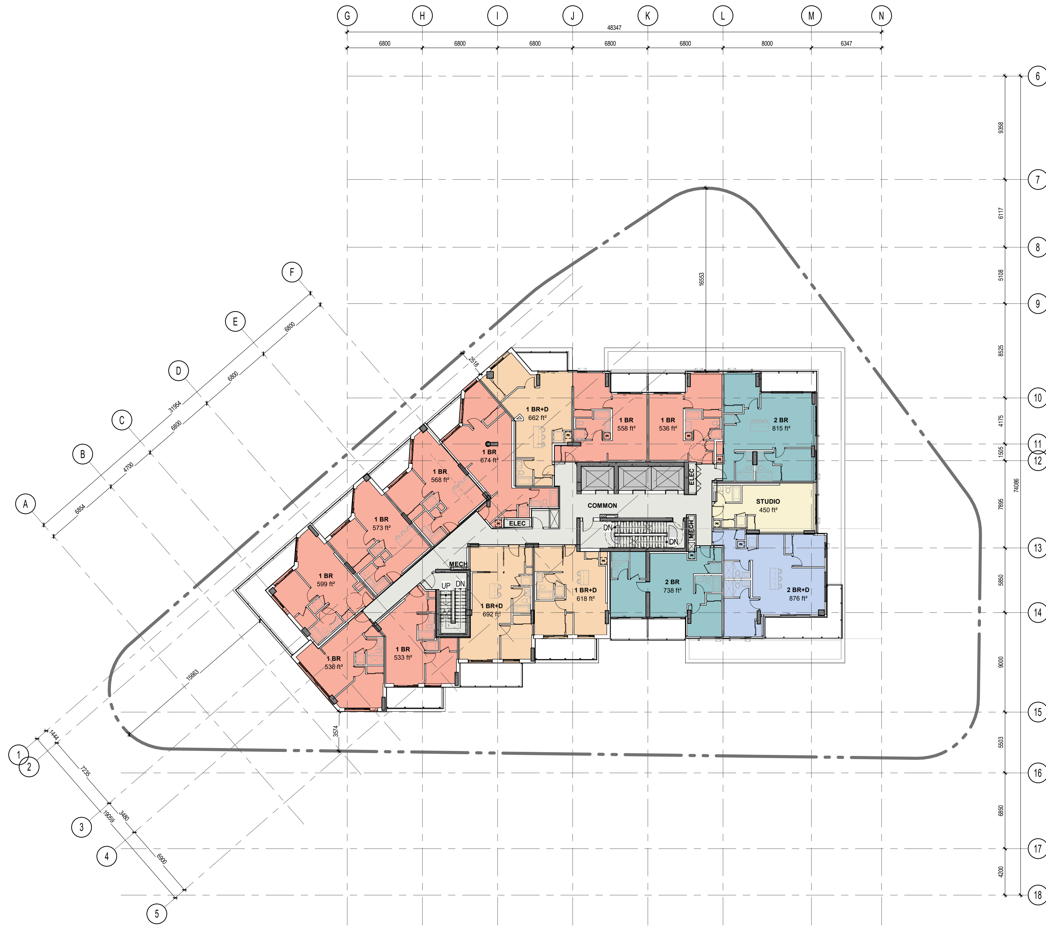
OVERALL PLAN - LEVEL 6-8 1:200