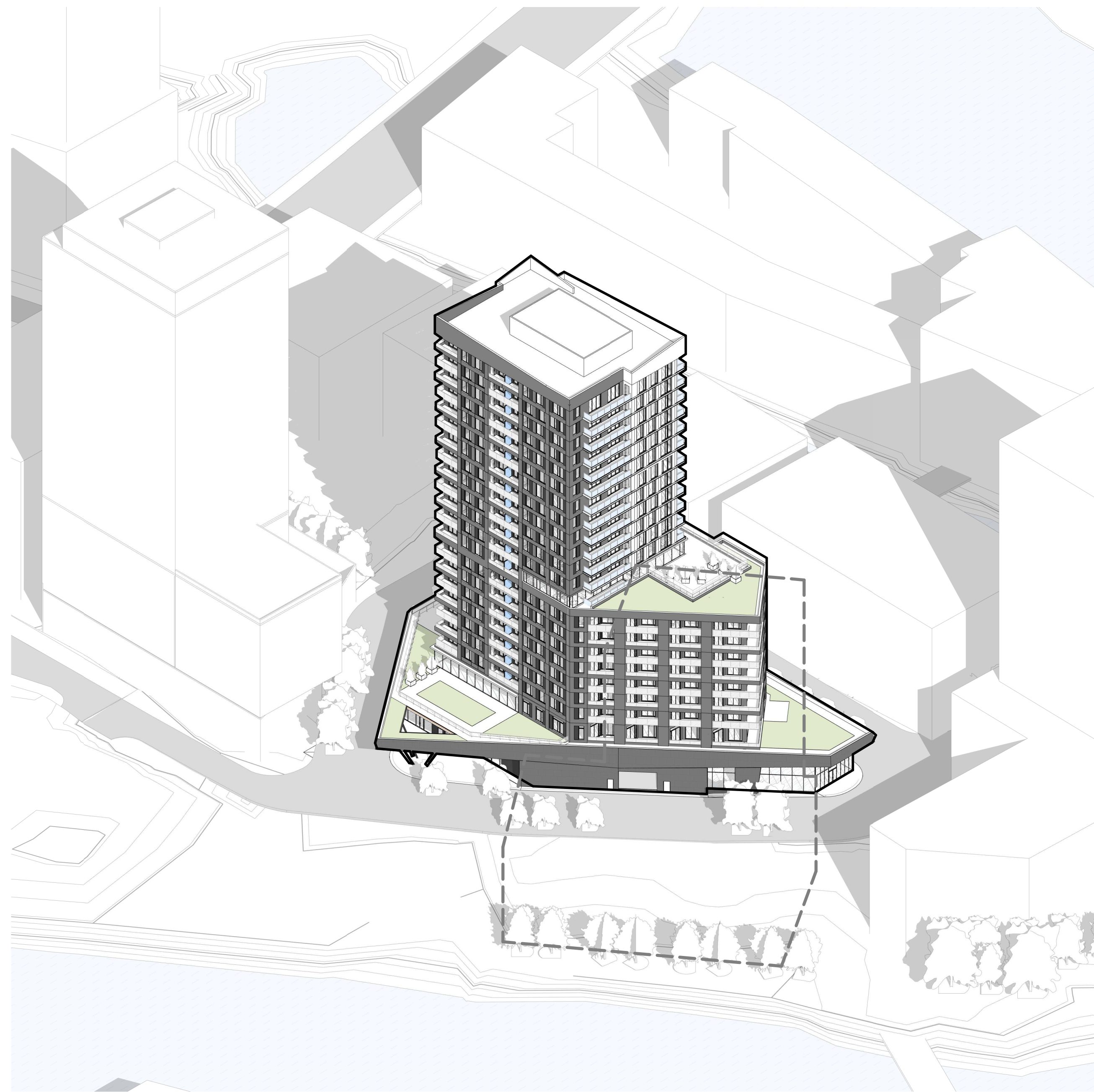
AXO - SOUTH-EAST

Architect NEUF architect(e)s CANADA INC. 47 Clarence St, Suite 406, Ottawa, ON K1N 9K1 NEUF ARCHITECTS