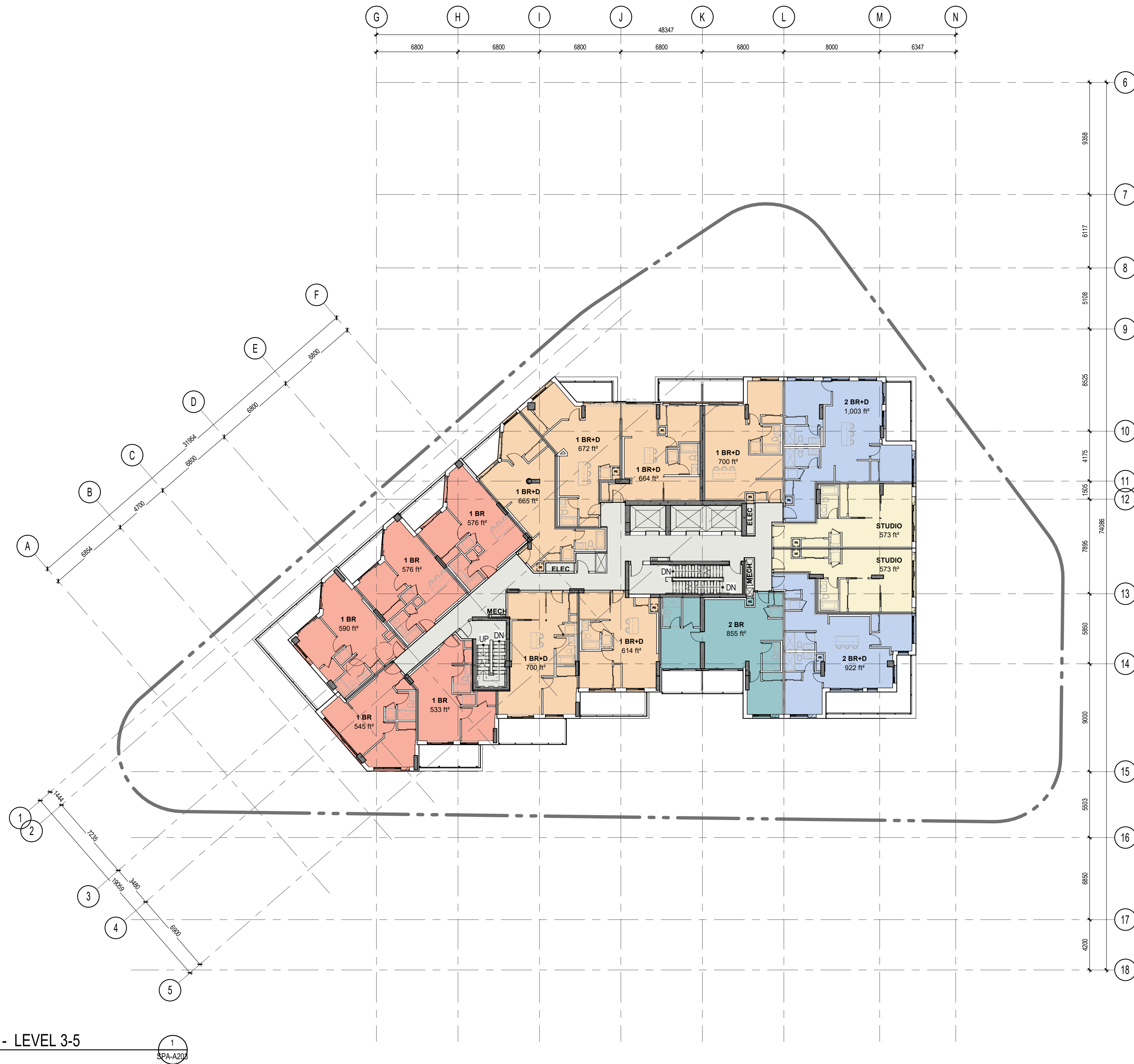
OVERALL PLAN - LEVEL 3-5 1:200