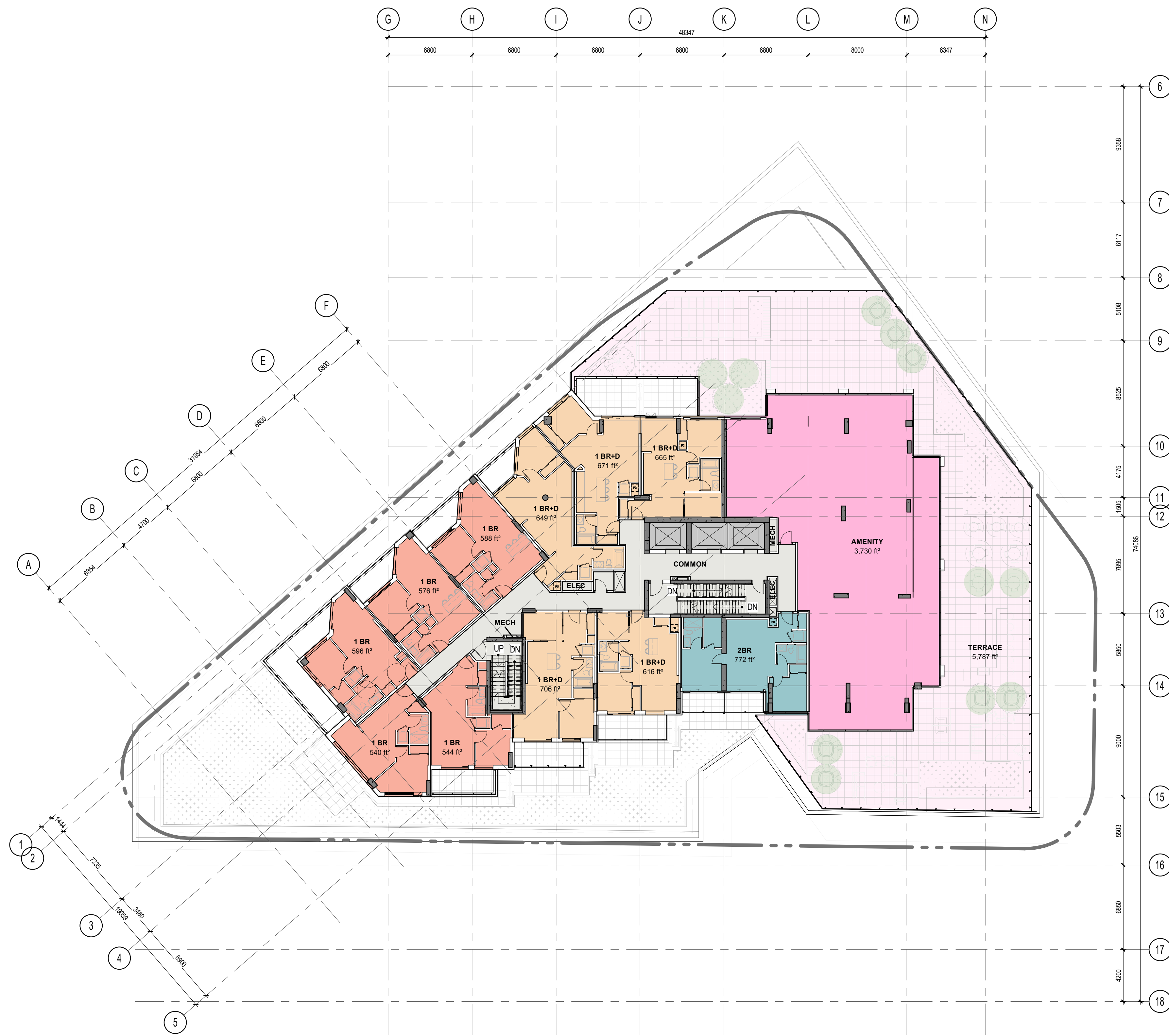
OVERALL PLAN - LEVEL 2 AMENITY 1 : 200 SPA-A202