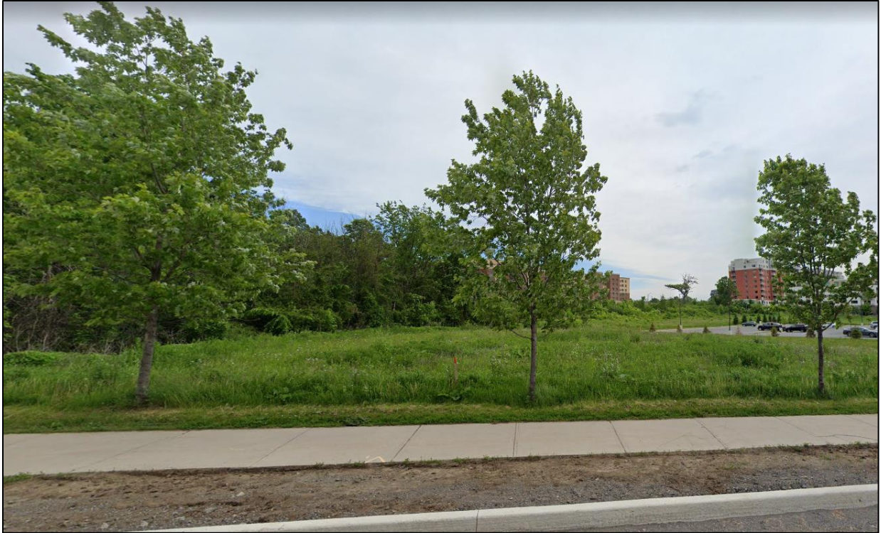
Site Photo 4)