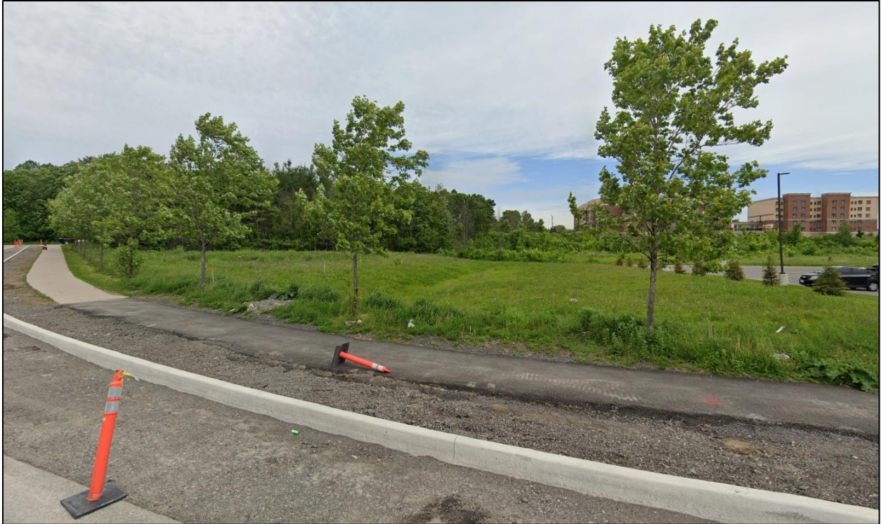
Site Photo 2)