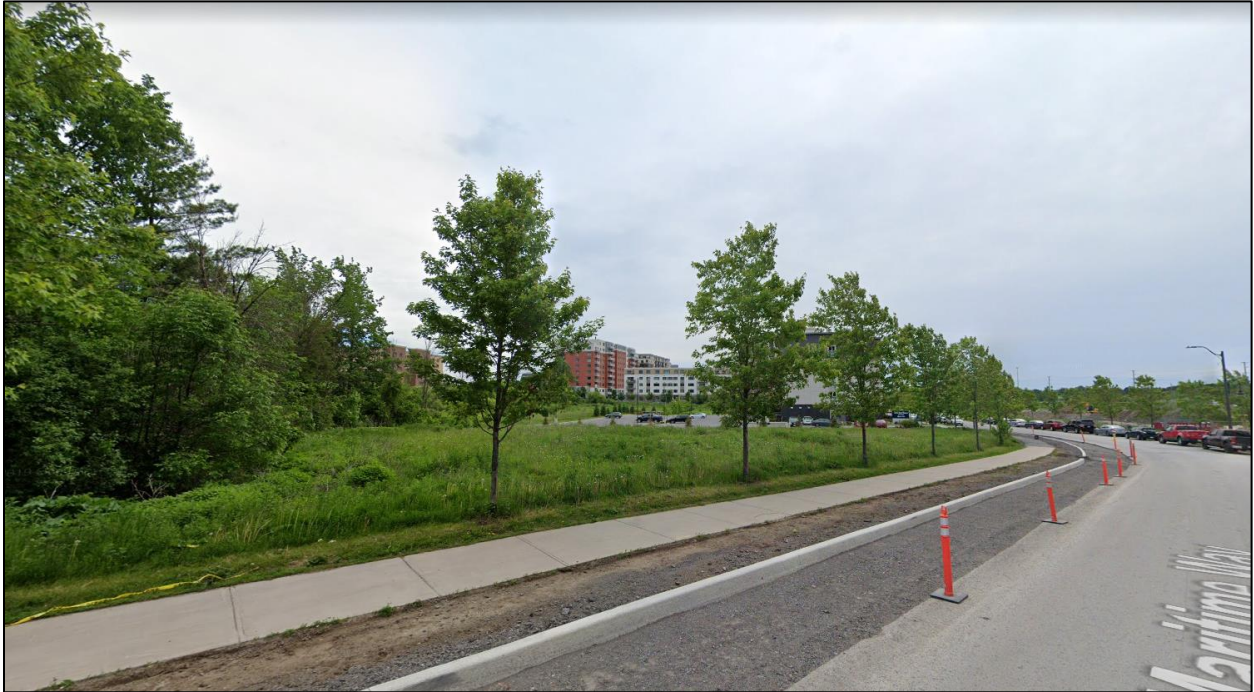
Site Photo 3)