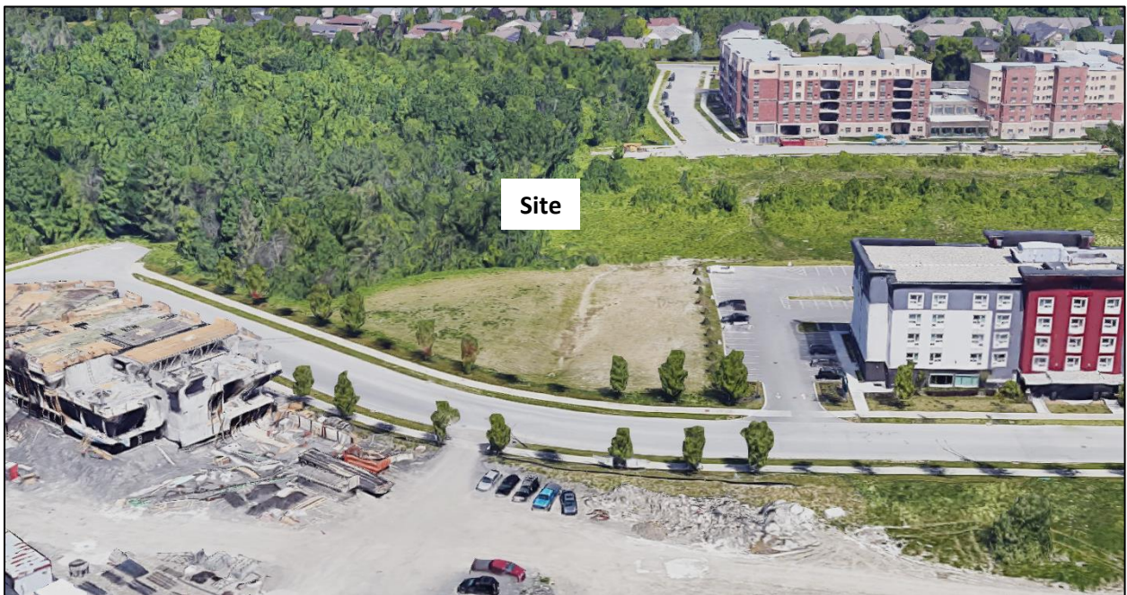
Site Photo 1)

Within the analysis of the site's immediate 100-meter radius, there is very little in the way of key destinations, transit stations, or public spaces. Within this radius we find Marriott's TownePlace Suites, a comparatively similar example to this proposal, which has been successfully incorporated into the existing urban fabric in a manner similar to our expectations of this proposal. The only other existing architecture is the Timberwalk Retirement Community across Maritime Way. This project, 1 story taller than our proposal roughly fits with the visible urban densification of the area as well. These projects, being of a similar nature, speak to the quality of the urban fabric's as being suitable for this manner of architecture, from the perspective of both scale and character.