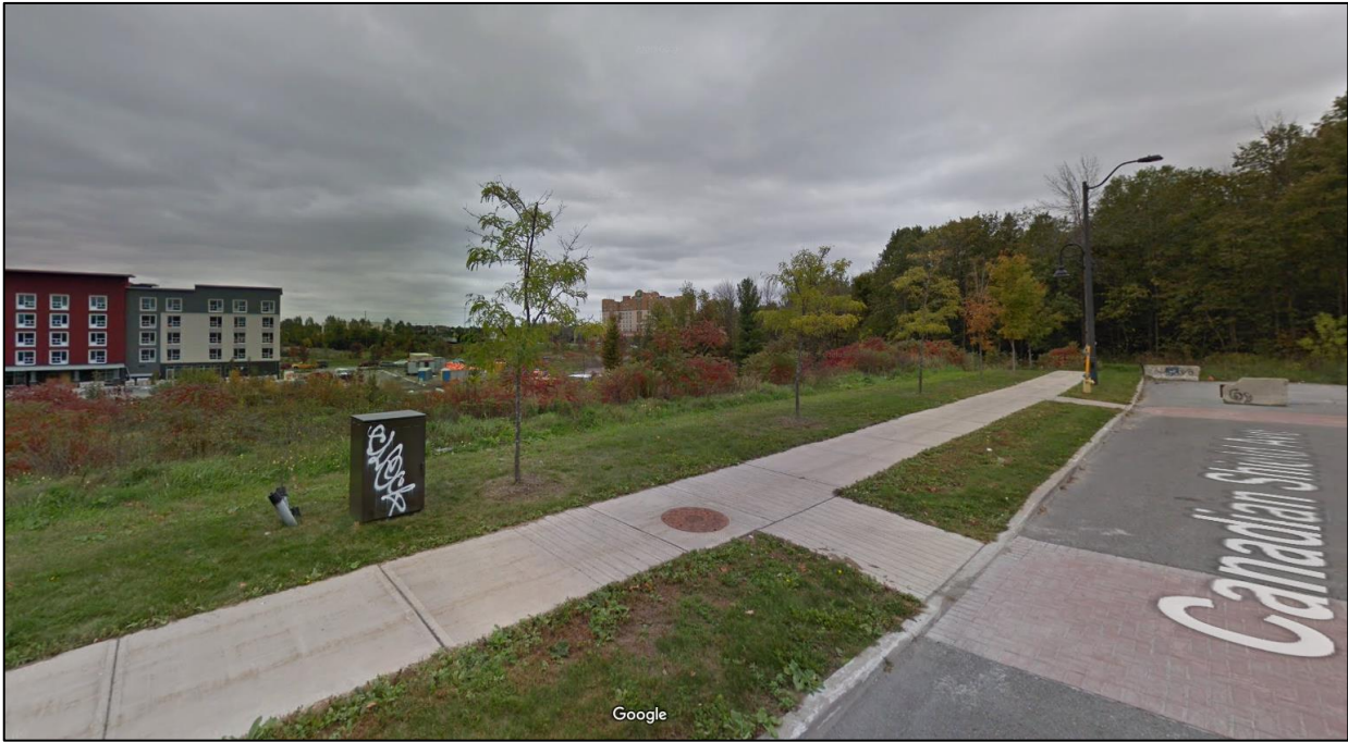
Site Photo 5)