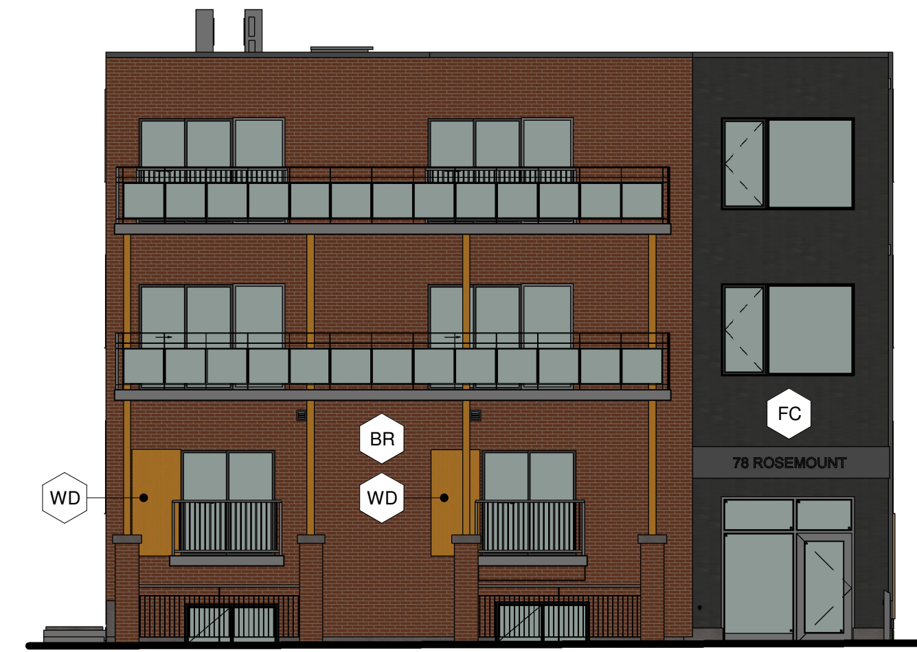
2 EAST ELEVATION A300 | 1:100