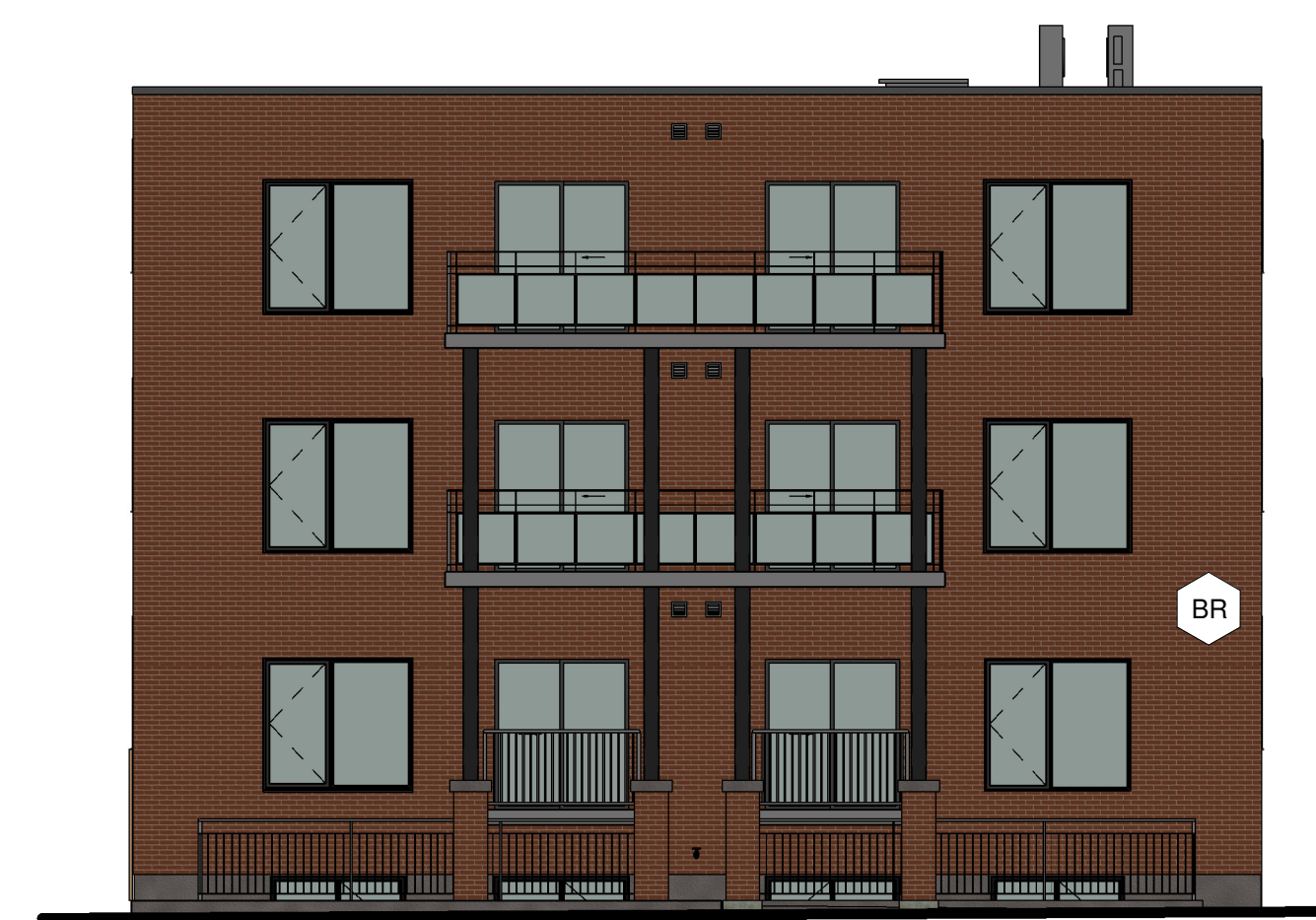
4 WEST ELEVATION A300 | 1:100