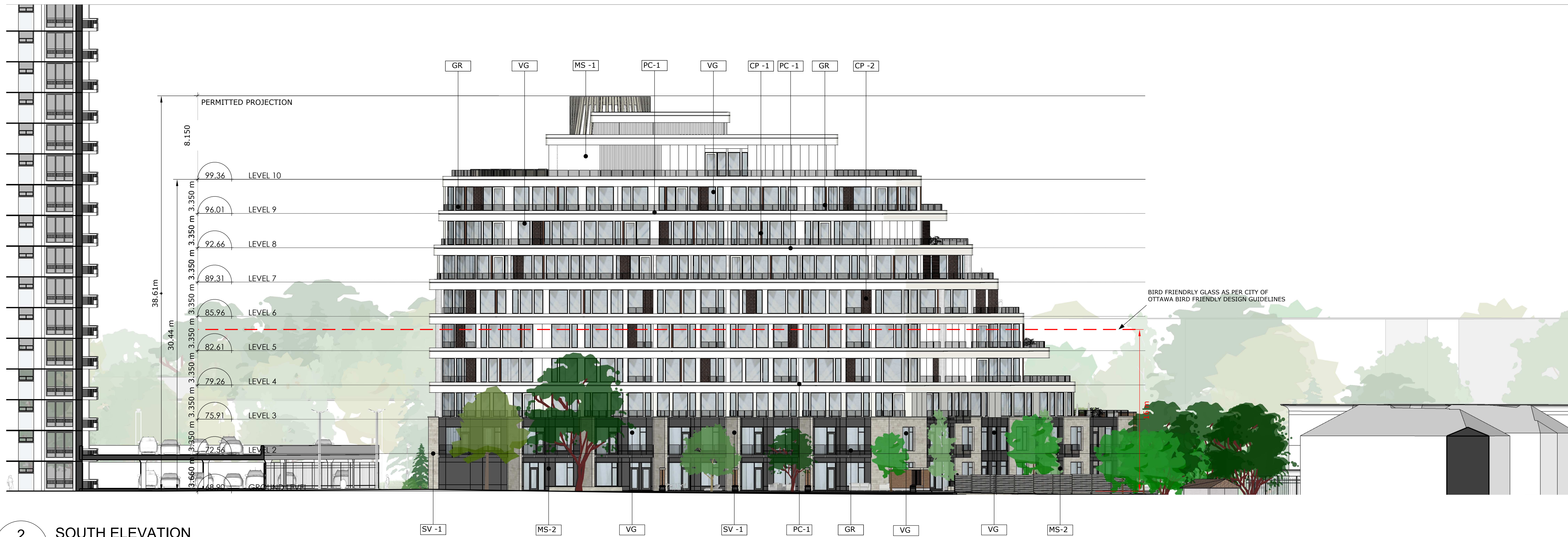
2 SOUTH ELEVATION A3.01 Scale: 1: 200