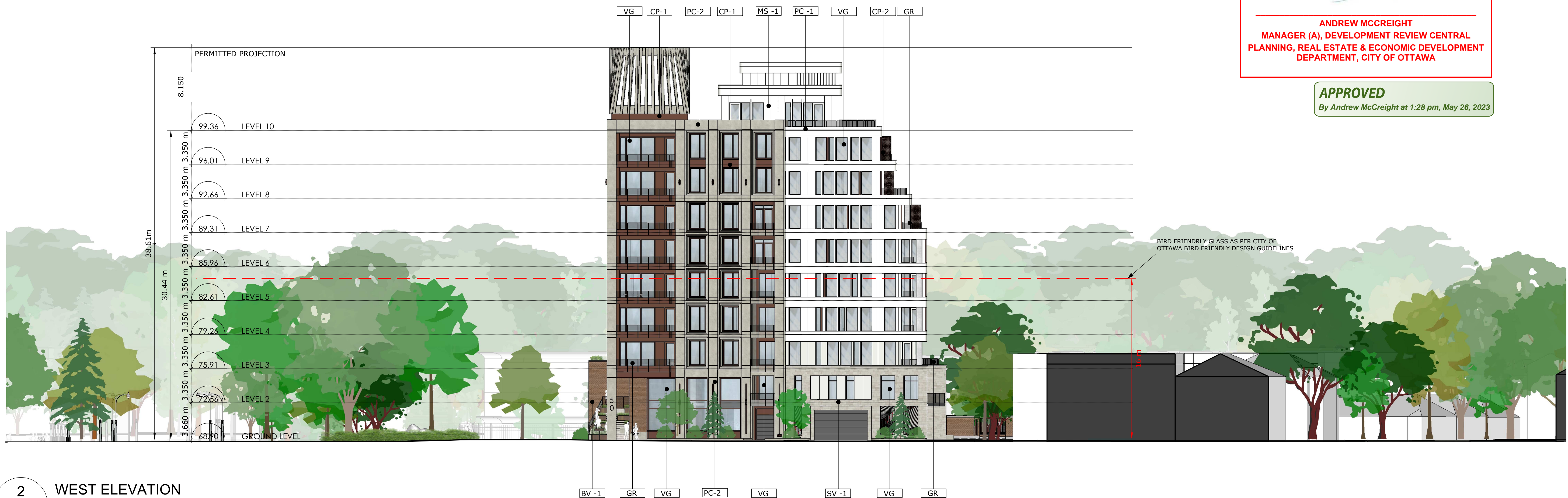
2 WEST ELEVATION