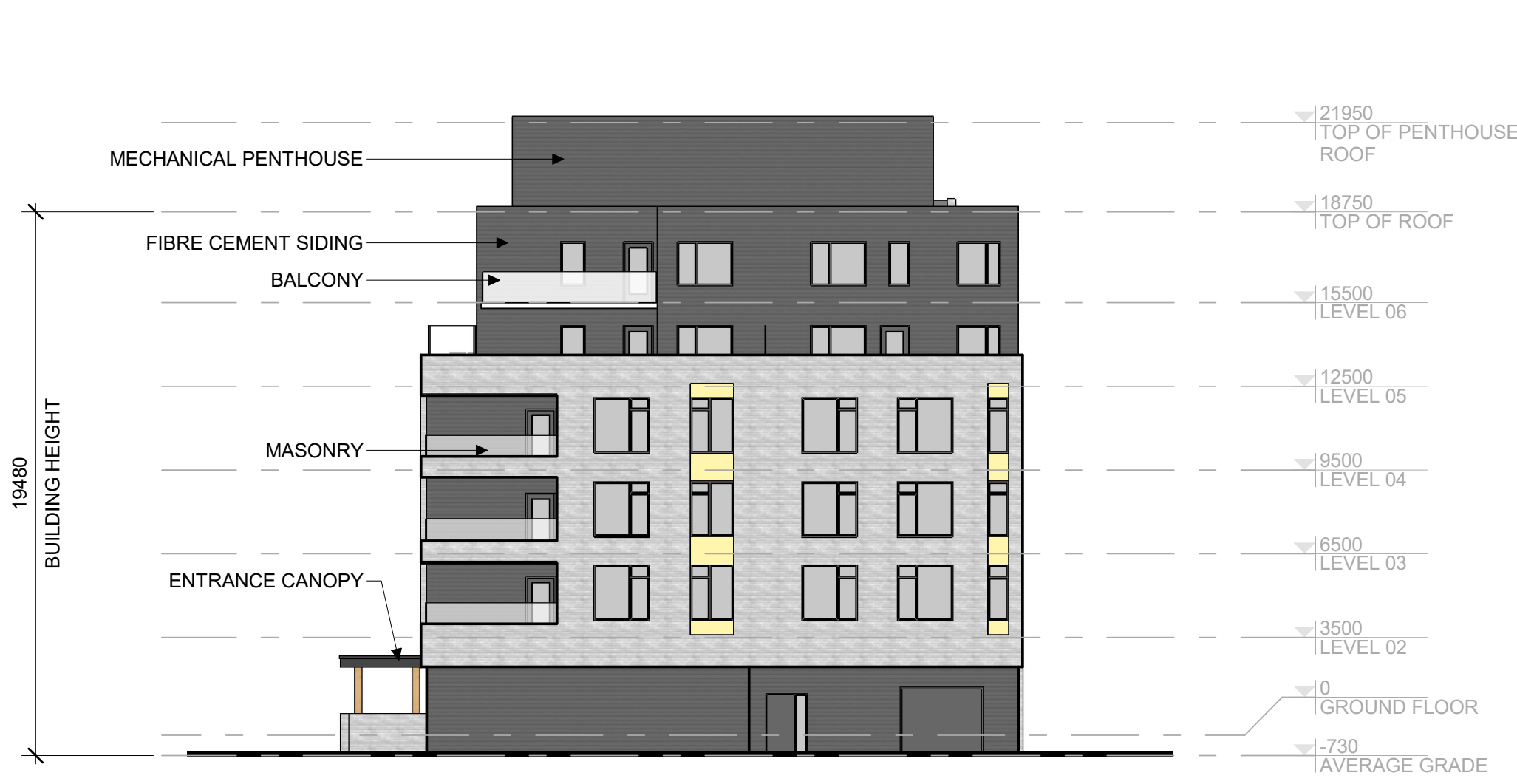
1 North Elevation A.300 | 1:200