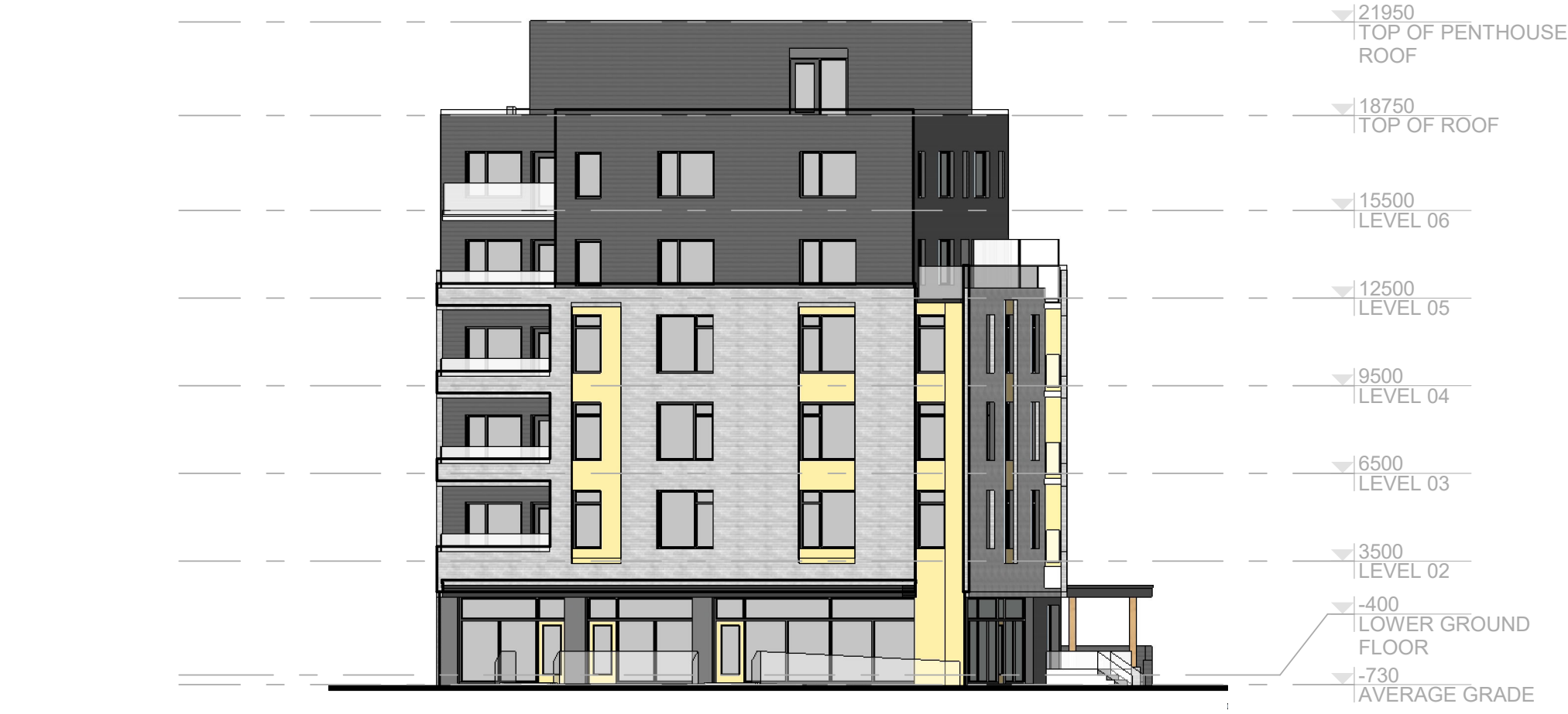
3 SOUTH ELEVATION A.300 | 1:200