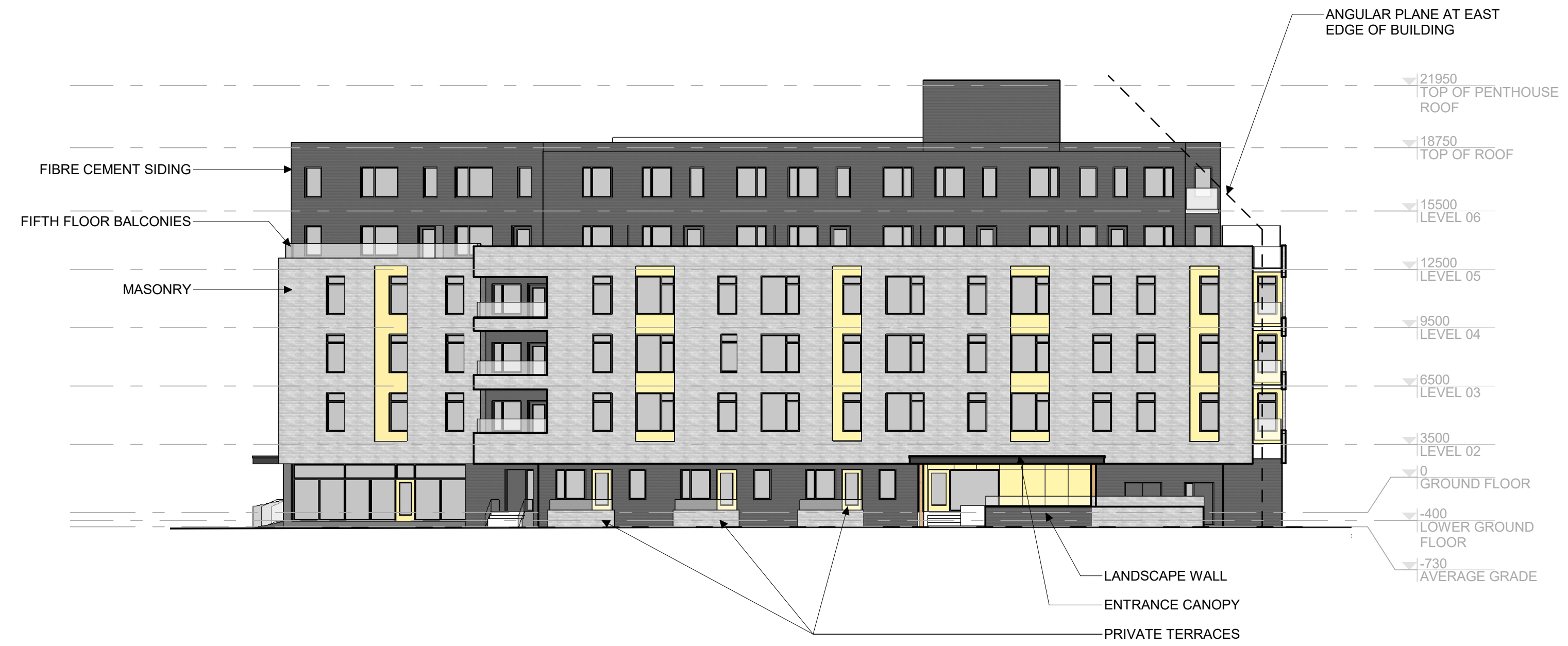
2 EAST ELEVATION A.300 | 1:200