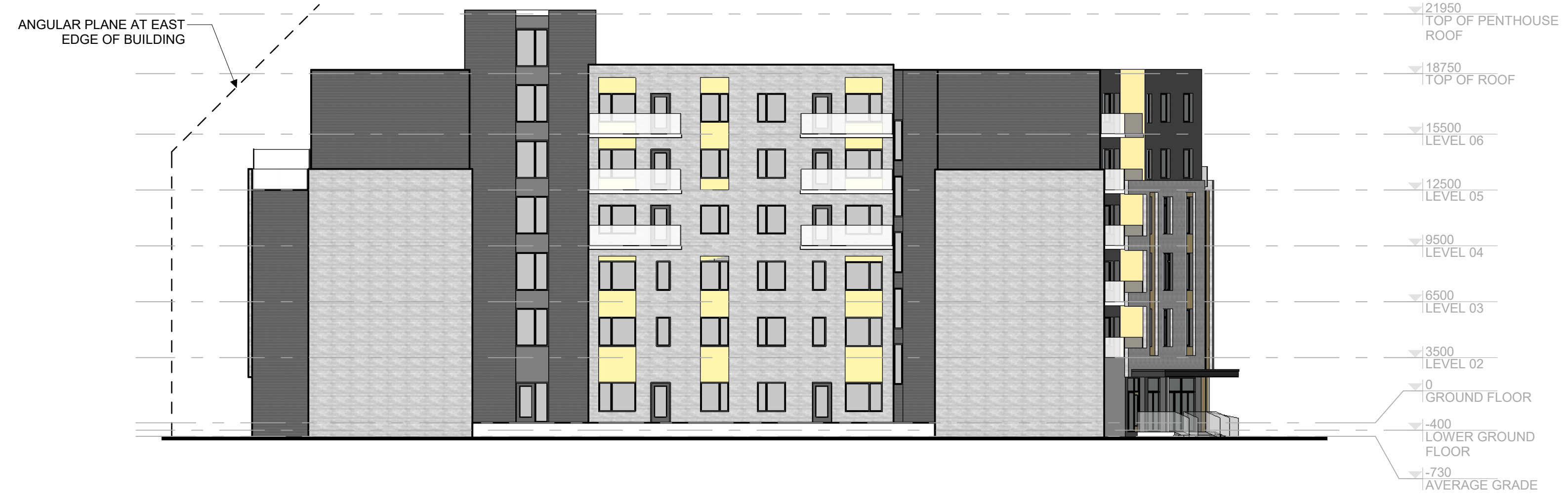
4 WEST ELEVATION A.300 | 1:200