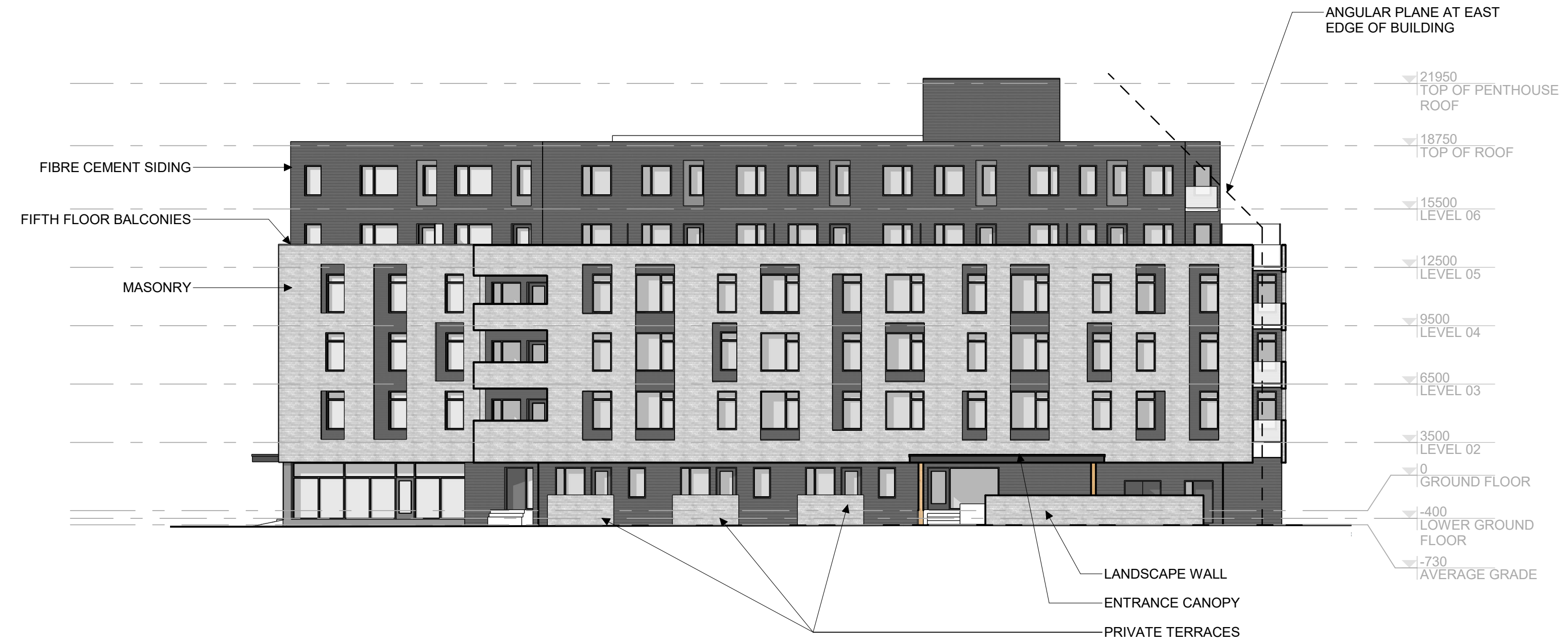
2 EAST ELEVATION A.300 | 1:200