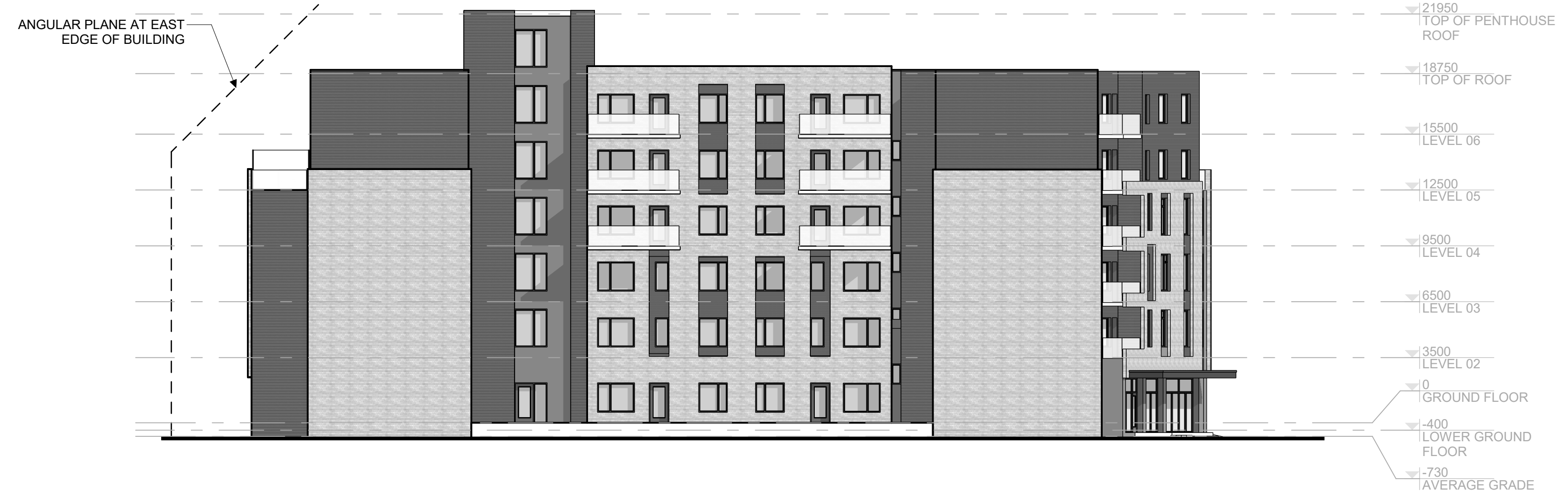
4 WEST ELEVATION A.300 | 1:200