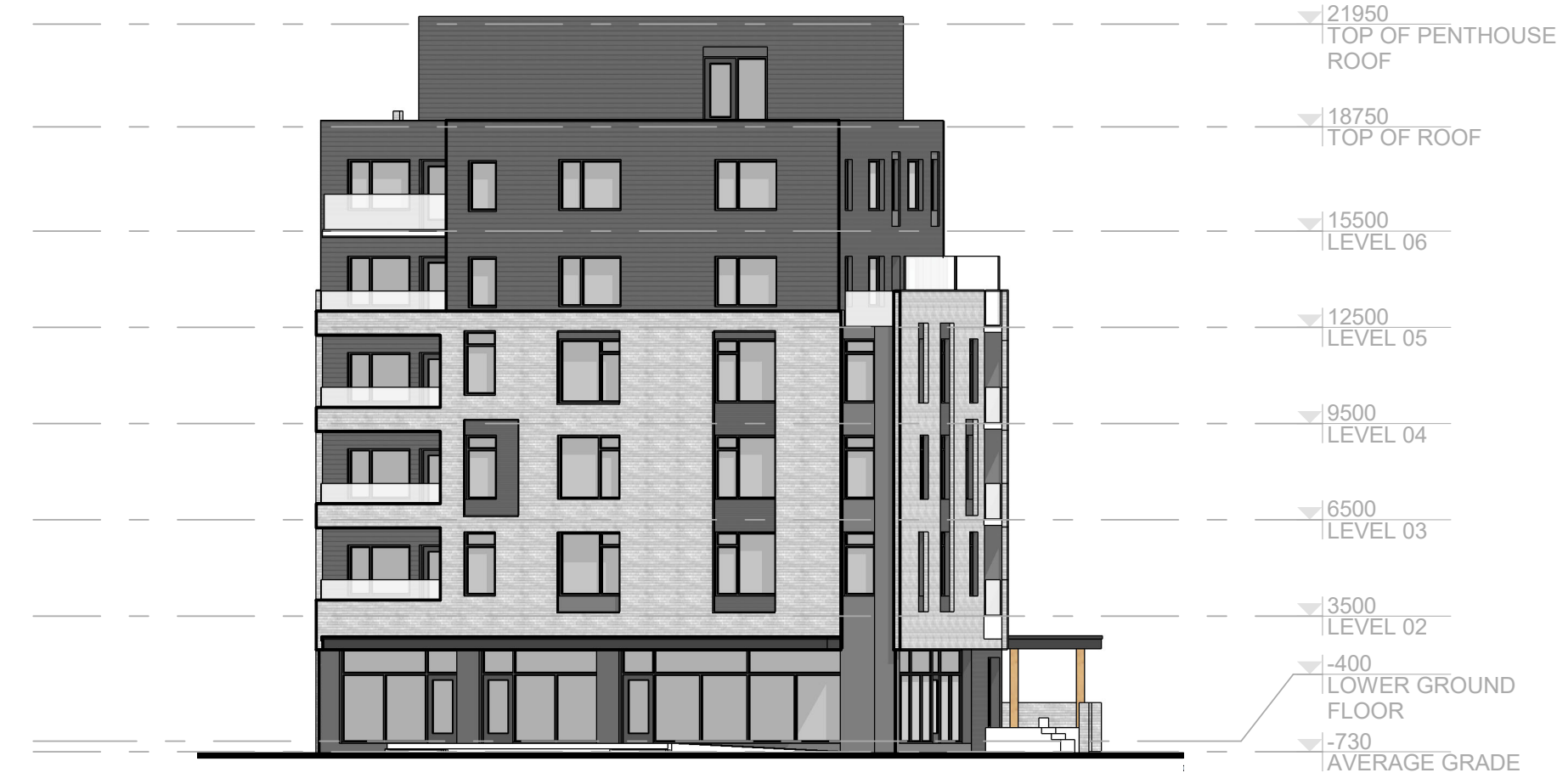
3 SOUTH ELEVATION A.300 | 1:200