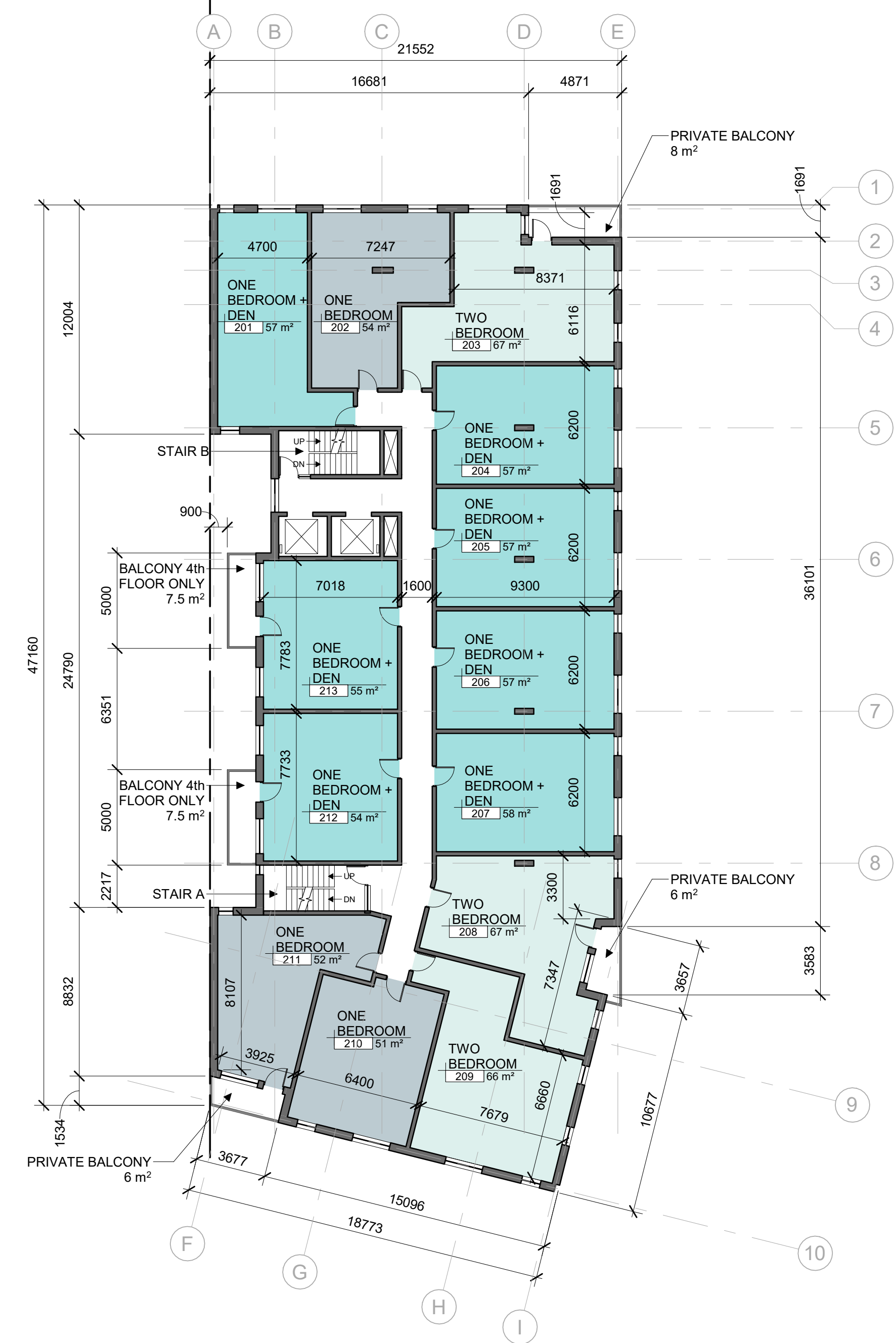
3 TYPICAL UPPER FLOOR PLAN