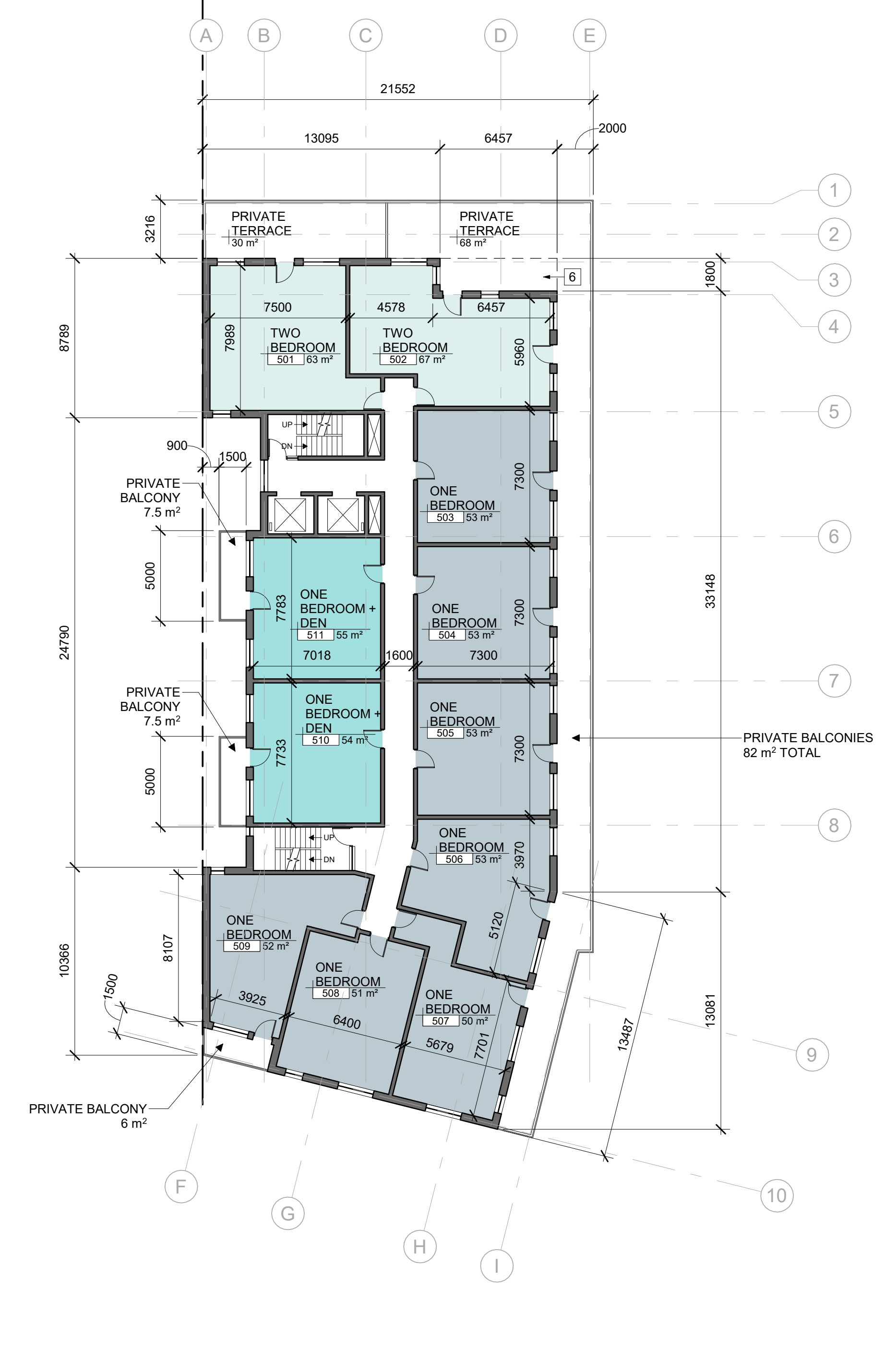
1 FIFTH FLOOR PLAN