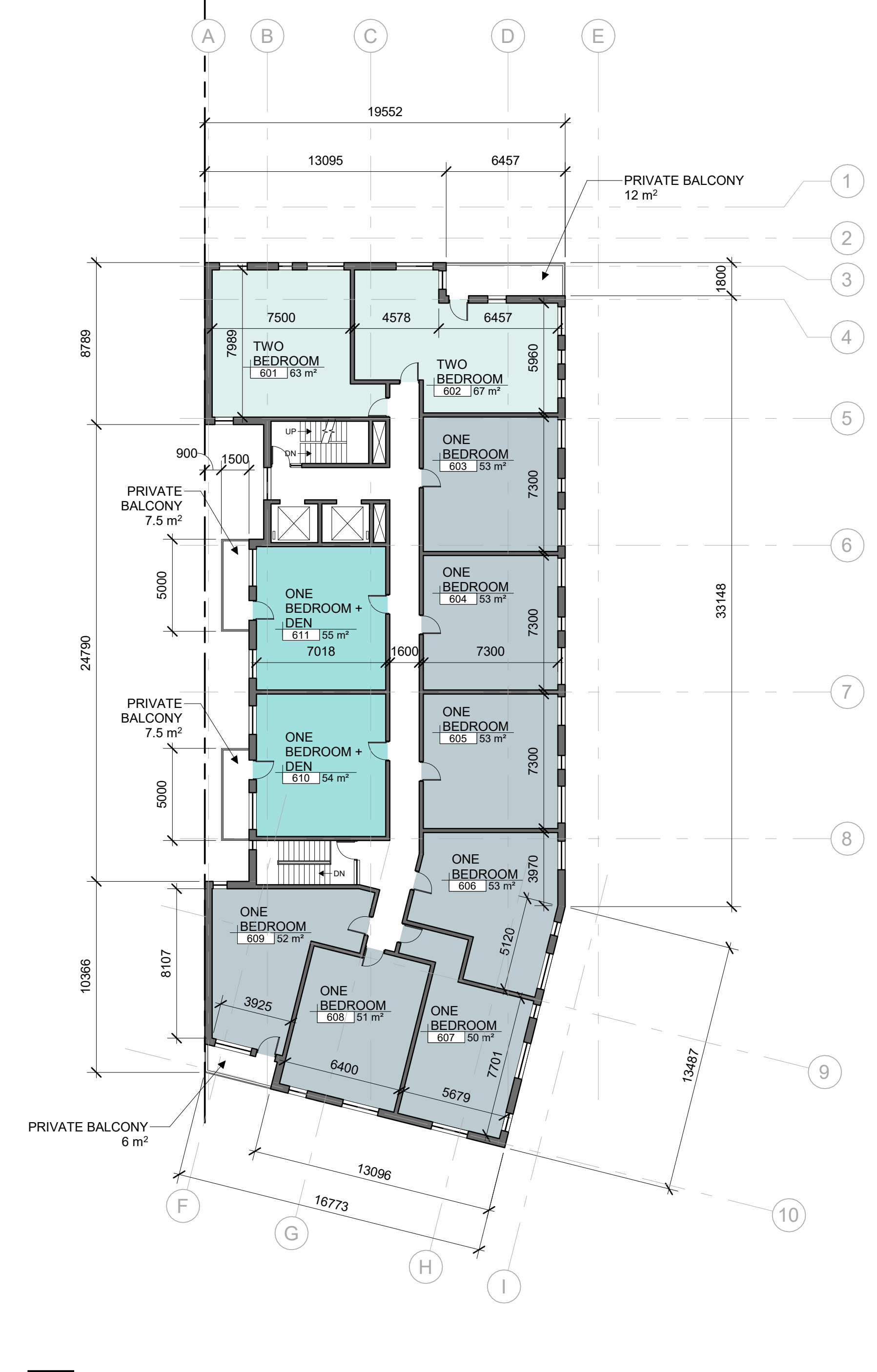
2 SIXTH FLOOR PLAN