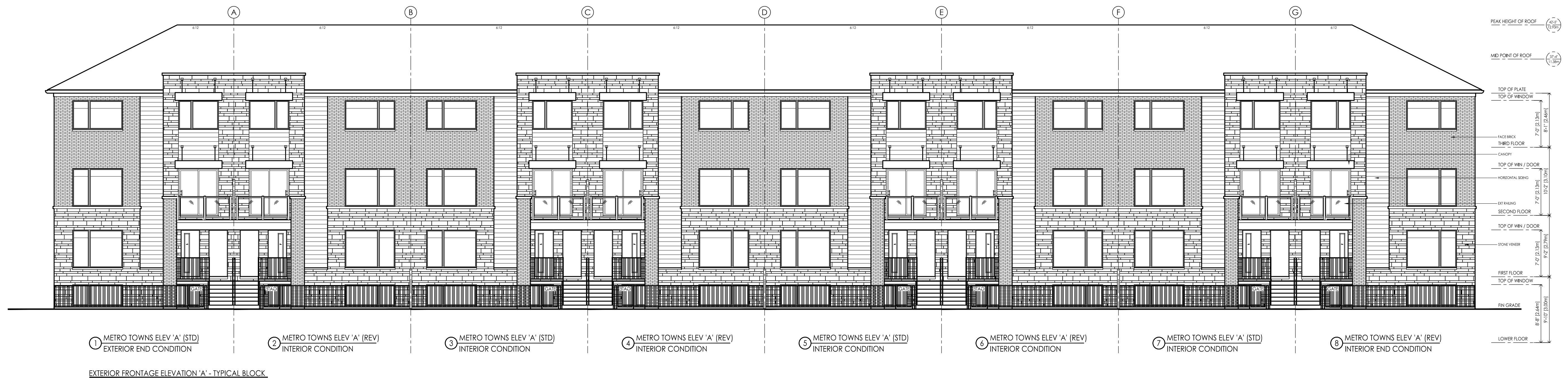
EXTERIOR FRONTAGE ELEVATION 'A' - TYPICAL BLOCK