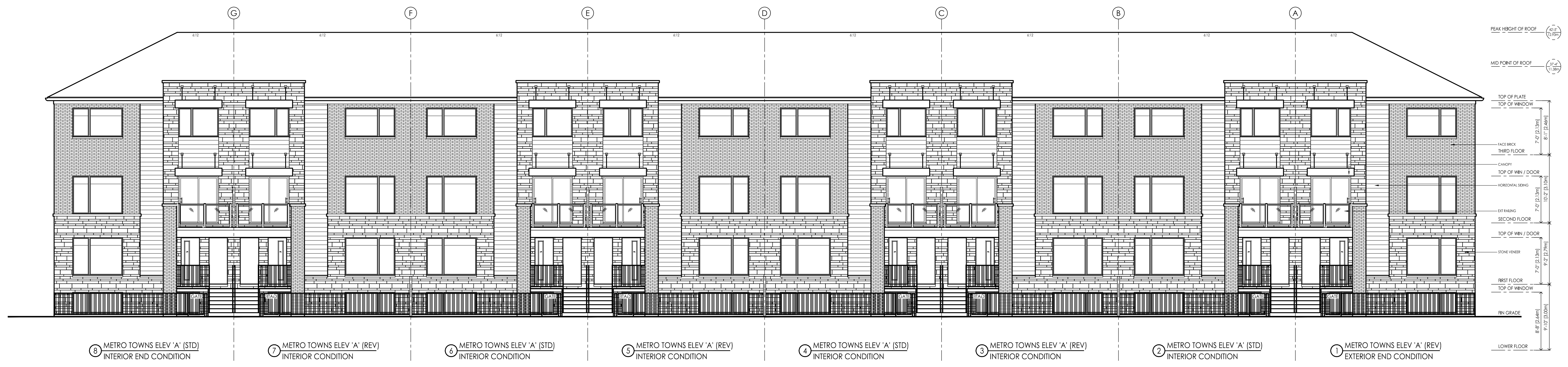
INTERIOR FRONTAGE ELEVATION 'A' - TYPICAL BLOCK