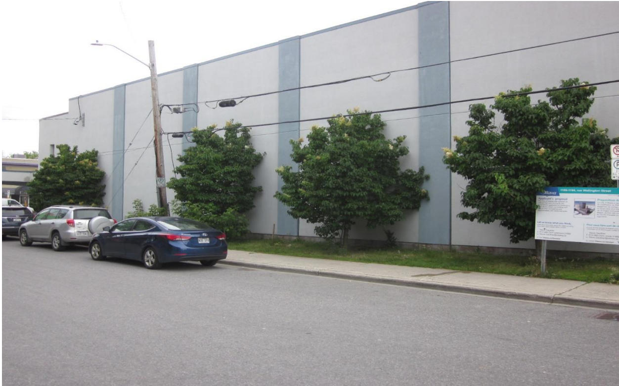
Picture 1. Trees #1-4 (right to left), Japanese tree lilacs on city property adjacent to 1186-1194 Wellington Street