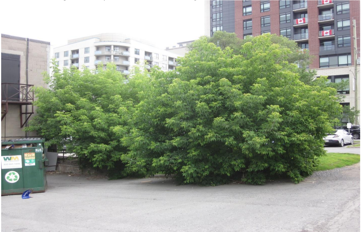
Picture 5. Trees #17 and 18, private Manitoba maples at 1186-1194 Wellington Street