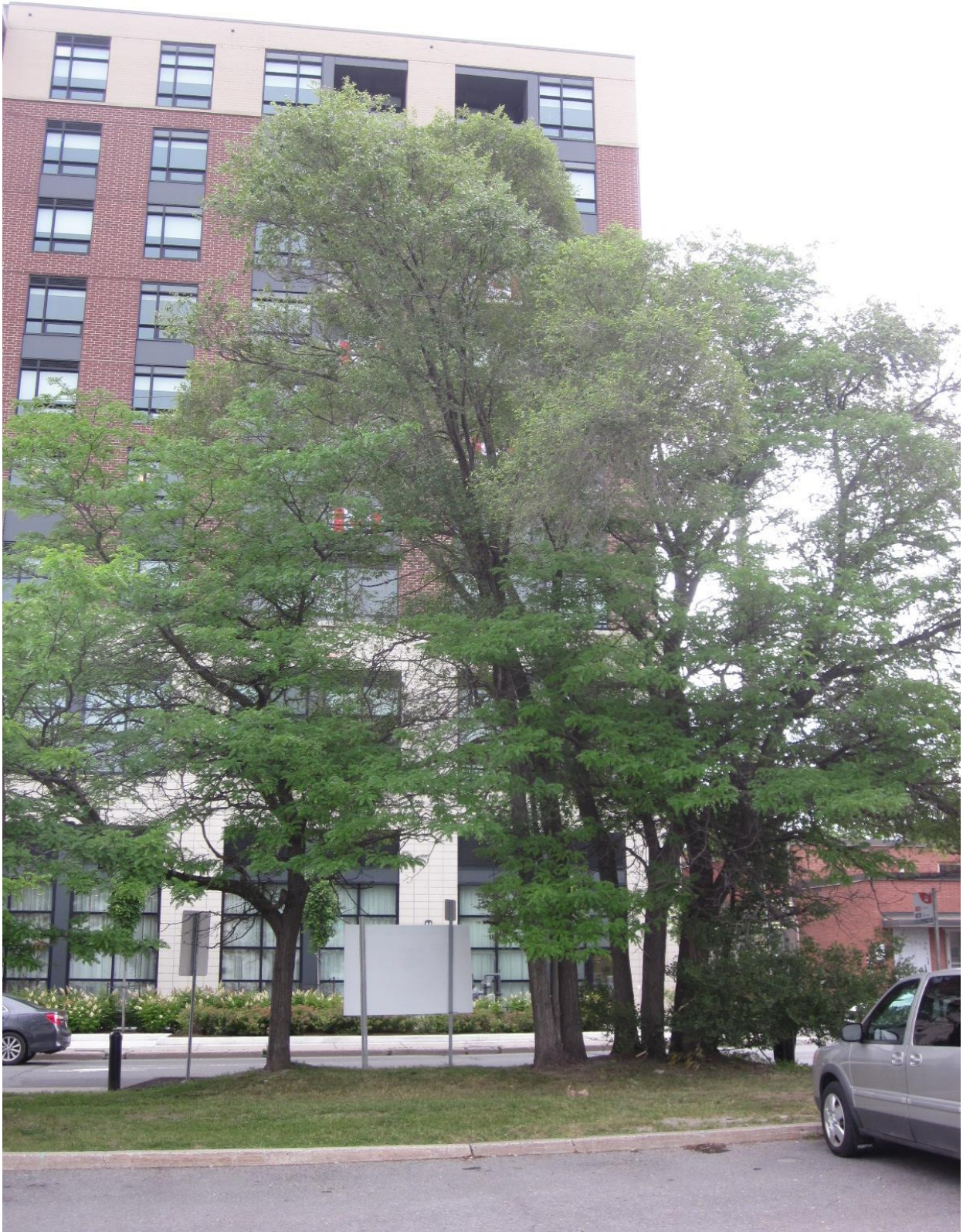
Picture 3. Trees #11-15 (left to right) on city property adjacent to 1186-1194 Wellington Street