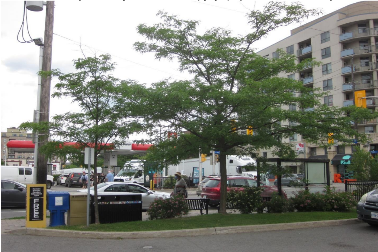
Picture 2. Trees #7 and 8, private Honey-locusts at 1186-1194 Wellington Street