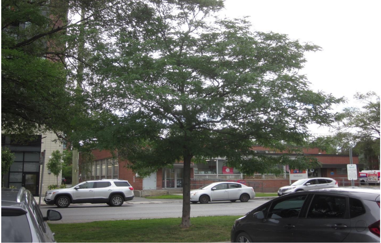
Picture 4. Tree #16, private Honey-locust at 1186-1194 Wellington Street