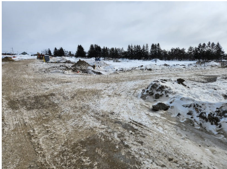
Photo 2 - Looking southeast towards the Site