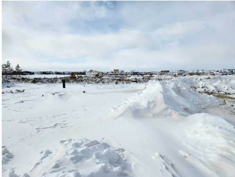
Photo 8 - Standing at the Site, looking west