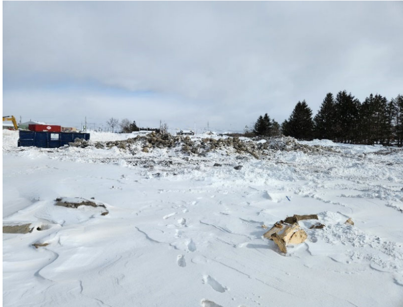
Photo 5 - Looking east, dumpster and aggregate piles