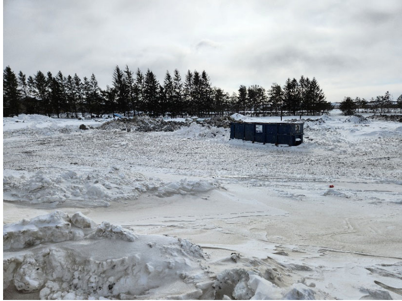
Photo 3 - Looking south across the Site, dumpster and aggregate piles