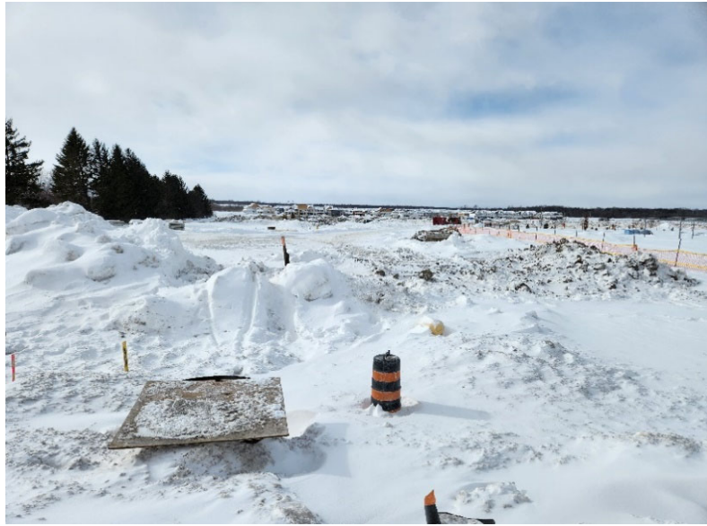
Photo 1 - Looking west across the Site, from Bank Street