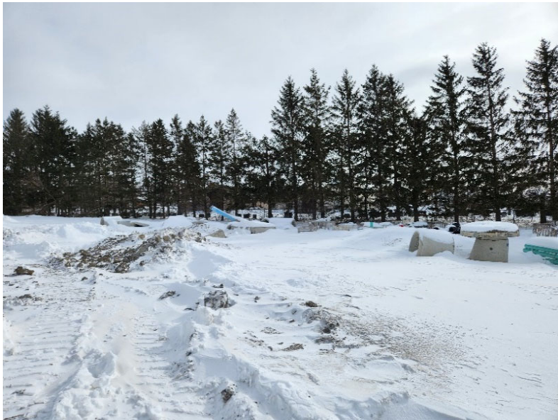
Photo 6 - Standing in the middle of the Site, looking south towards Hope Cemetary