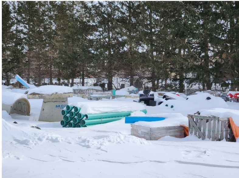
Photo 4 - Construction materials stoed on-site