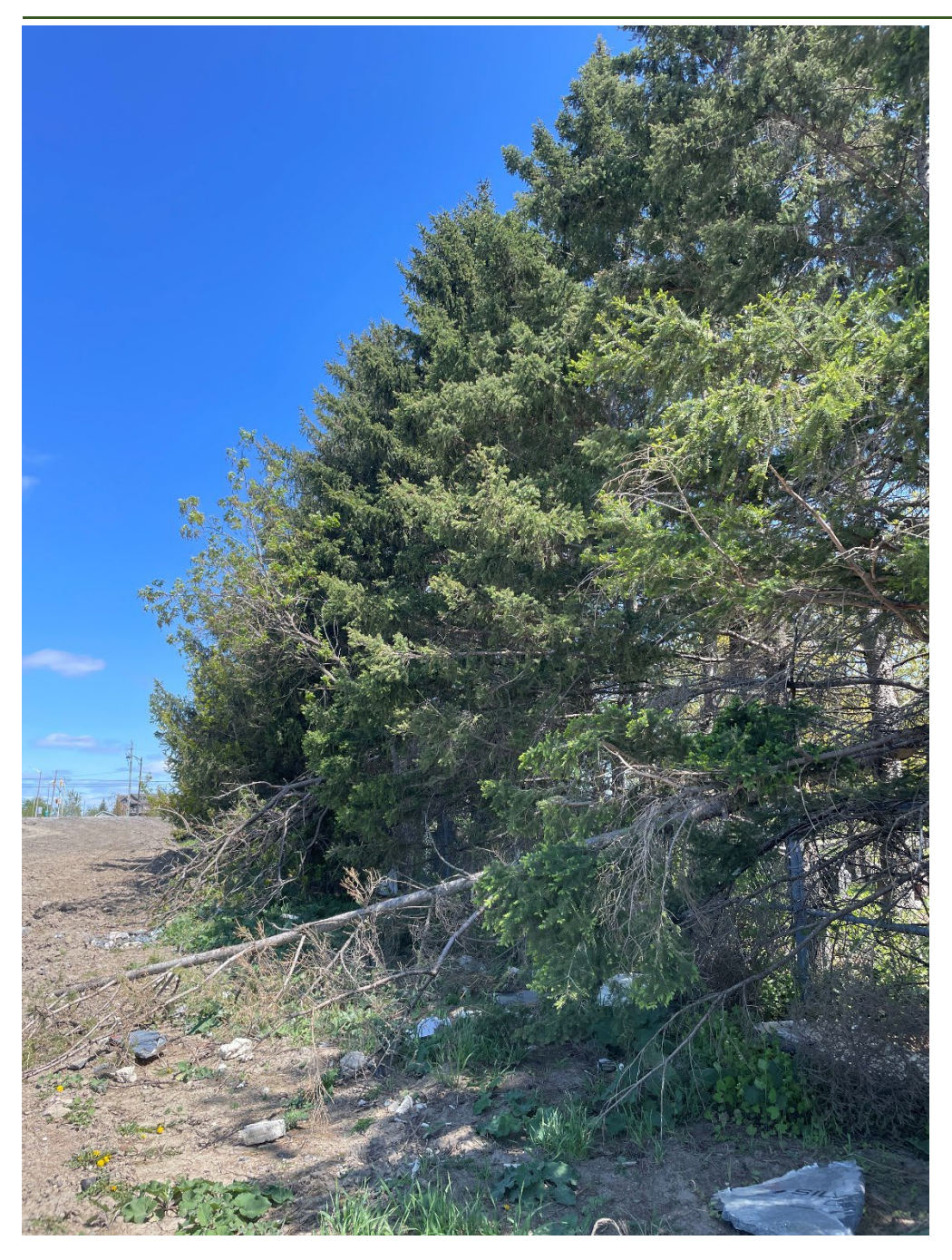
Figure 1: Hedgerow facing towards Bank Street. Note the low hanging branches that will require pruning

Dendron Forestry Services www.dendronforestry.ca 613.805.WOOD (9663) info@dendronforestry.ca