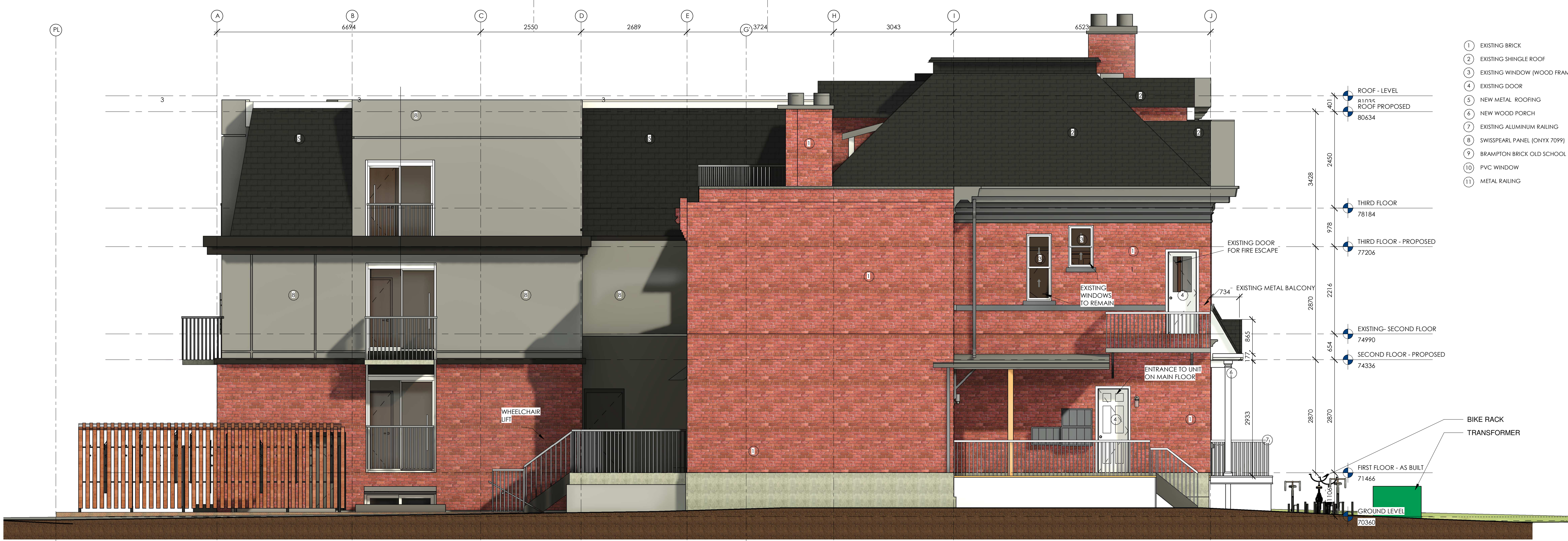
2 NORTH - WEST - ELEVATION 1:50