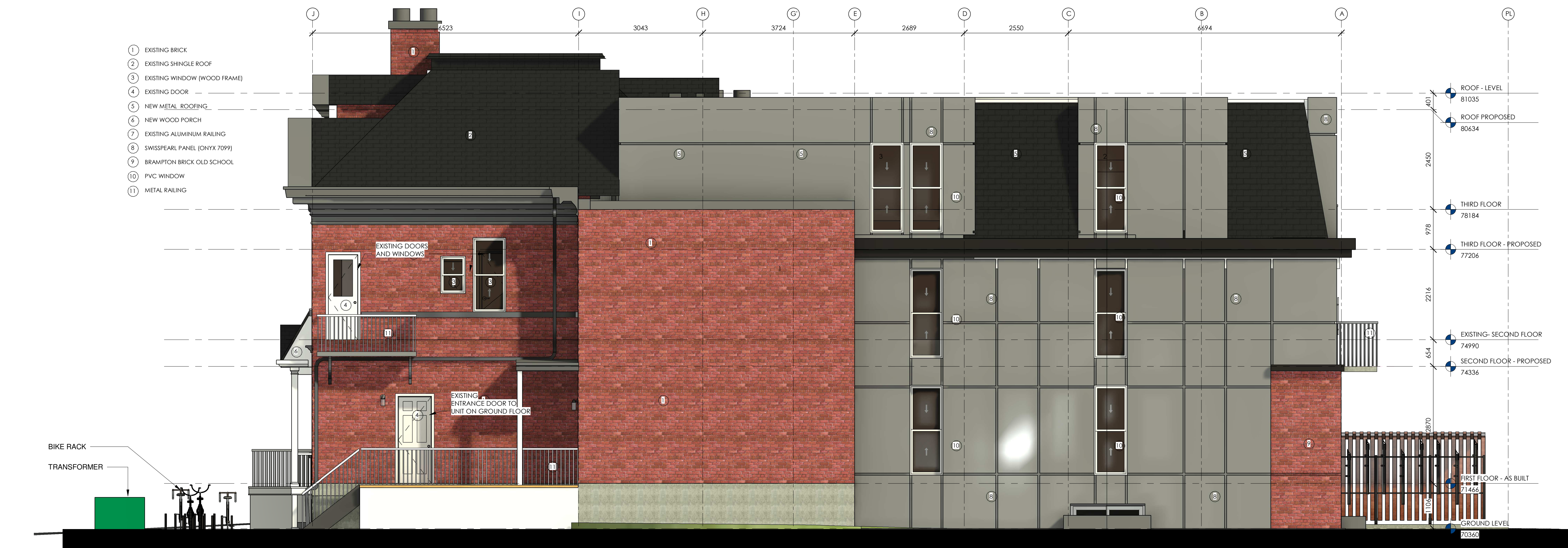
1 SOUTH - EAST - ELEVATION 1:50