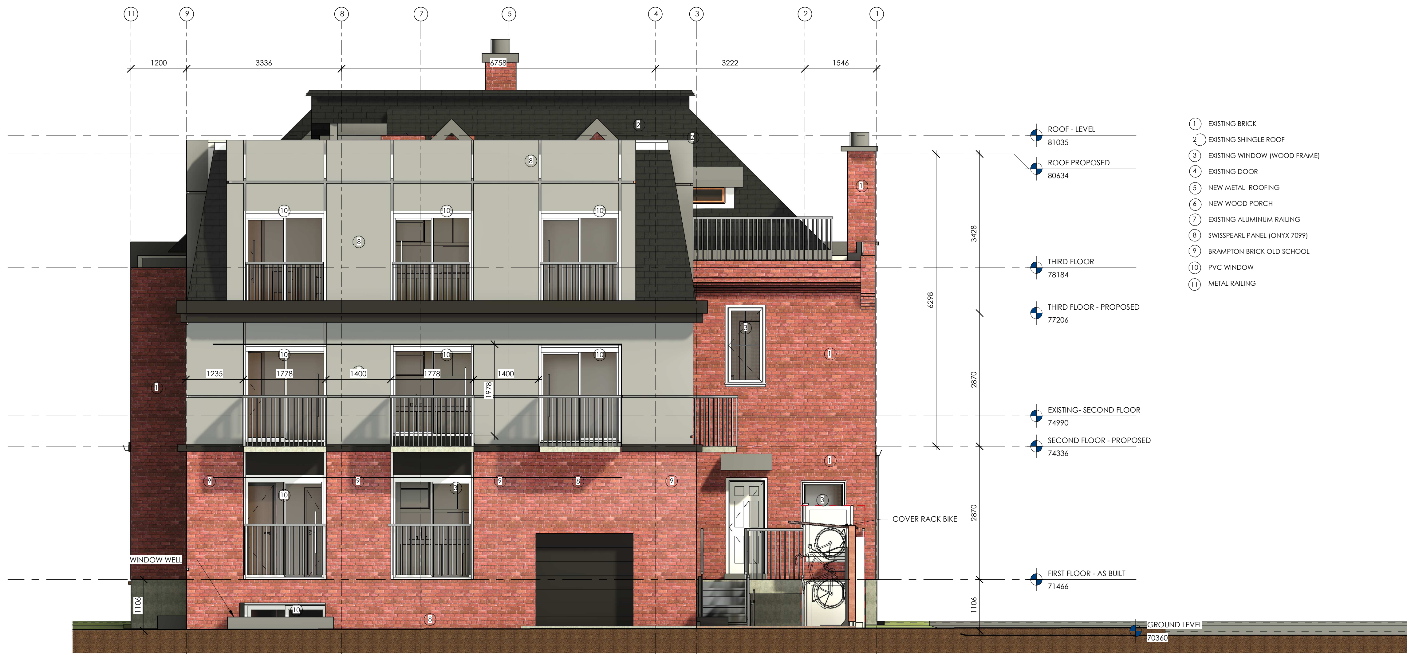
1 NORTH - EAST - ELEVATION 1:50