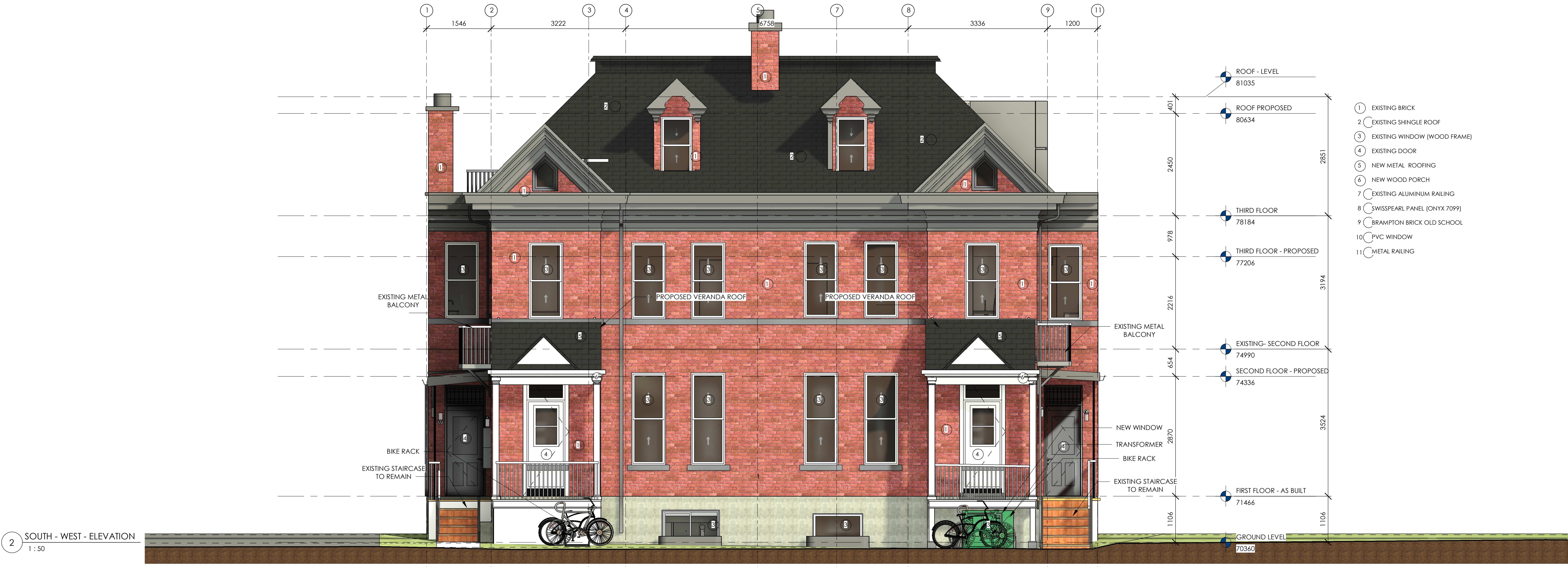
2 SOUTH - WEST - ELEVATION 1:50