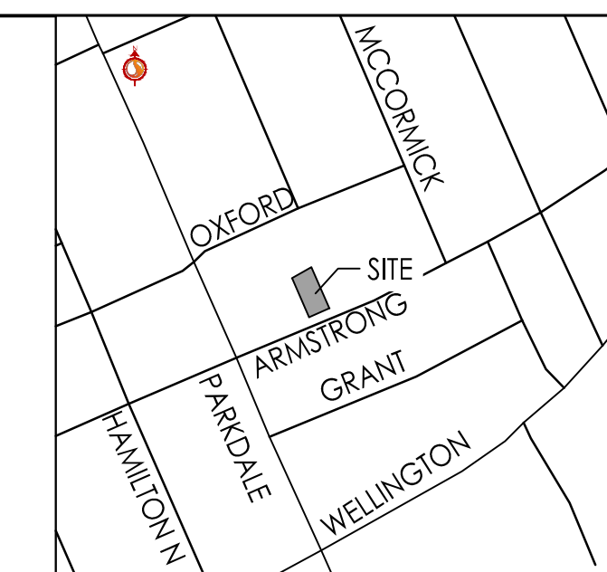
KEY PLAN N.T.S.