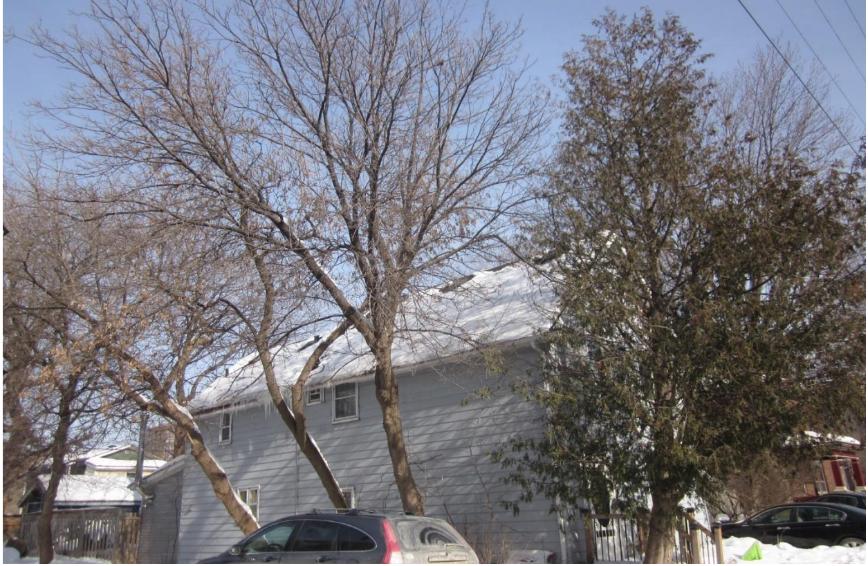
Picture 1. Tree #1, neighbouring white cedar (far right) and Manitoba maples #2, 3 and 4 at 211 Armstrong Street